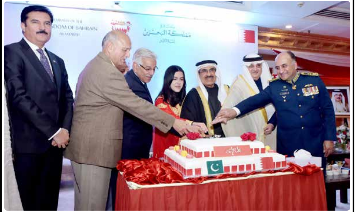
ISLAMABAD: Defence Minister Khawaja Muhammad Asif, Chairman Senate Defence Committee Senator Mushahid Hussain, SAPM Faisal Karim Kundi, Ambassador of Bahrain Ebrahim M Abdulqader Ambassador and others cutting cake to celebrate the National Day of Bahrain.

Soldier, 2 civilians martyred in suicide blast