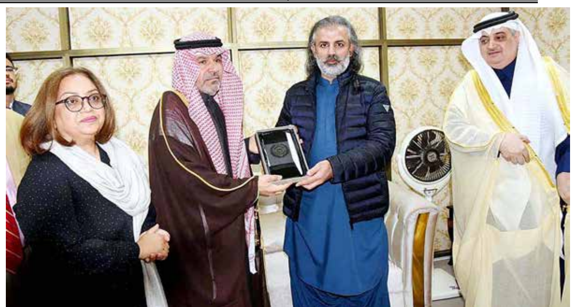
ISLAMABAD: Federal Minister for Narcotics Control, Nawabzada Shazain Bugti presenting a souvenir to Mohammed Bin Saeed Al-Qarni, Director General of Directorate of Narcotics Control of the Kingdom of Saudi Arabia.

BRUSSELS: The European Commission on Monday proposed to strengthen the rules that prevent and combat human trafficking. Every year over 7,000 people become victims of human trafficking in the EU, a commission statement said, adding that the figure can be higher due to many undetected cases. The majority of victims are women and girls but the share of male victims is also on the rise and the yearly cost of human trafficking reaches 2.7 billion ($2.86 billion). Nothing that the forms of the exploitation have evolved with the crime increasingly taking an online dimension, the statement said: "This calls for new action at EU level, as traffickers benefit from opportunities to recruit, control, transport and exploit victims, as well as move profits and reach out to users in the EU and beyond." The updated rules will include forced marriage and illegal adoption among types of exploitation, human trafficking offenses committed or facilitated through information and communication technologies, including internet and social media, mandatory sanctions for legal persons held accountable for trafficking offenses, stepping up demand reduction, and EU-wide annual data collection.—APP