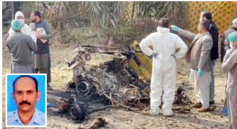
ISLAMABAD: Bomb disposal squad inspecting the bomb blast site in the Sector I 10 area.

PM Shehbaz condemns suicide attack, pays homage to martyred policeman; Country heading towards destruction: Asad Umar