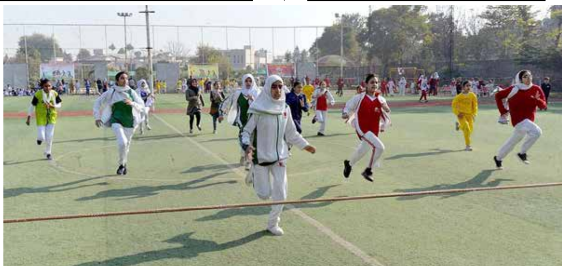
RAWALPINDI: Students participating in 100 Meter race during Annual Sports Gala of The Smart School at Jannah Park.