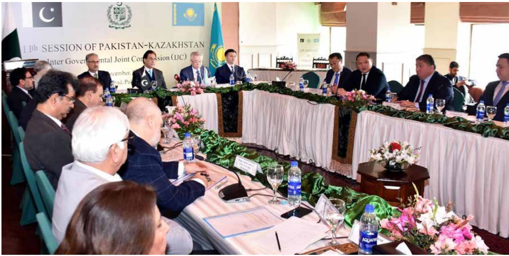
ISLAMABAD: Federal Minister for Economic and Political Affairs Sardar Ayaz Sadiq delivering the welcoming address at 11th Session of Pakistan-Kazakhstan Inter-Governmental Joint Commission.

MOSCOW: Russia and the US are not negotiating a possibility of a presidential meeting, Kremlin spokesman Dmitry Peskov said on Friday. "There are no preliminary contacts in this regard. Of course, any conflict ends at the negotiating table, and this has been repeatedly said. "And of course, first of all, we are talking about the speedy completion of the special military operation by achieving the goals set by the Russian Federation," Peskov said at a press briefing in Moscow. On Thursday, Russian President Vladimir Putin said Moscow would seek to end the conflict in Ukraine "the sooner the better," followed by a statement from the White House that US President Joe Biden would "definitely be ready" to meet with Putin "if there was a serious and real" readiness on the Russian side. According to the spokesman, Russia has progressed in the implementation of one of the goals of its "special military operation," as a significant progress was achieved in Ukraine's "demilitarization." Commenting on the media reports about discussions between Ukrainian President Volodymyr Zelenskyy and Biden on the possibility of a peace deal with Russia, Peskov said he knows nothing about it.—APP