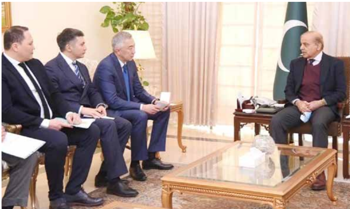
ISLAMABAD: Kazakhstan's delegation led by Deputy Prime Minister H. E Serik Zhumangarin calls on Prime Minister Muhammad Shehbaz Sharif. – DNA