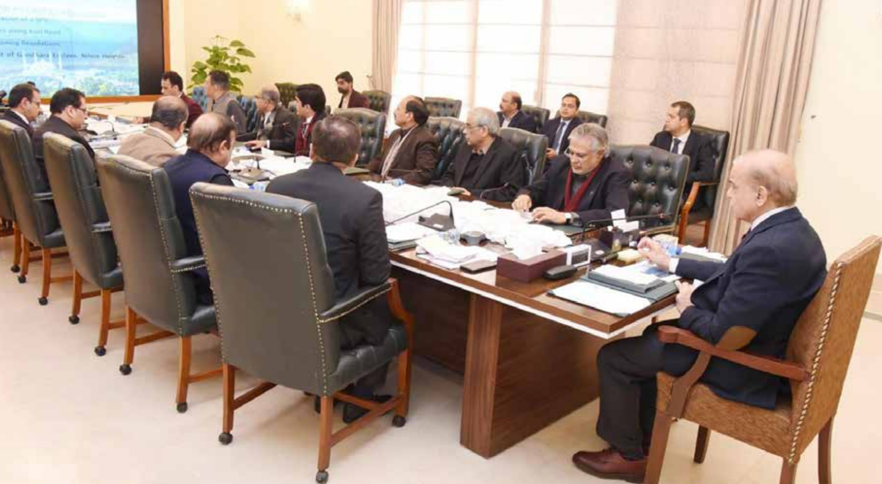
ISLAMABAD: Prime Minister Shehbaz Sharif chairing a meeting on the construction of housing units for Overseas Pakistanis in Islamabad.