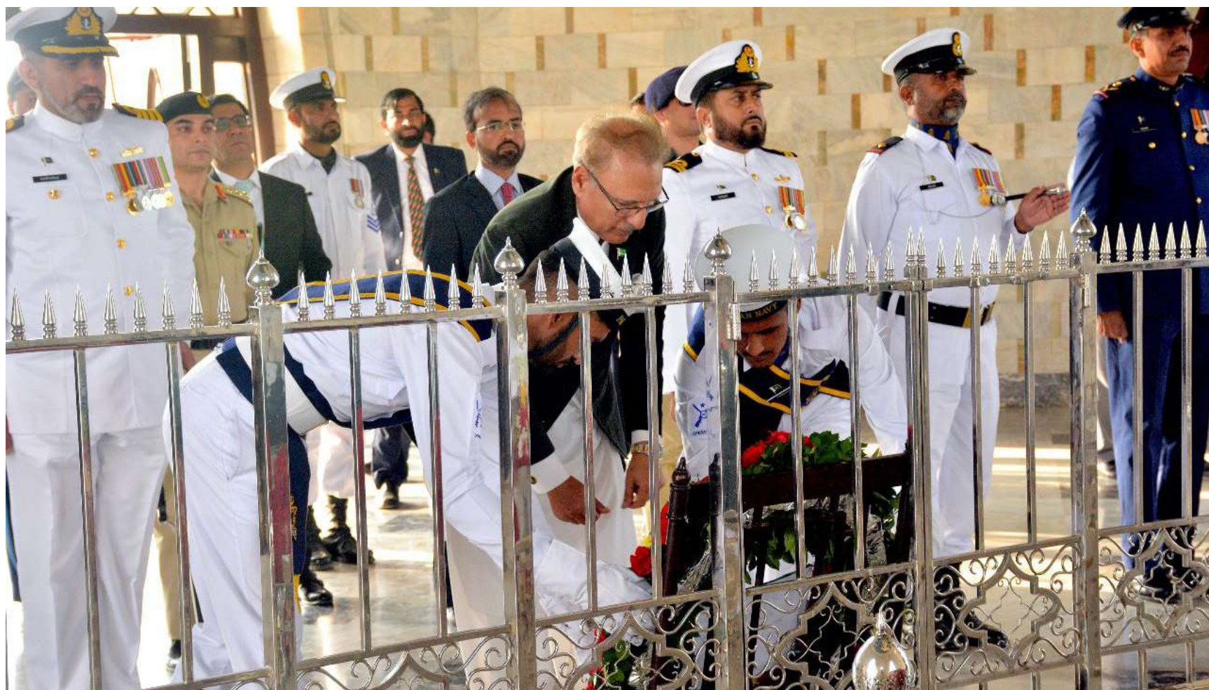
KARACHI: President Dr Arif Alvi laying a floral wreath on the mausoleum of the father of the nation, Quaid-e-Azam Mohammed Ali Jinnah.

DNA ISLAMABAD: The spokesperson of the National Assembly on Sunday assured the parliamentarians of the Pakistan Tehreek-e-Insaf (PTI) to call them to confirm their resignations which have already been tendered to the Speaker. The NA spokesperson has given a statement in a letter to the opposition party-the PTI's members regarding their resignations. "In the context of the news reports being circulated in Electronic and press Media regarding Pakistan Tehreek-e-Insaf decision to appear collectively in the office of the Speaker of National Assembly and confirm their resignations from their respective seats of National Assembly, the Spokesperson of National Assembly Secretariat has drawn attention to the letter written by National Assembly Secretariat on 22nd December 2022 to PTI Vice Chairman Shah Mehmood Qureshi in response to his letter," the statement said Sunday.