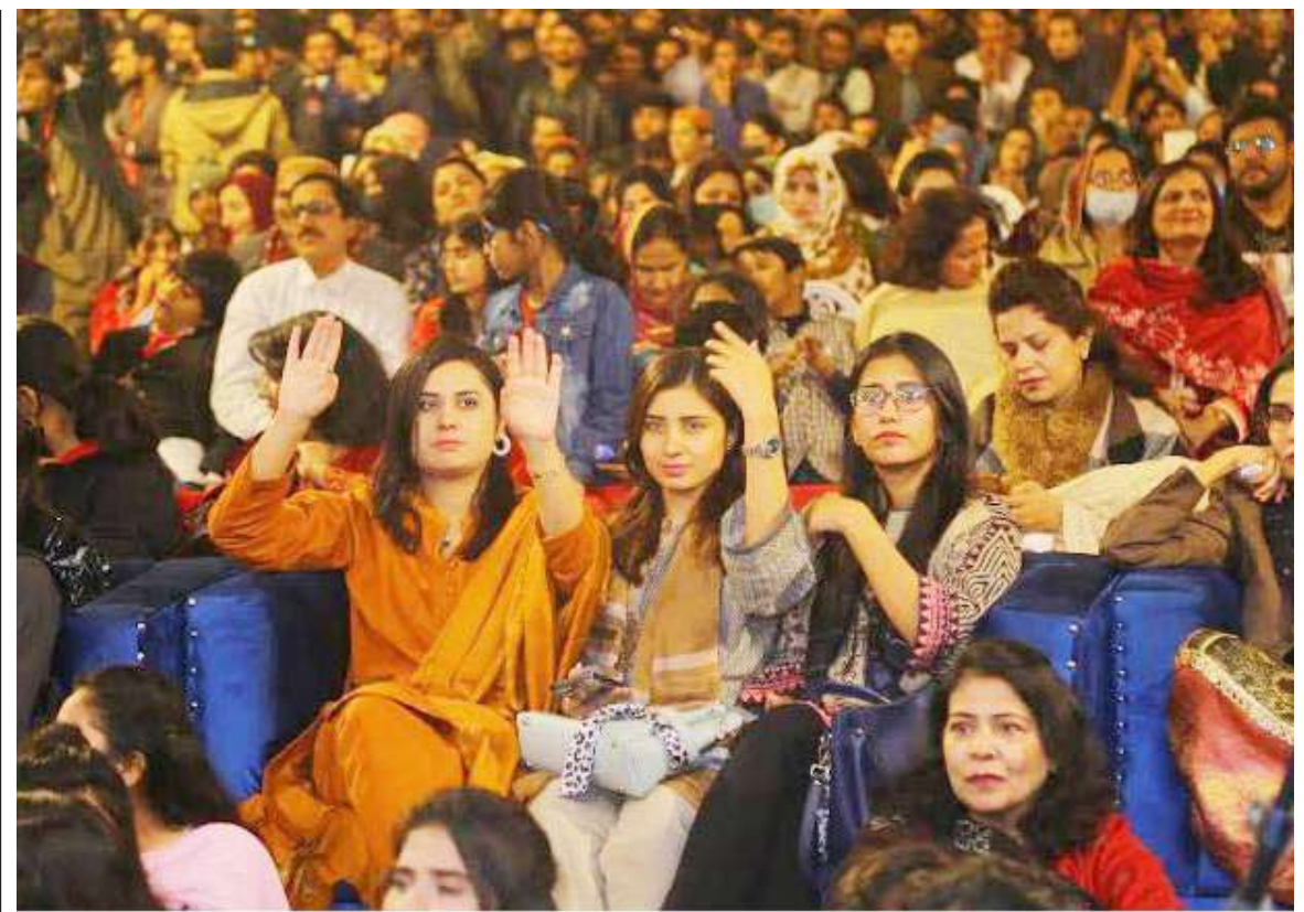
HYDERABAD: Girls attend musical concert during the 2nd day of 8th Shaikh Ayaz Melo.