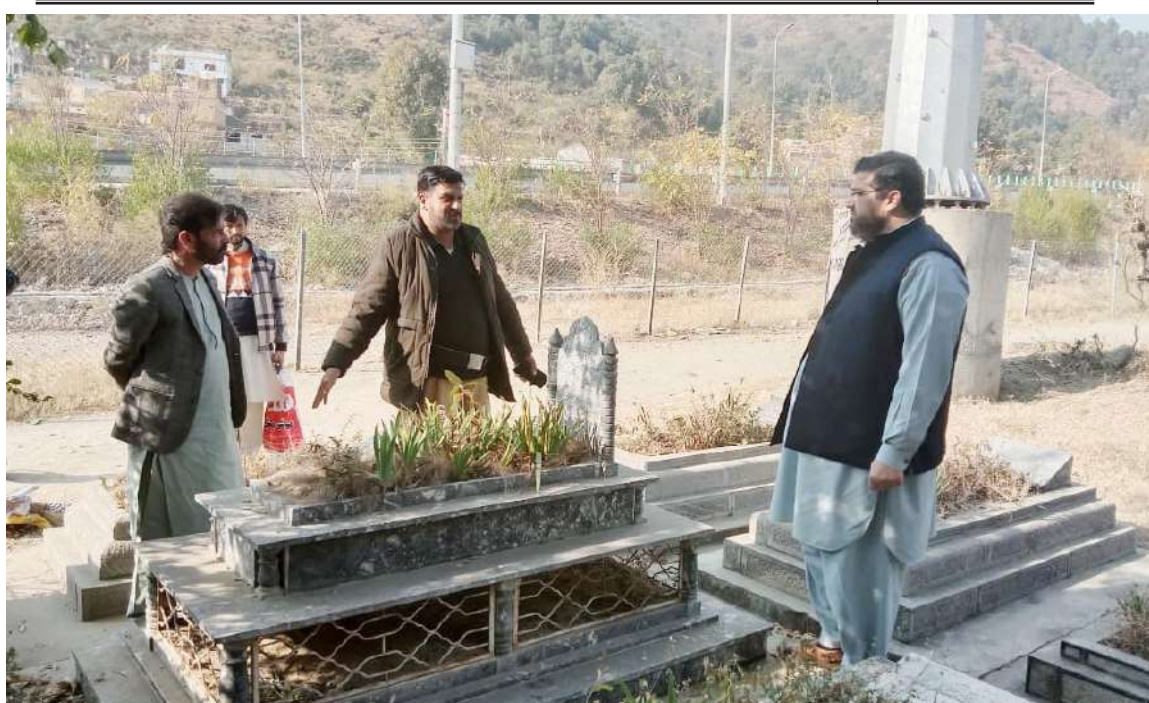
ABBOTTABAD: Addl AC along with Rev. Staff, local police enforced status quo in Selhad village, on public complaints. Give directions to parties with evidences before the concern Revenue officers.

emerging. "The incident of Bannu and Islamabad are condemnable, and this nation brought into being by Quaid-e-Azam would nip in the bud all the nefarious designs of the enemies of this country," he said. Murad Ali Shah said that on this day we must remember the sacrifices and struggles of the people of Kashmir for their just cause. He said that the people of Pakistan were with the oppressed people of Kashmir. The CM also recalled the problems of the people affected by the devastating floods.