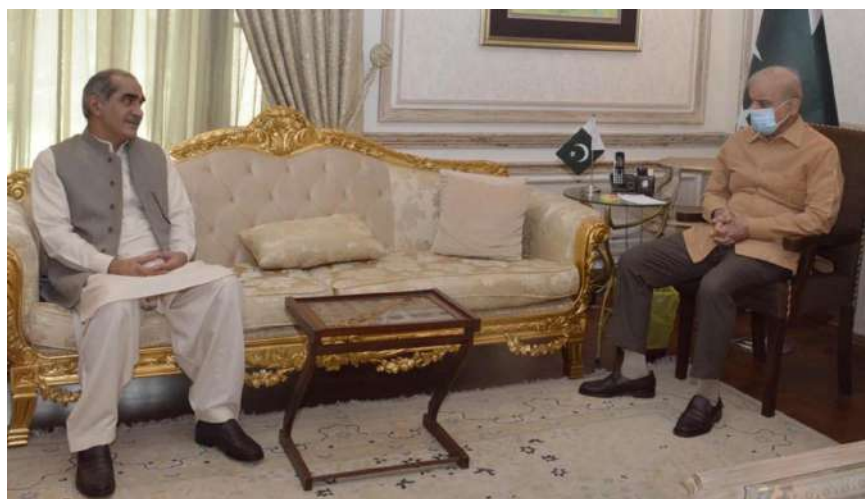
LAHORE: Federal Minister for Railways and Aviation Khawaja Saad Rafique calls on Prime Minister Shehbaz Sharif.

LAHORE: PTI leader Farrukh Habib said on Sunday that lawmakers from his party would be visiting the National Assembly on Wednesday for the acceptance of their resignations as members of the lower house of parliament. The PTI had announced mass resignations from the NA in April this year, a day after party chief Imran Khan's ouster as the prime minister through a no-confidence vote and shortly before Shehbaz Sharif was elected as his successor. Habib while speaking to the media in Faisalabad today that "we are going to the National Assembly on Wednesday to get our resignations accepted". He maintained that all PTI lawmakers had submitted their resignations in writing. "But they accepted just 11 resignations on the basis of mala fide [intentions]," he went on to say, adding, "Now accept our resignations. Why are they being evasive?"