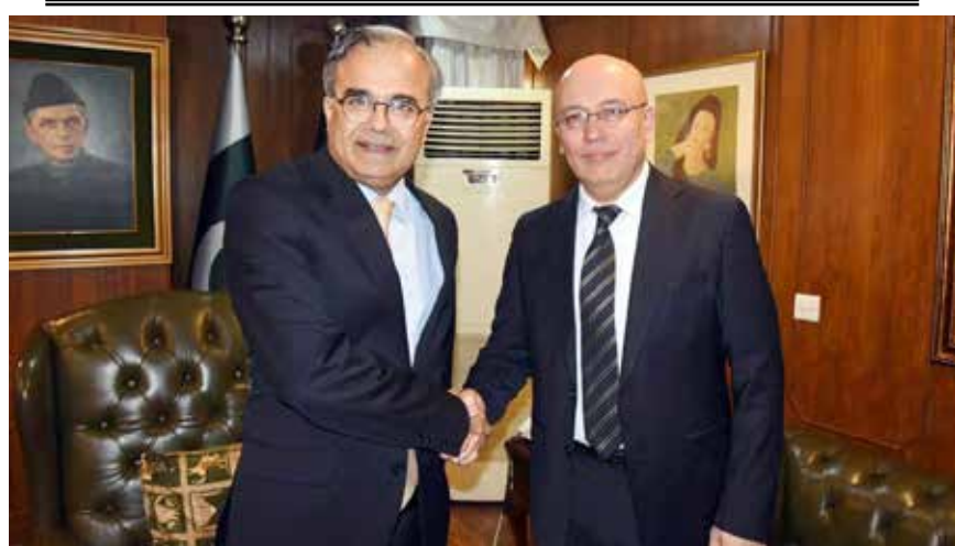
ISLAMABAD: Foreign Secretary Asad Majeed Khan received H.E Furkat Sidikov, First Deputy Minister of Foreign Affairs of Uzbekistan. Wide range of issues of mutual interest were discussed to enhance co-op.