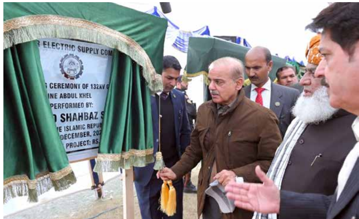
DERA ISMAIL KHAN: Prime Minister Muhammad Shehbaz Sharif laying foundation stone of development projects for Southern Districts of Khyber Pakhtunkhwa.

Alvi backs down from statement regarding ex-COAS