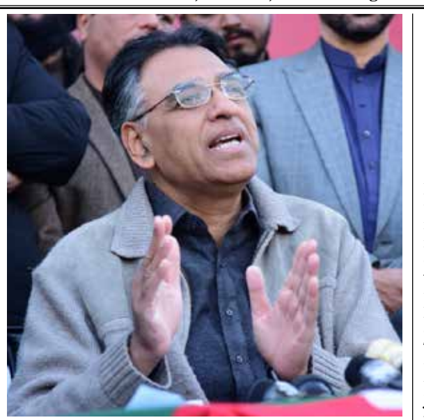
to increase the number of union councils in the federal capital was held up because the PDM had challenged it in court.

the country has a troubled healthcare system. - DNA