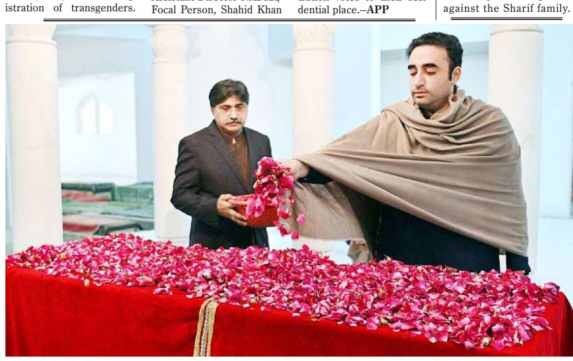
LARKANA: Chairman Pakistan People's Party and Foreign Minister Bilawal Bhutto Zardari showering flowers at the grave of former Prime Minister Shaheed Mohtarma Benazir Bhutto at Garhi Khuda Bakhsh.