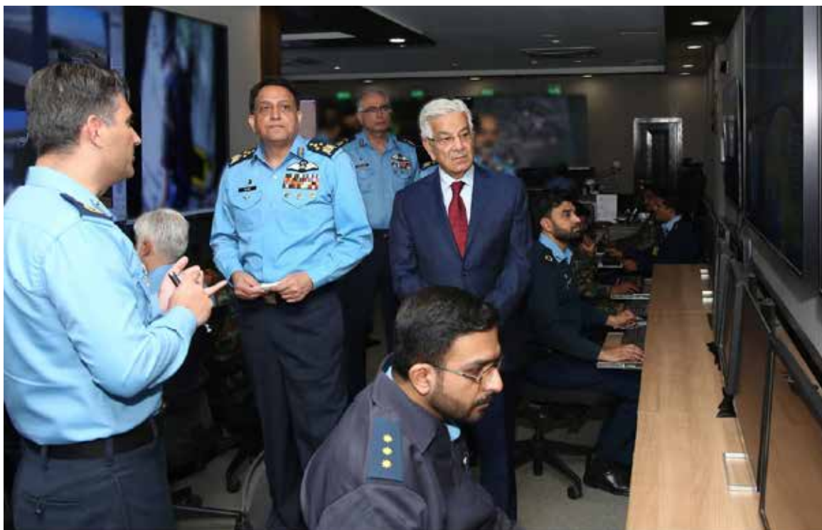
ISLAMABAD: Defence Minister of Pakistan, Khawaja Asif visits Air Headquarters. - DNA

ISLAMABAD: Defence Minister of Pakistan, Khawaja Muhammad Asif, called on Air Chief Marshal Zaheer Ahmed Baber Sidhu, Chief of the Air Staff, Pakistan Air Force during his visit to Air Headquarters. Matters pertaining to evolving geo-strategic environment and regional security situation were discussed during the meeting. The Defence Minister lauded the matchless professionalism of PAF and stated that the government would utilize all its resources to modernize Pakistan Air Force to ensure an impregnable defence of the country. He admired the revamping of training by PAF to produce well-equipped and skillful work force to cope up with ever-changing challenges of aerial defence and national security. He also lauded the exceptional response of Pakistan Air Force during the rescue and rehabilitation of flood victims in the aftermath of recent floods in the country. The Air Chief briefed the visiting dignitary about various ongoing projects being carried out by Pakistan Air Force with special focus on modernization and development of indigenous capabilities. Chief of the Air Staff also briefed the Defence Minister about his vision of PAF's National Aerospace Science & Technology Park (NASTP) project and highlighted that the mega project was aimed at fostering collaborative research, development and innovation in the domains of aviation, space. - DNA