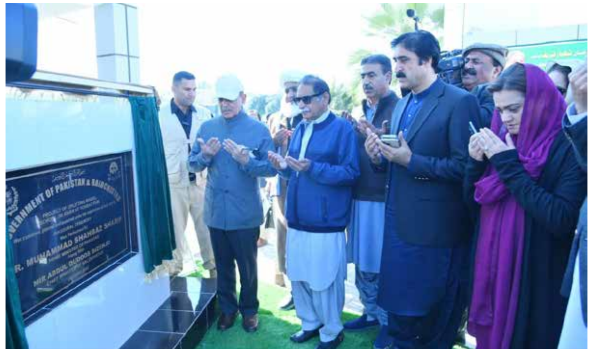
QUETTA: Prime Minister Muhammad Shehbaz Sharif inaugurating the new building of Govt. Boys Secondary School, Ghulam Rasool, Jia Khan in Sohbatpur, Balochistan. - DNA

Putin sends hypersonic missiles to Atlantic