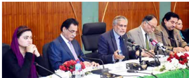
ISLAMABAD: Finance Minister flanked by Ministers of Planning, Commerce, Power, Information addressing a press conference.