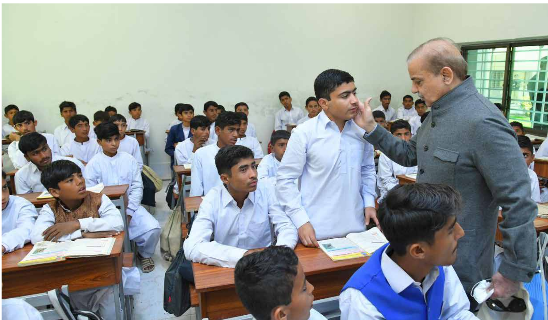
QUETTA: Prime Minister Muhammad Shehbaz Sharif interacting with the students after inaugurating the new building of Govt. Boys Secondary School, Ghulam Rasool, Jia Khan in Sohbatpur.

GREECE: Greece has called on the EU to devise a common solution to drug shortages that have hit multiple member states, the country's health minister said on Wednesday. Speaking to public broadcaster ERT, Health Minister Thanos Plevris said he addressed European Commissioner for Health and Food Security Stella Kyriakidou in a letter on possible solutions to the shortage. Noting that Greece introduced a series of measures on Tuesday to tackle the problem, he stressed the importance of finding a common solution. As an example, Plevris suggested that the centralized import and distribution of raw materials used in the pharmaceutical industry could serve as an immediate solution. He added that the EU should take steps to support the European drug industry as the crisis showed that the bloc could not depend solely on raw material imports from Asia. Plevris added that amid an ongoing outbreak of the flu and other upper respiratory infections, the current high demand for drugs used against them would ease as temperatures rise with the passing of winter, thus normalizing the market. — APP