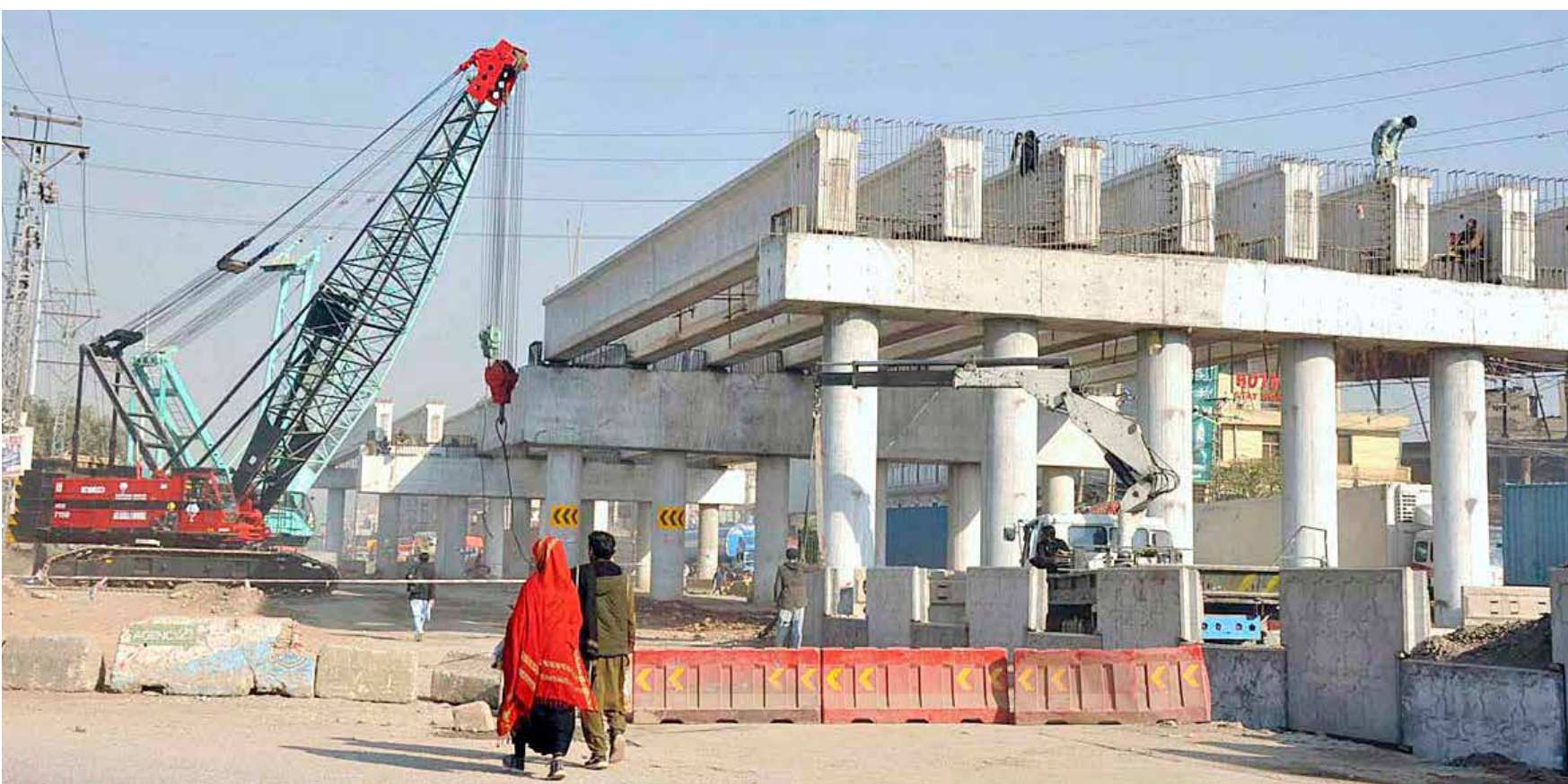
ISLAMABAD: A view of construction work of 9th Avenue flyover at IJP Road during development work in the city.