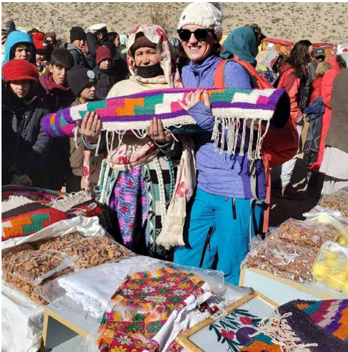
CHITRAL: New Canadian High Commissioner Lislle Lanclon taking interest in handcrafts during her recent visit to Chitral.