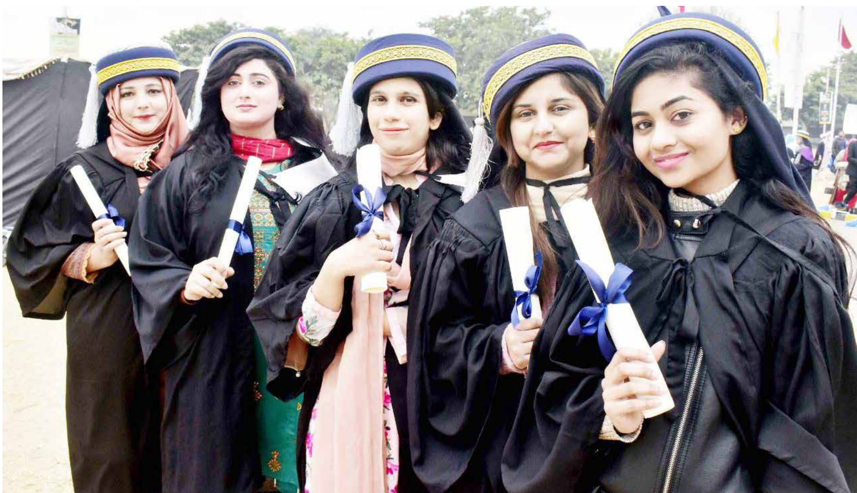
ISLAMABAD: A group photo of students receiving degrees on the occasion of convocation of RIPHA University.