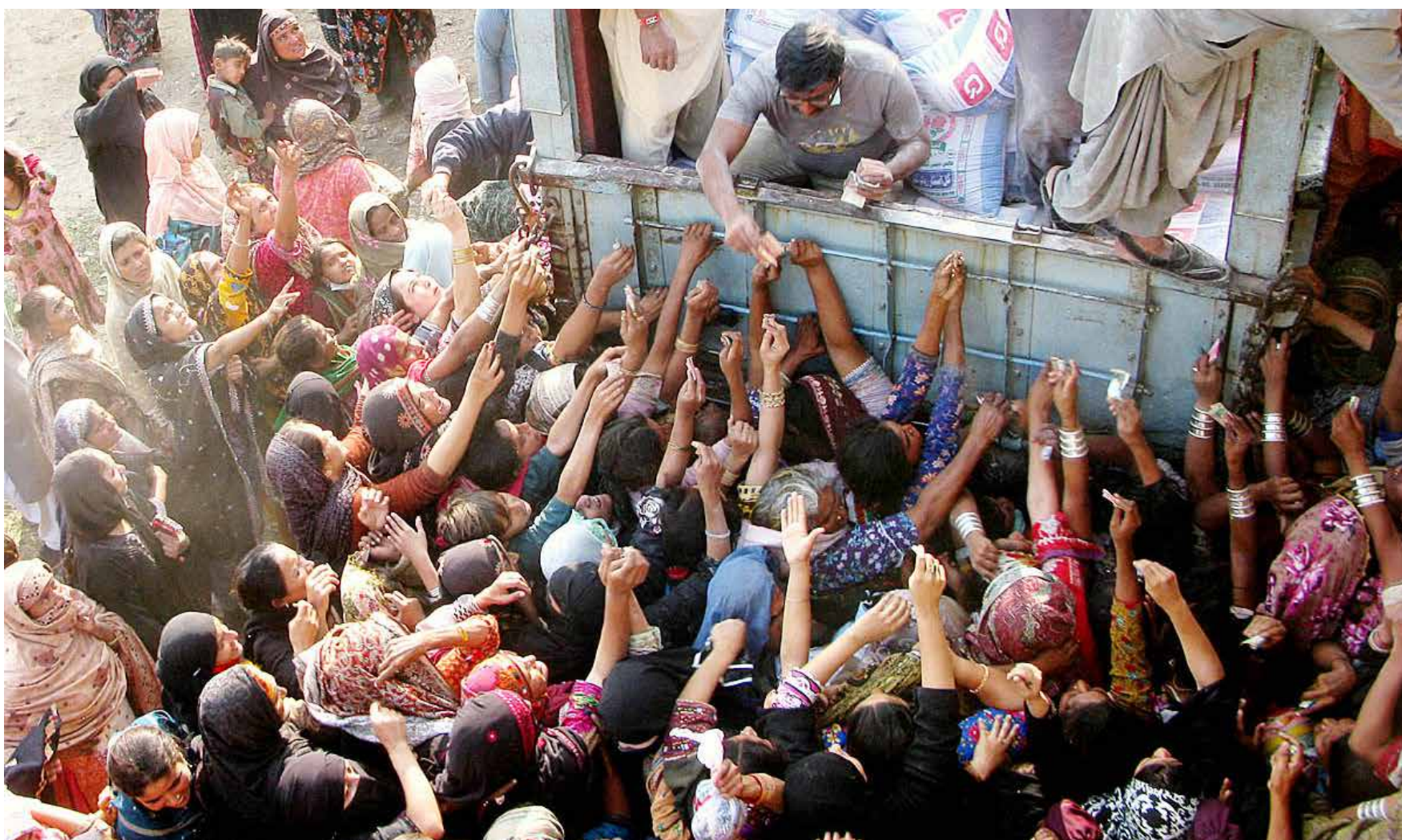
HYDERABAD: Women trying to purchase a few kilograms of flour as the flour shortage has hit most parts of the Sindh province.