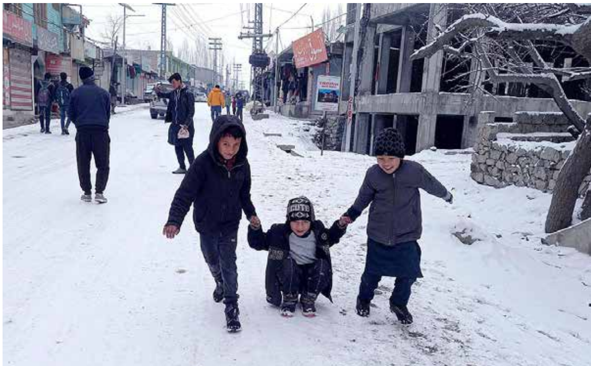
SKARDU: Children enjoying traditional skating on snowy carpeted road during snow fall in Northern Areas of Pakistan.

Aleem, Awn dismiss reports of forming 'new party'