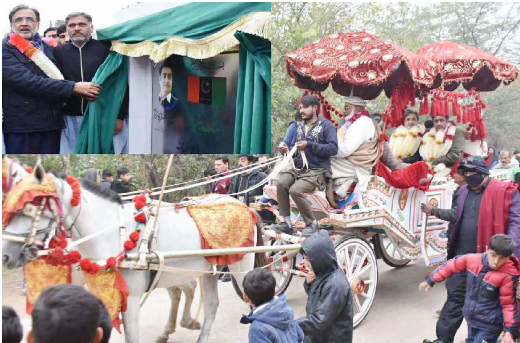
LALAMUSA: Prime Minister Adviser on Gilgit-Baltistan and Kashmir Affairs Qamar Zaman Kaira and former Tehsil Nazim Kharian Nadeem Asghar Kaira welcomed by people of Karnana. Qamar Zaman Kaira inaugurated work on Lalamusa-Dinga link road.— DNA

ISLAMABAD: Showing firmness to their basic objective of maintaining law and order and ensuring peace in the city, personnel of Islamabad police successfully handled security affairs during the last seven months and ensured effective action against criminal elements. With the support of the incumbent government and the Ministry of Interior, the top brass of the force is working hard to upgrade Islamabad police on modern lines, sharpen agility through the provision of resources and boost the morale of its personnel through welfare steps. During the last seven months, multiple steps have been taken to overcome several constraints and boost the morale of the force. All these steps have been aimed at creating a professional—APP