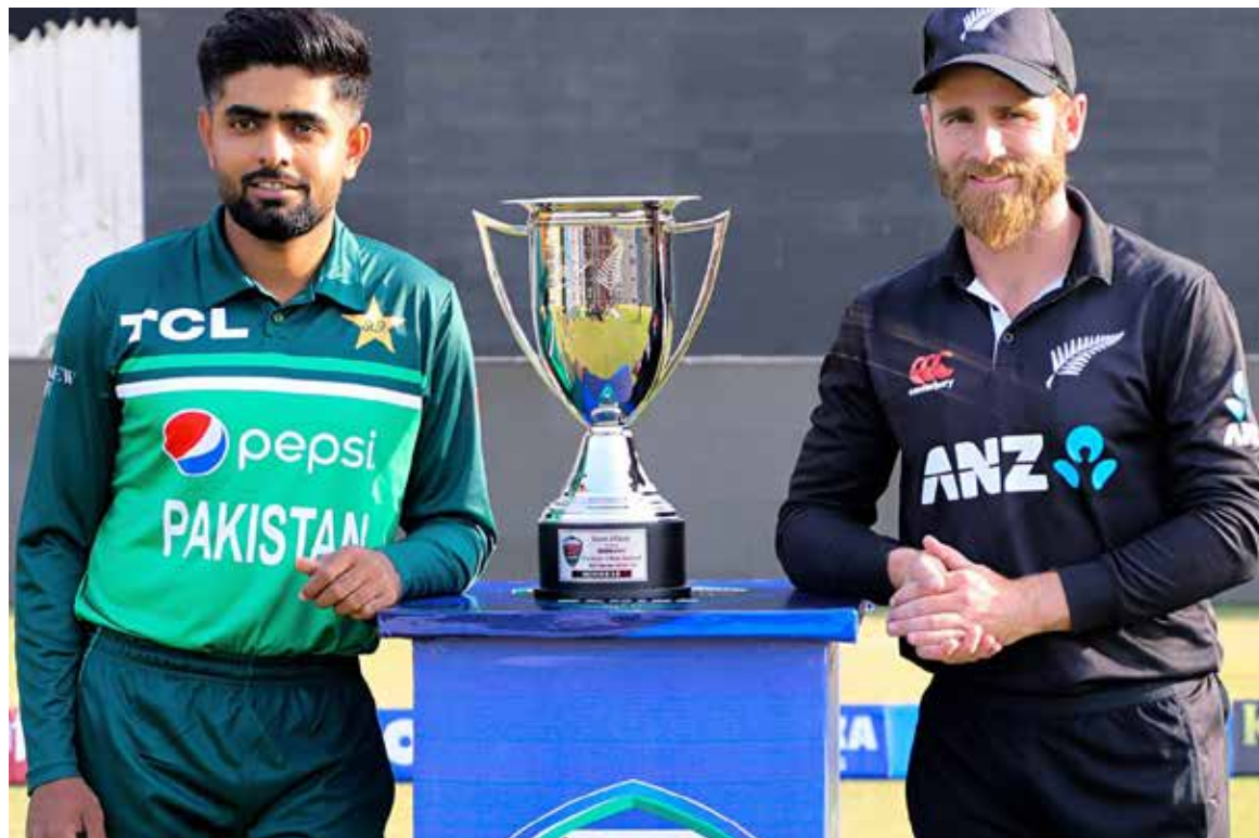
KARACHI: Pakistan's skipper Babar Azam and New Zealand's Kane Williamson posing with ODI series trophy.

world number one Swiatek for the first time in the semi-finals. She came out firing against Trevisan, racing to a 3-0 lead after breaking the Italian's opening serve. Trevisan showed the fighting qualities that helped her beat Sakkari to claw back, converting a break point in the fifth game and holding serve to get it back on level terms. They exchanged breaks again on the fast hard courts before Pegula pounced once more to clinch the set on the Trevisan serve with a backhand winner. It was all Pegula in the second as she put her foot to the floor, racing 5-0 clear. But the Italian refused to give up and broke back as the American served for the match before her comeback faltered. Tiafoe picked up where Pegula left off, surged through the first set 6-2 against Lorenzo Musetti before the Italian retired due to a right shoulder injury. He broke Musetti's serve early, with the Italian increasingly touching his right shoulder as the set wore on before receiving treatment and calling it a day. "I thought it was a really high level... obviously at the end there I could see he was touching his shoulder a lot," said Tiafoe. "I didn't want to win this way. I hope Lorenzo feels better." - APP