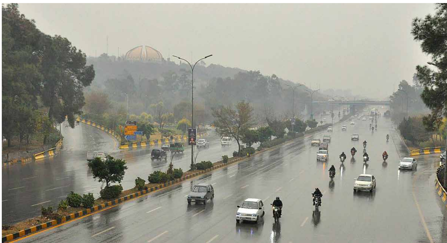
ISLAMABAD: Vehicles on the way at Islamabad Expressway during rain on Wednesday.