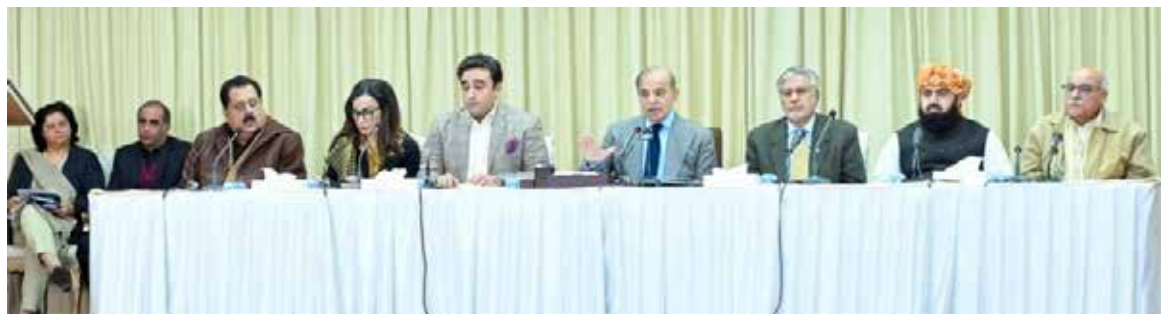
ISLAMABAD: Prime Minister Shehbaz Sharif flanked by his allies briefs media about the outcome of the Geneva Conference.