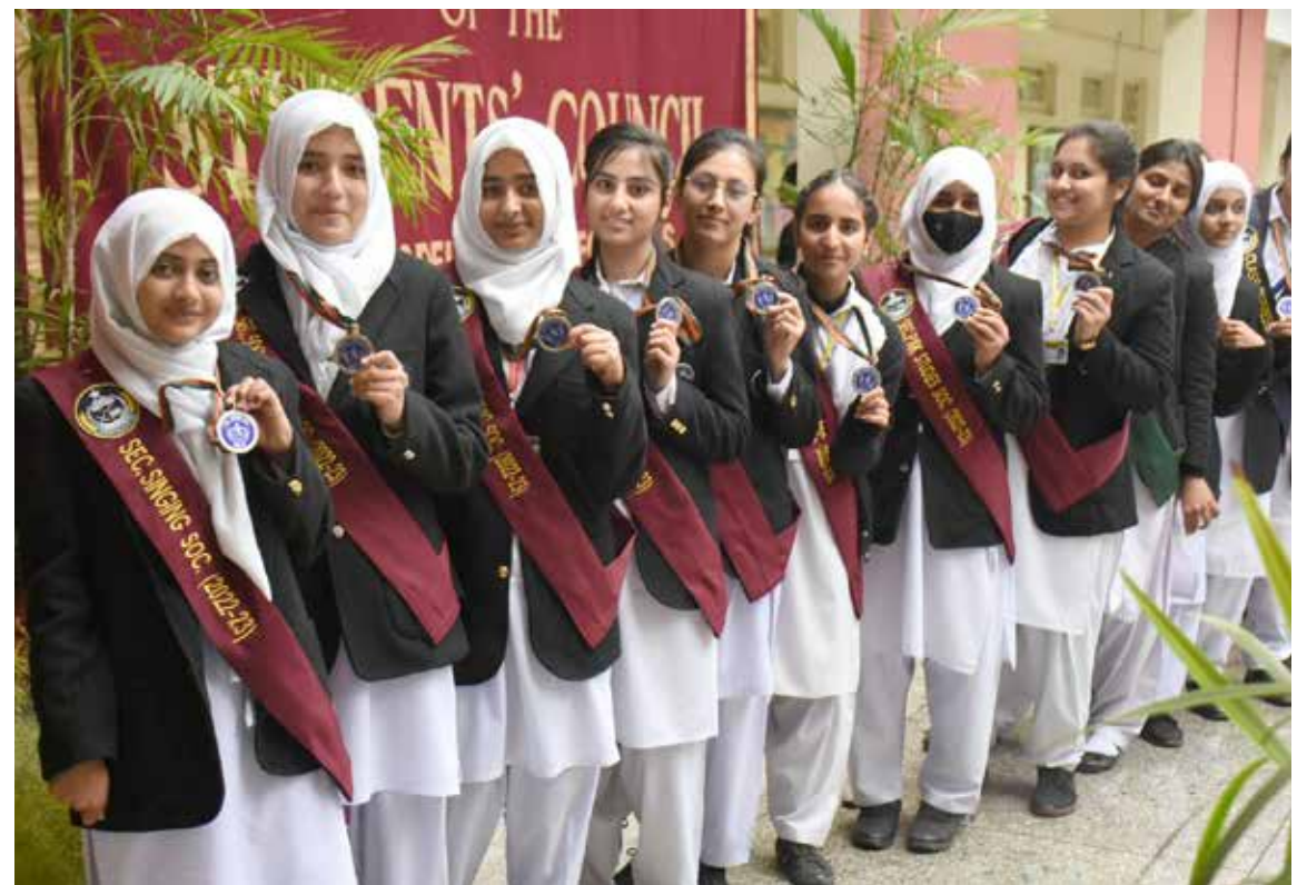
ISLAMABAD: Students posing for a picture during the oath taking ceremony held at ICMG, F-6/2.