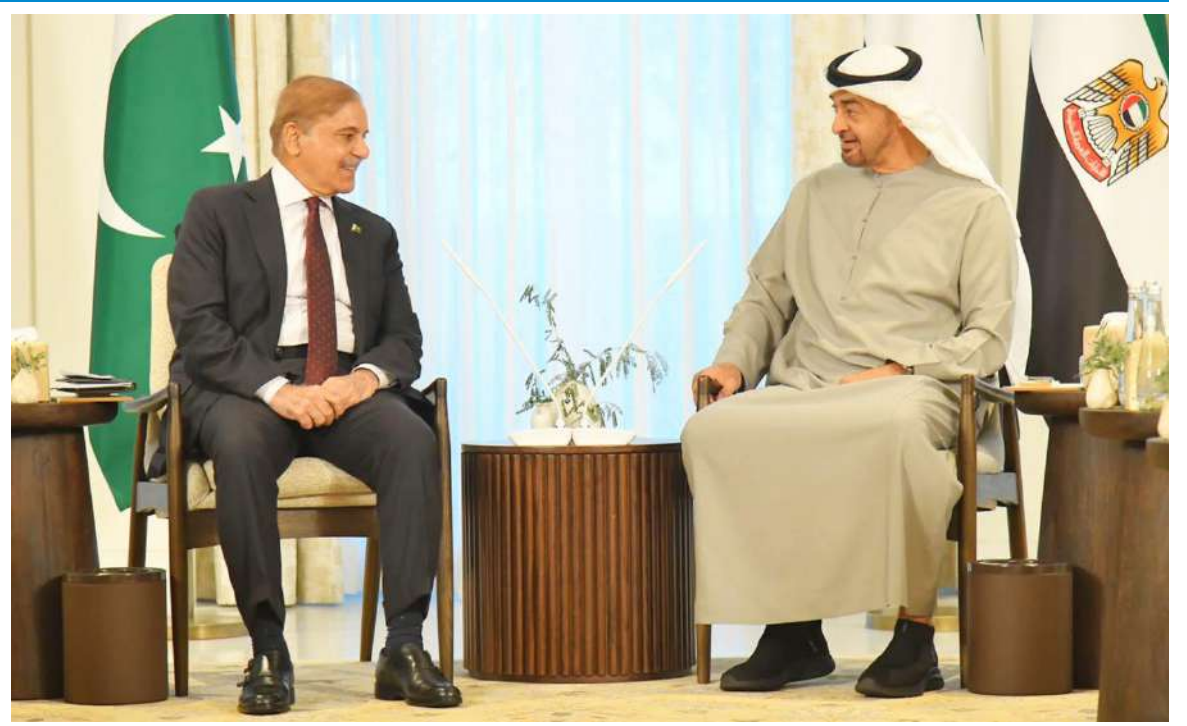
ABU DHABI: ABU DHABI: Prime Minister Muhammad Shehbaz Sharif meets the President of the United Arab Emirates His Highness Sheikh Mohamed Bin Zayed Al Nahyan.

everything goes well. The government will try its best to prolong the caretaker government on the pretext of an ongoing census. The matter will certainly go to the courts once again. There is also a possibility of enforcement of economic emergencies in the country. Legal experts are of the view under this pretext the government may delay the elections for six months. But in order to impose economic emergency the government will have to come up with some solid reasons. The KP government has not been dissolved. The PTI perhaps wants to make sure that first the Punjab dissolution should take place then it will go for the KP assembly dissolution. The PTI probably still has some doubts that is why it wants to wait for the next 48 when the Punjab assembly dissolution shall come into effect. Perhaps, that is why PTI Chairman Imran Khan delayed his address to the nation. Meanwhile, the PML N supreme Nawaz Sharif has come down heavily on the PML N leadership for what he thinks is a failure to contain PTI in the Punjab. He is unhappy with the way the leadership had handled the Punjab situation. Some senior leaders have advised him to go for elections instead of continuing at the federal level. However the Shehbaz Sharif camp is strongly opposed to this preposition.