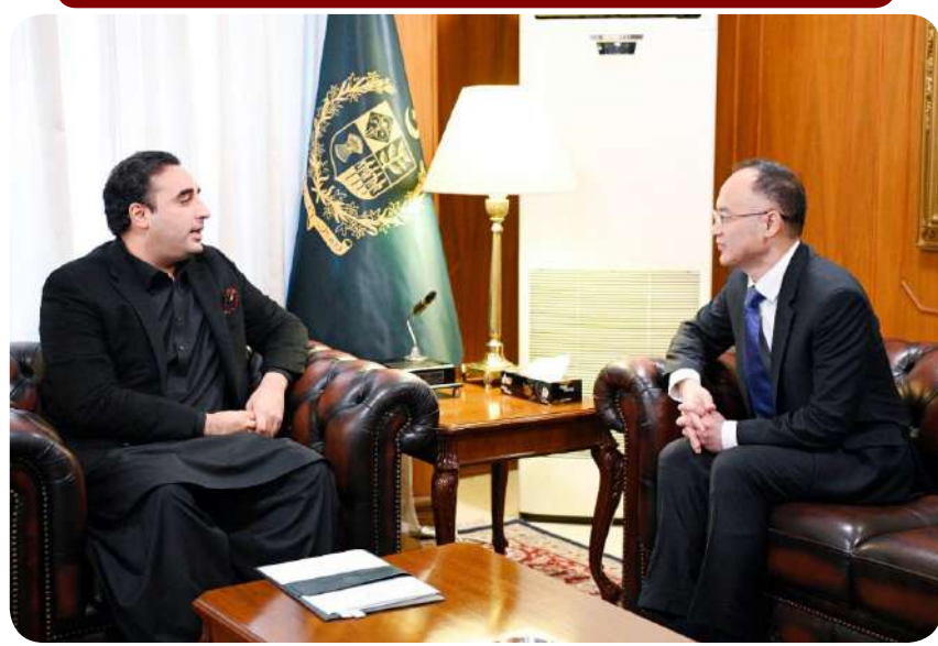
ISLAMABAD: Outgoing Chinese Ambassador Nong Rong paid farewell call on the Foreign Minister Bilawal Bhutto Zardari. The DHM of the Embassy Ms. Pang is also present on the occasion.