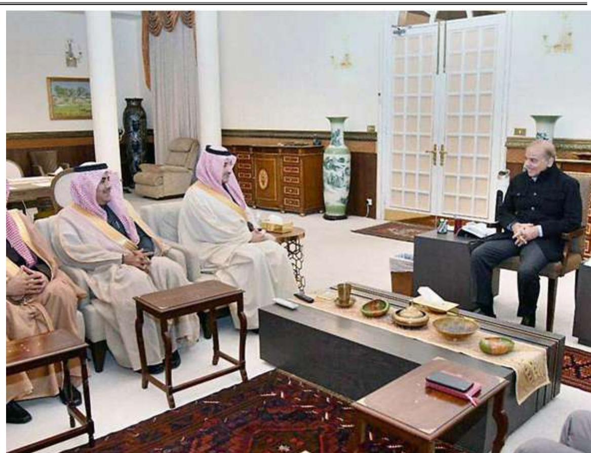
ISLAMABAD: A delegation of Saudi Fund calls on Prime Minister Muhammad Shehbaz Sharif.