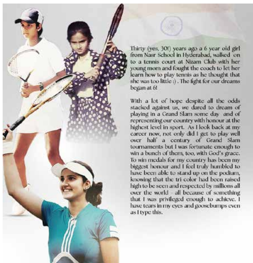
Thirty (yes, 30!) years ago a 6 year old girl from Nasr School in Hyderabad, walked on to a tennis court at Nizam Club with her young mom and fought the coach to let her learn how to play tennis as he thought that she was too little :) The fight for our dreams began at 6!

my heart." "[Tennis] is all I've known throughout my life," the star wrote as she recounted the extent and expanse of her Tennis career. "It's been 20 years of being a professional athlete and 30 years of being a tennis player," she stated. Commenting on her decision to retire in 2023, Sania said: "My Grand Slam journey started with the Australian Open back in 2005. So, it goes without saying that this would be the most perfect Grand Slam to end my career with." The Australian Open this year is set to start on January 16. Sania played her first Grand Slam in the Australian open 18 years ago. After playing in this Grand Slam, she plans to play in the Dubai Open in February. However, moved as she may feel, Sania wrote that her two most prominent feelings at the time of her retirement were "gratitude and pride". "I take pride in everything I have been able to achieve over the last 20 years of my professional career and I am so grateful for the memories that I have been able to create," she said.