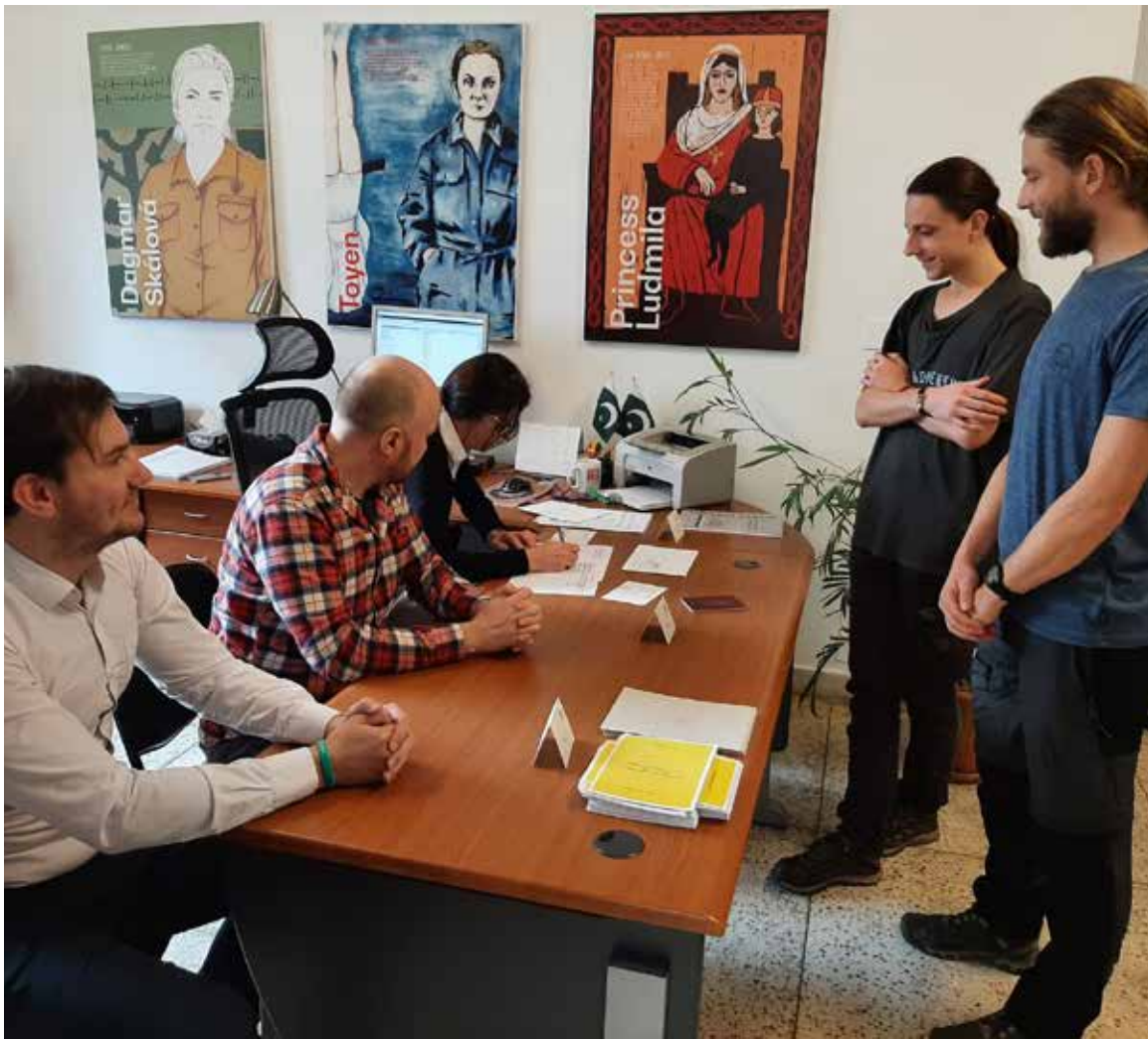
ISLAMABAD: A Czech citizen is casting his vote for presidential election in polling station sets up at Czech embassy Islamabad. – DNA

ISLAMABAD: Islamabad police issued more than 43,000 e-challans to motorists over various traffic violations through safe city cameras during the last one and half years and succeeded to decline the ratio of road mishaps. The e-challans are being issued over red-signal violations, lane violations, over-speeding, zebra crossing, violating one way and other traffic rules violations. Legal action is also being taken against the traffic rules violators who did not pay challan fees. In case of non-payment of fines, police said that vehicles of violators are being seized within seven days of issuance of e-challan. So far, more than 20 vehicles have been impounded in different police stations. A copy of the challan is also attached with the master file of the vehicles at the excise office over non-payment of penalty amount within the given time.—APP