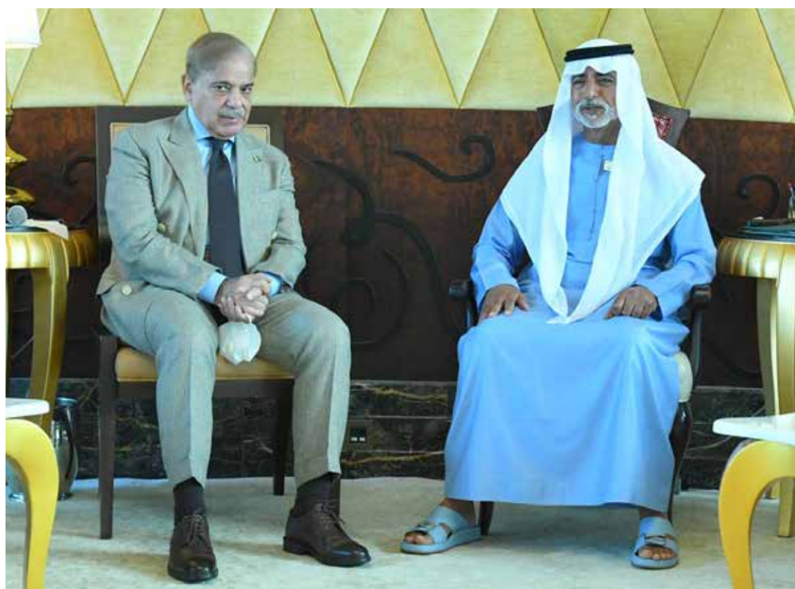
ABU DHABI: Minister for Tolerance of United Arab Emirates calls on Prime Minister Muhammad Shehbaz Sharif.