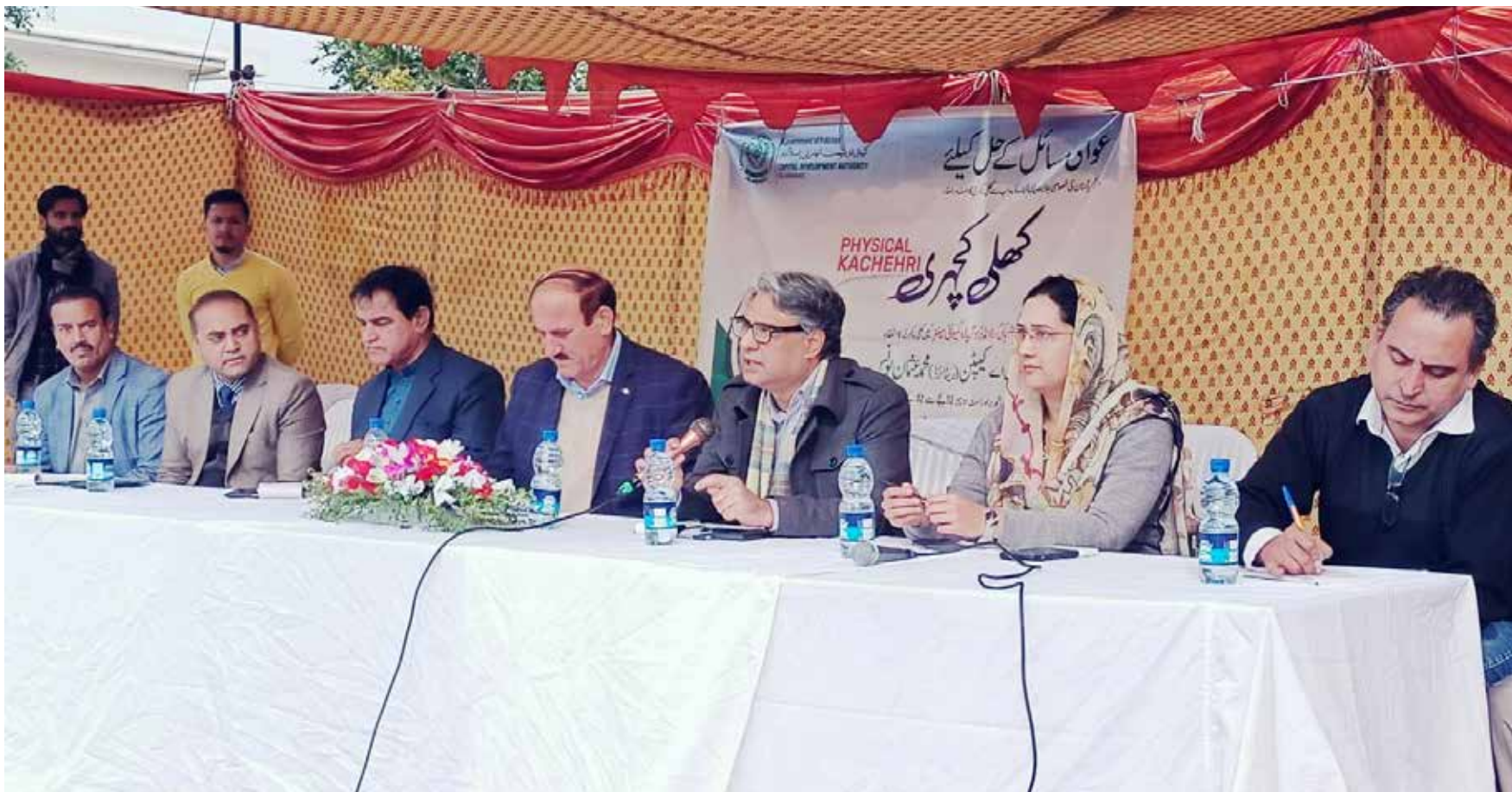
ISLAMABAD: The administration of CDA on the special directive of Prime Minister holds Khuli-Kachahry at the Hockey Ground of Islamabad. - DNA

JERUSALEM: Israel's top court ruled Wednesday that a senior member of premier Benjamin Netanyahu's newly formed government cannot serve as minister due to a recent tax evasion conviction. The decision was slammed by Prime Minister Netanyahu's coalition, which vowed to push ahead with controversial measures that would weaken the Supreme Court and its power to strike down legislation. Netanyahu returned to power last month at the head of a coalition with extreme-right and ultra-Orthodox Jewish parties following Israel's November 1 election. His appointment of Aryeh Deri as health and interior minister "could not stand" since it was "extremely unreasonable", according to a summary of the court's decision. - Agencies