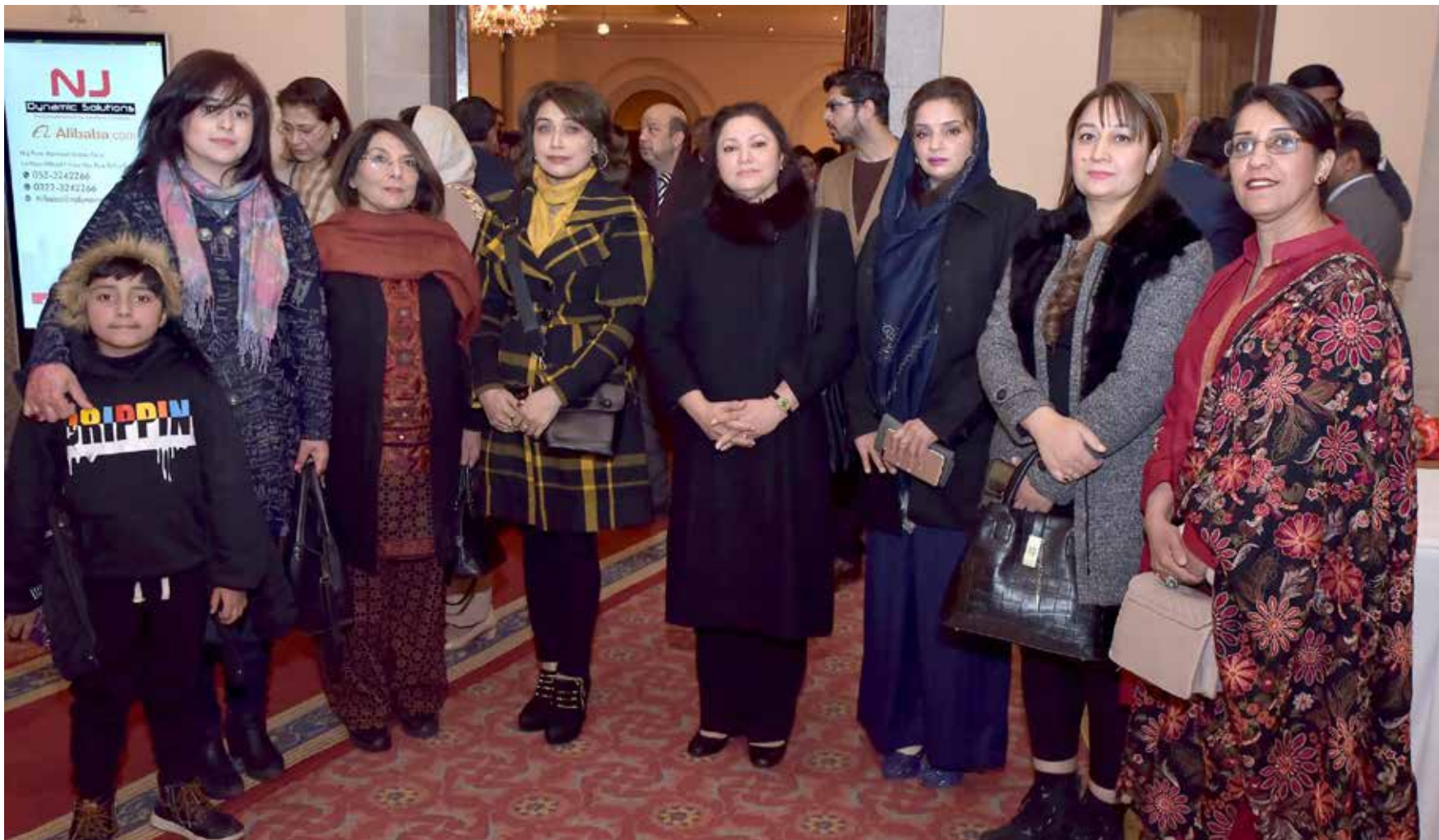
ISLAMABAD: Businesswomen posing for a picture on the occasion of 15th Chambers Presidents conference organized by the RCCI, at Islamabad Serena Hotel.—DNA

ISLAMABAD: The federal government has paid more than Rs 29.7 billion to the Khyber Pakhtunkhwa province on account of natural gas royalty and the Gas Development Surcharge (GDS) during the last three years. "Around Rs 24,178.42 million royalty on natural gas and Rs 5,573.65 million Gas Development Surcharge (GDS) on natural gas have been paid to the KP province during a three-year period," according to an official document available with APP. As per the breakup, the government paid Rs8,821.53 million royalty and Rs Rs 68.22 GDS to the province during the fiscal year 2019-20. —APP