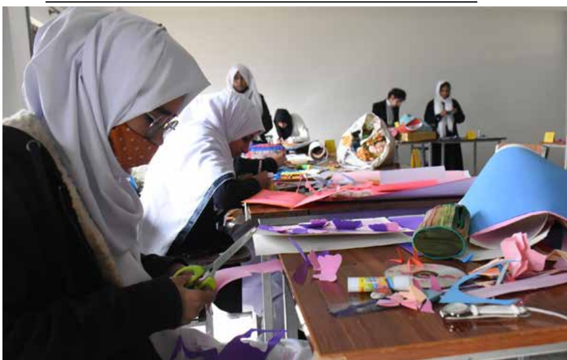
FAISALABAD: Students are busy in card making competition held at model college for girls Humak in connection with intercollegiate ceremony.

Initially the system would be launched under pilot project however, if it attain success it would be expanded to the whole country. The minister said the method of payment would also allow beneficiaries to save some of their amount in the banks which would not only help in financial inclusion of women but also increase their financial literacy. The already registered beneficiaries would not have to get involved in banking process, their transfer to bank accounts would be the responsibility of BISP. Shazia Marri said the country was currently facing multiple challenges and programmes like BISP prove to be beneficial for the vulnerable segments of society affected by these challenges. —APP