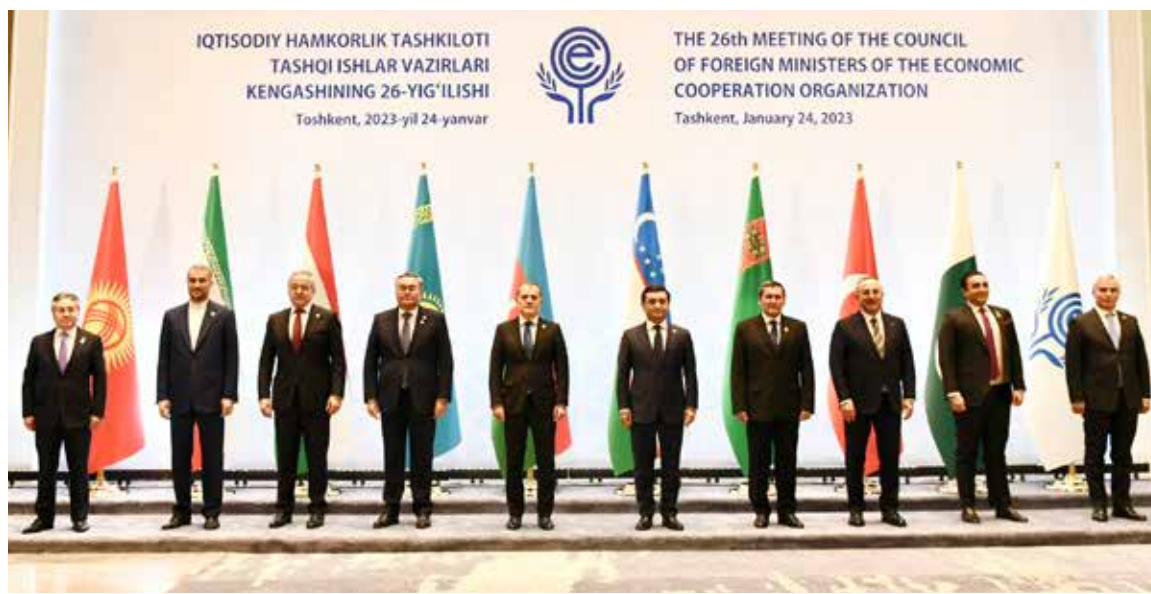
TASHKENT: Foreign Minister Bilawal Bhutto Zardari in a group photo with his counterparts from Economic Cooperation Organization member states during 26th meeting of Council of Foreign Ministers of ECO.