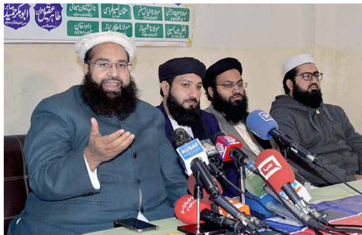
ISLAMABAD: Special Assistant to the Prime Minister on Religious Harmony Maulana Tahir Mehmood Ashrafi addressing a press conference at Jamia Masjid Maaz Bin Jabal.