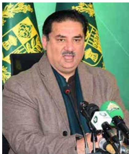
al Transmission and Despatch Company's (NTDC) 1,112 grid stations across Pakistan have been restored. "The electricity was completely restored today at 5:15am," he added. However, people were complaining in Ka-

ISLAMABAD: Power Minister Khurram Dastgir Khan Tuesday said that the government is concerned about the back-to-back failure of the national grid and will investigate whether the system was "hacked" by external forces. While speaking at a press conference, 24 hours after the country plunged into darkness due to a "frequency" fault in the transmission system, the minister said that the "possibility of foreign intervention through the internet is low," however, the matter will be probed as there have been multiple incidents recently. The federal minister said that Prime Minister Shehbaz Sharif has formed a three-member inquiry committee which will be headed by Minister of State for Petroleum Musadik Malik. Dastgir further said that there will be a shortage of electricity and the citizens will face loadshedding in the next 48 hours. He added that the system will be completely restored by Thursday. He said that Nation-