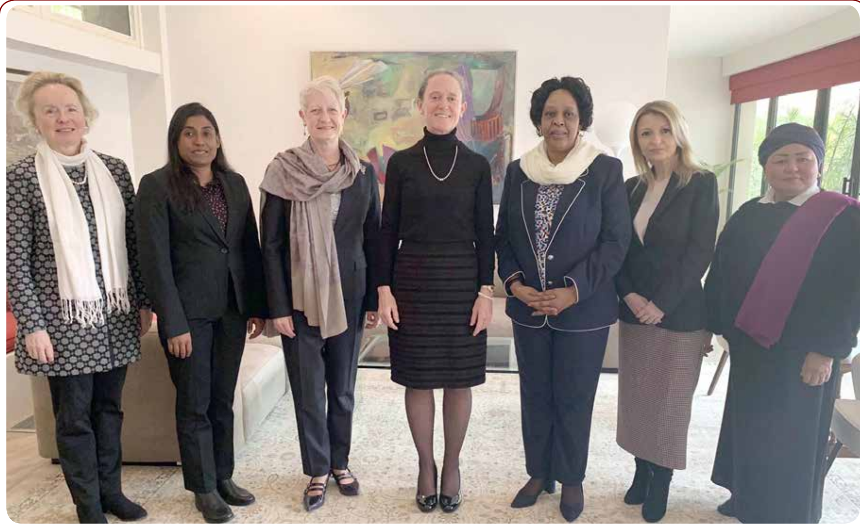
ISLAMABAD: High Commissioner of Canada Leslie Scanlon hosted women ambassadors and high commissioners based in Islamabad and discussed how they can work together to advance women related issues. Seen in the picture from left to right are Ambassadors of the Netherlands, Maldives, European Union, Kenya, Bulgaria and the Philippines. - DNA

ISLAMABAD: Health officials on Tuesday said that only three new Coronavirus cases were reported during the last 24 hours across the country. As per data shared by the National Institute of Health (NIH), the case positivity ratio was 0.09 percent while 11 patients were in critical condition. No death was reported from the Coronavirus in the last 24 hours while 3,209 Covid-19 Corona tests were conducted. As many as 325 tests were conducted in Lahore out of which no case was confirmed, while 205 tests were conducted in Islamabad out of which no case was reported. One case was reported in Faisalabad out of 167 test with a ratio of 0.60%. Meanwhile, Minister for National Health Services, Regulations and Coordination, Abdul Qadir Patel said that the government has strengthened the role of Border and Health Services in Pakistan to deal with any sub-variant of Covid-19. The minister said that there was a surveillance system at all entry points of the country including airports. - APP