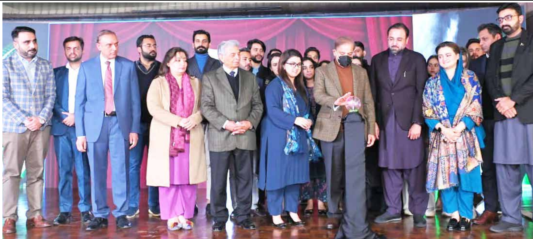
ISLAMABAD: Prime Minister Muhammad Shehbaz Sharif inaugurates PM Youth Loan Scheme for Business and Agriculture.