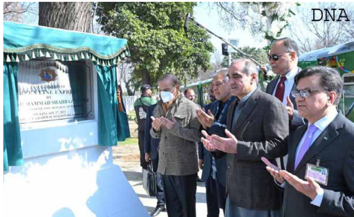
ISLAMABAD: Prime Minister Muhammad Shehbaz Sharif inaugurates Greenline Express Train Service (Margalla-Karachi) at Margalla Railway Station.