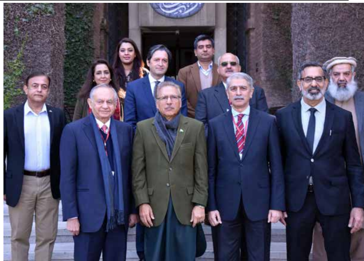
WWW President Dr Arif Alvi in a group photo with the leadership of the Lahore University of Management Sciences LUMS.

BAGHDAD: Iraq and France on Thursday inked a strategic partnership agreement to enhance bilateral cooperation in various areas including energy and security, according to Iraqi officials. The agreement was signed during Iraqi Prime Minister Mohammed Shia' al-Sudani's one-day visit to France's capital Paris, after he met with French Prime Minister Elisabeth Borne and talked with President Emmanuel Macron, al-Sudani's media office tweeted. During talks with Macron, the two leaders discussed bilateral ties, regional and international issues of common concern, and joint cooperation in vital sectors, said the media office's press release. The agreement covers cooperation in such areas as combating terrorism and extremism, cultural exchange, crisis management, combating economic and organized crime, protecting the environment and promoting human rights, which, al-Sudani tweeted on Thursday, "lays down a road map for expanding our two countries' cooperation in various fields." The past years have witnessed deepened bilateral exchanges. Macron has visited Iraq twice, one in 2020 and another in 2021. France-headquartered oil producer TotalEnergies signed a deal with the Iraqi government in 2021, agreeing to invest in oil, gas and renewables projects in southern Iraq over 25 years.—APP