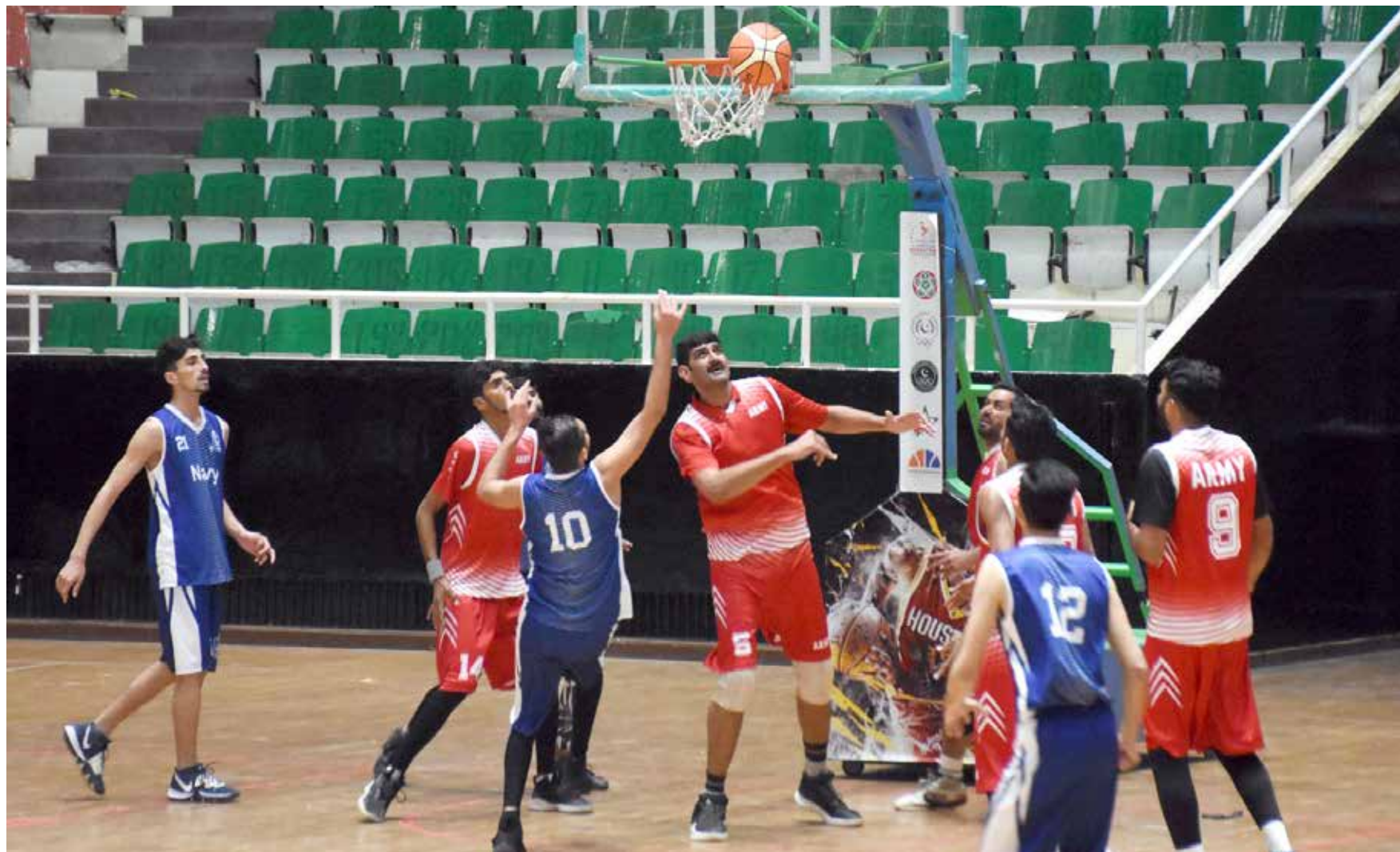
ISLAMABAD: Pakistan Army and Navy players competing during first match of Inter Departmental National Basketball Championship organized by Pakistan Basketball Federation (PBBF).