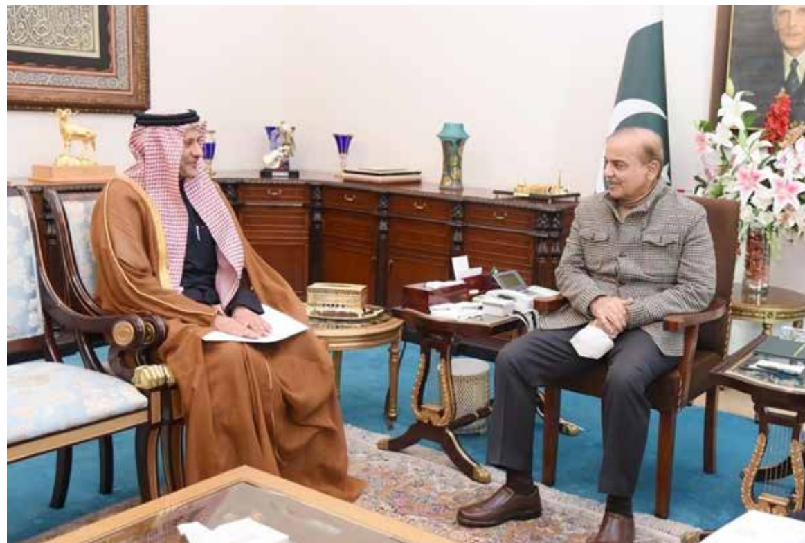
ISLAMABAD: Ambassador of the State of Qatar in Pakistan, H.E. Sheikh Saoud bin Abdulrahman Al-Thani calls on Prime Minister Muhammad Shehbaz Sharif.

ISLAMABAD: The per tola price of 24 karat gold witnessed an increase of Rs 7,000 on Friday and was traded all-time high at Rs202,500 against its sale at Rs195,500, the last trading day. The price of 10 grams of 24 karat gold also increased by Rs 6,000 to Rs173,610 against Rs167,610, whereas that of 10 grams of 22 karat increased to Rs159,144 from Rs153,642, All Sindh Sarafa Jewellers Association reported. The price of one tola silver increased by Rs50 to Rs2200 whereas that of ten gram silver went up by Rs42.86 to Rs 1886.14. The price of gold in the international market decreased by US$6 to US$1,930 as compared to its sale at US$1,936 on the last trading day, the association reported. - APP