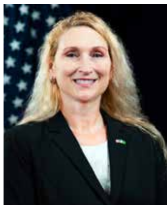
your participation in the upcoming games as the United States strongly