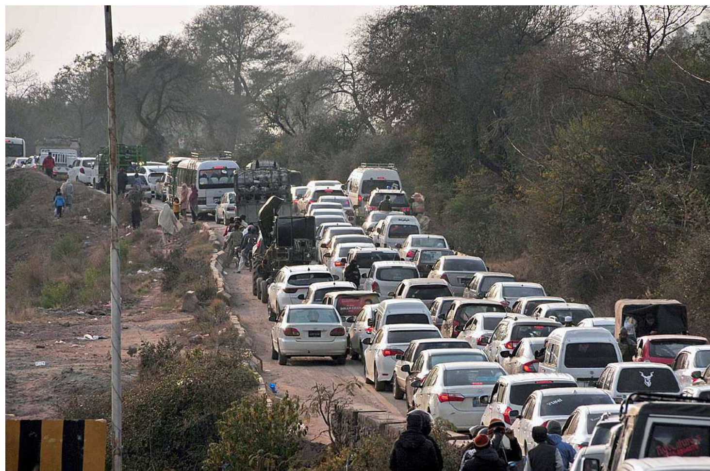
ISLAMABAD: A view of massive traffic jam near Bhara kahu Bypass at Federal Capital.

BOGOTA: Demonstrators continued Saturday to demand the resignation of Peruvian President Dina Boluarte after six weeks of violent protests that have killed 60 people. Boluarte accused protesters of "vandalism" in a television address late Thursday after hundreds took to the streets in the nation's capital of Lima in the so-called "Takeover of Lima" demonstration. The president said the protesters had "no social agenda" but sought to "break the rule of law, generate chaos and disorder and seize power." With the death of another person in Puno, the toll has risen since Dec. 11. Numerous individuals were hurt on both sides when security officers used tear gas in response to demonstrators throwing stones at them, according to reports. Police raided the National University of San Marcos in Lima with a tank and detained 200 students.