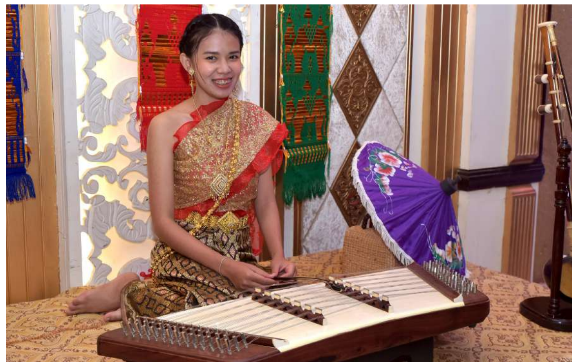
ISLAMABAD: A Thai artist performs during a function in Islamabad.

ISLAMABAD: Pakistan Telecommunication Authority (PTA) has issued a final notice to unregistered social media companies operating in the country, warning them to register and cooperate in blocking immoral and illegal content, including blasphemy. In a statement, the authority has also recommended action against these companies by other government regulators such as the State Bank of Pakistan (SBP), Securities and Exchange Commission of Pakistan (SECP), Federal Board of Revenue (FBR), and commerce ministry. The PTA has also urged organizations and businesses to check the status of social media companies before conducting any business with them, and to end cooperation with those that are not registered. The authority has expressed disappointment over the non-cooperation of these companies on such sensitive issue and has deemed it unacceptable. The PTA has also warned that penalties will be imposed against unregistered companies under social media laws, and that companies that ignore the instructions of the government of Pakistan may face closure.