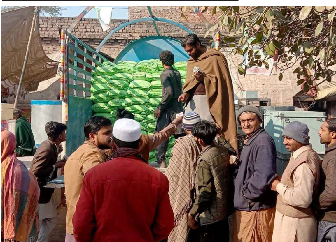
CHINIOT: People purchasing Government subsidize flour at Shahi Mandi.

experts would also visit schools and colleges to provide awareness sessions and health-related training to students and teachers. The participants would be able to register themselves for free till January 31, 2023. The winners would be announced on the social media handlers of Islamabad Capital Territory Administration and Capital Development Authority.