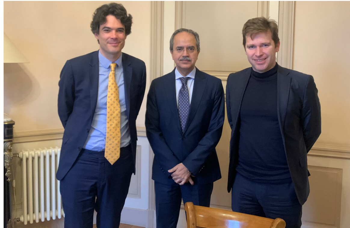
PARIS: Pakistan ambassador to France Asim Iftikhar Ahmad meets Diplomatic Advisors for French Ministry of Energy Transition and Ministry of Ecological Transition. Both sides exchanged views on immense potential for collaboration on renewable energy, climate change and sustainable development. —DNA

Previously, authorities in Burkina Faso also demanded "a new interlocutor" to replace the French ambassador. —APP