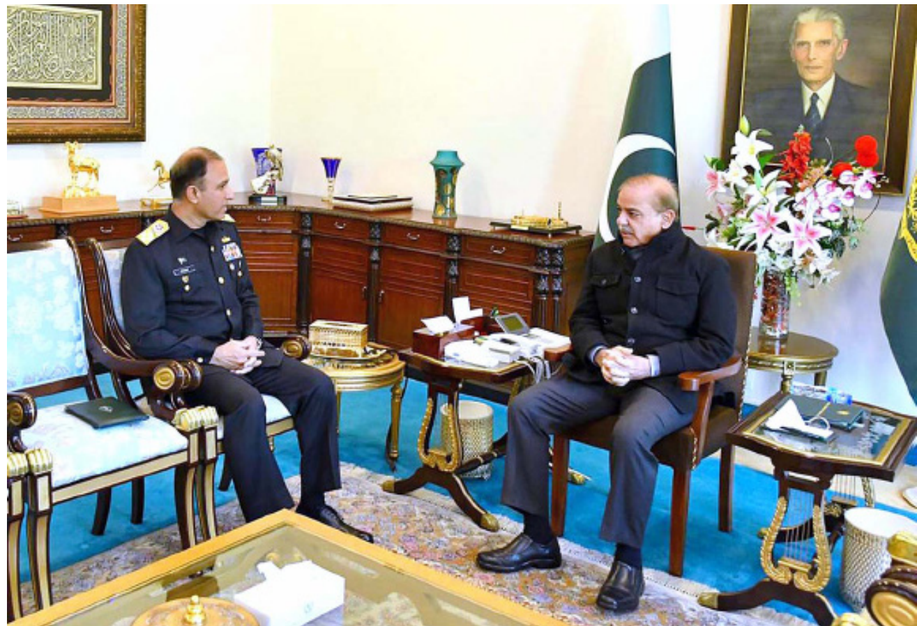
ISLAMABAD: Chief of the Naval Staff, Admiral Muhammad Amjad Niazi calls on PM Shehbaz Sharif.

on the 18th Trade Fair of the OIC member states scheduled to be held from 16-18th June, 2023 in Lahore with the theme of women entrepreneurship. He also invited Kazakh Government to establish a "Special Pavilion" at the OIC's Trade Fair.