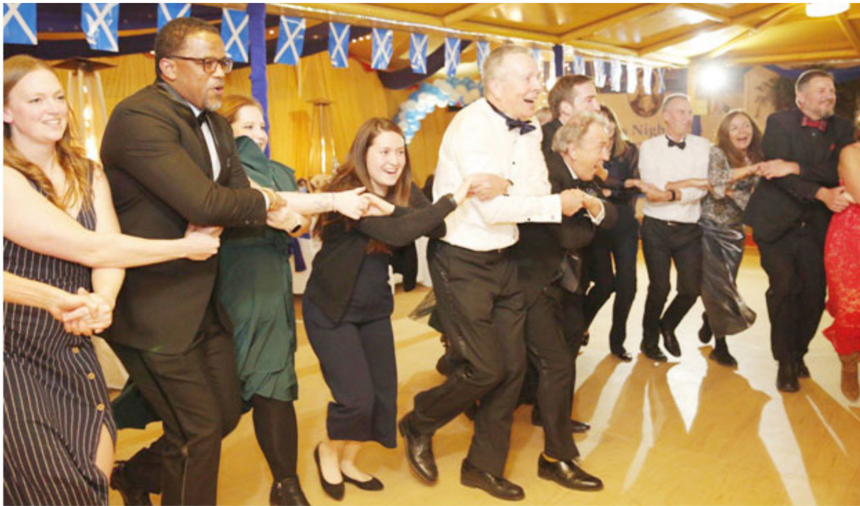
ISLAMABAD: The British High Commission celebrated Burns Night in memory of poet Robert Burns. There was haggis, a piper, poetry (including in Urdu) and Scottish ceilidh dancing.