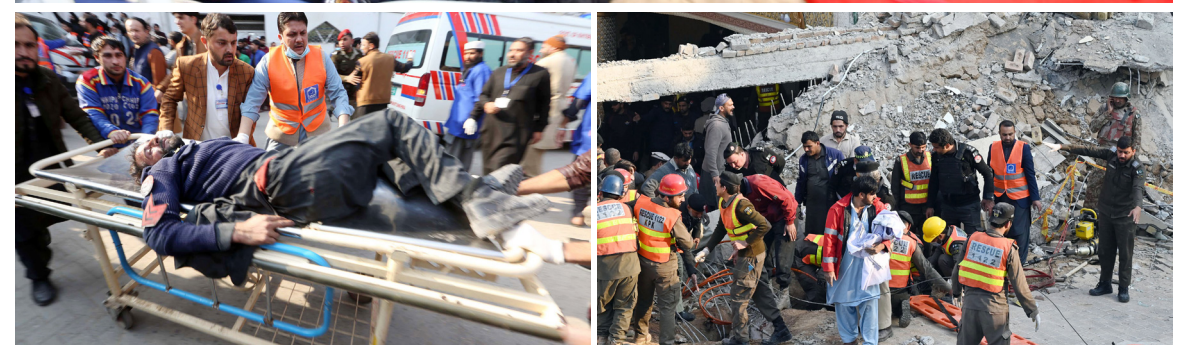
PESHAWAR: Prime Minister Muhammad Shehbaz Shari along with COAS Gen. Asim Munir, inquires after the injured of Peshawar Police Lines terrorist attack at Lady Reading Hospital. In other pictures injured being rushed to the hospital for treatment.