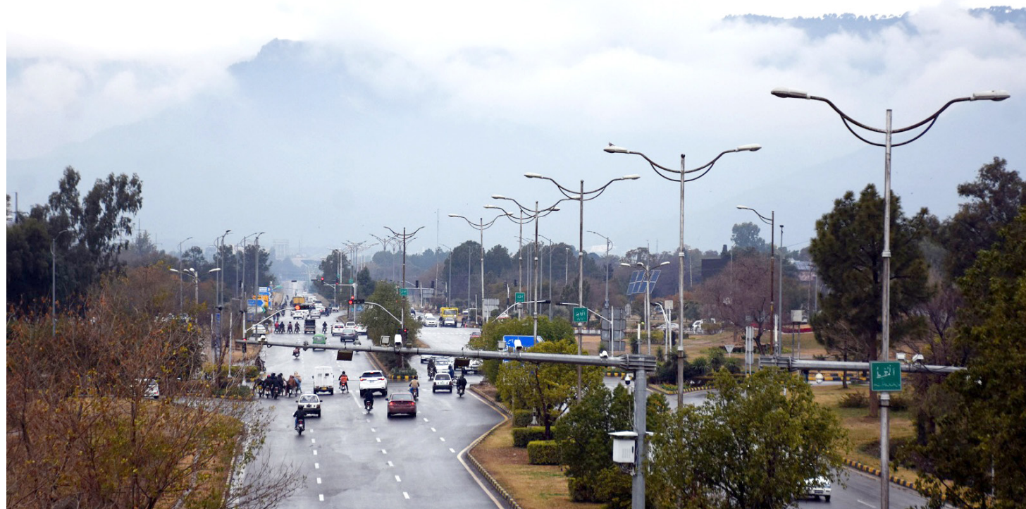
ISLAMABAD: A beautiful view of clouds hovering over Margalla Hills during rain in the federal capital.