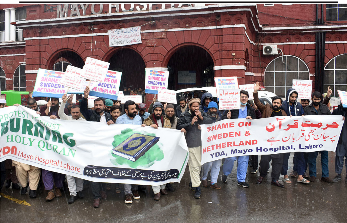
LAHORE: Activists of Young Doctors Association hold a protest against burning of the holy Quran in Sweden in Provincial Capital.

prevailed. Earlier in the day, the Islamabad police also put the security of the federal capital on high alert. The Islamabad Capital Territory police tightened security at the entry and exit points of the federal capital. The police officials instructed the citizens of Islamabad to keep important documents with them including computerized national identity cards (CNICs) besides appealing to the residents to cooperate with the on-duty cops during the checking process. Security is also being monitored through safe city cameras in the federal capital.