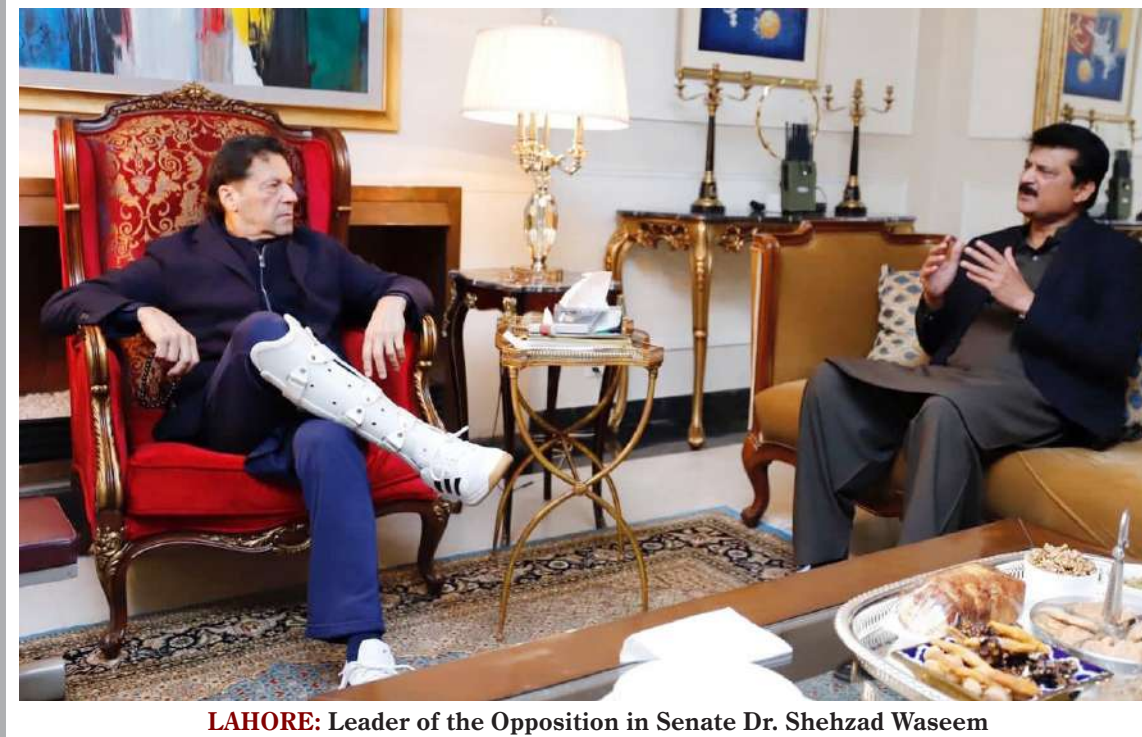
LAHORE: Leader of the Opposition in Senate Dr. Shehzad Waseem calls on PTI Chairman Imran Khan.

ISLAMABAD: Foreign Minister Bilawal Bhutto Zardari on Thursday met Foreign Minister of Belgium Hadja Lahbib and discussed bilateral, regional and global issues of mutual interest. Bilawal appreciated the support extended by the government of Belgium for the flood-affected people of Pakistan. Both sides expressed the resolve to further strengthen economic, trade, investment and cultural cooperation. Bilawal Bhutto also met Axel Van Trotsenburg, Managing Director Operations of World Bank and discussed its engagement with Pakistan.