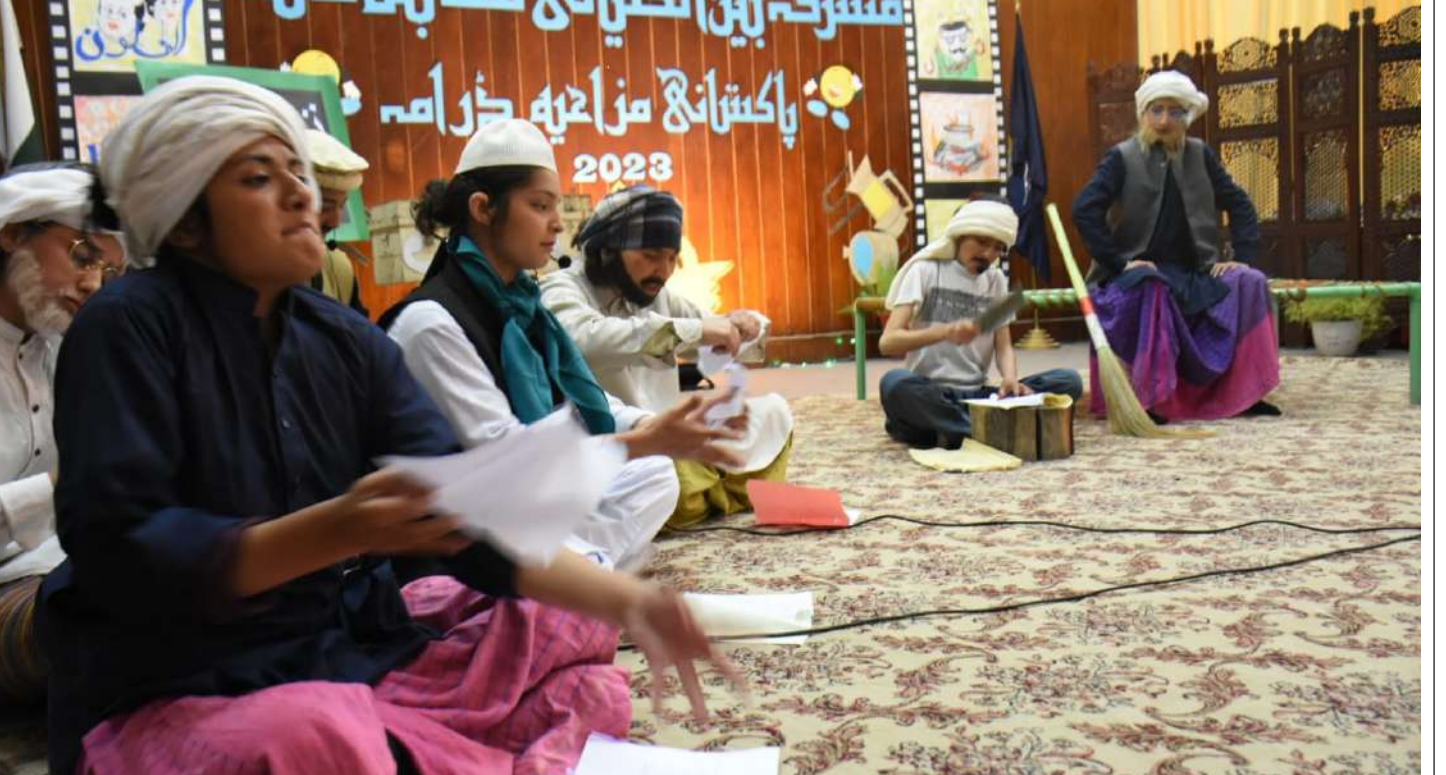
ISLAMABAD : Students of Islamabad model college for girls F6/2 performing in comedy drama competition held in connecneva.-APP tion with intercollegiate ceremony on Thursday.-DNA

"These vulnerable communities need reliable access to essential services such as healthcare, nutrition, education, protection, hygiene, and sanitation, especially those in remote and underserved communities, "UNICEF Representative in Pakistan, Abdullah Fadil said at a press briefing at the Palais des Nations in Ge-