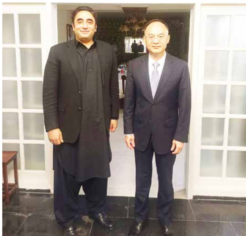
ISLAMABAD: Foreign Minister Bilawal Bhutto Zardari poses for a photo with Ambassador of China, Nong Rong.