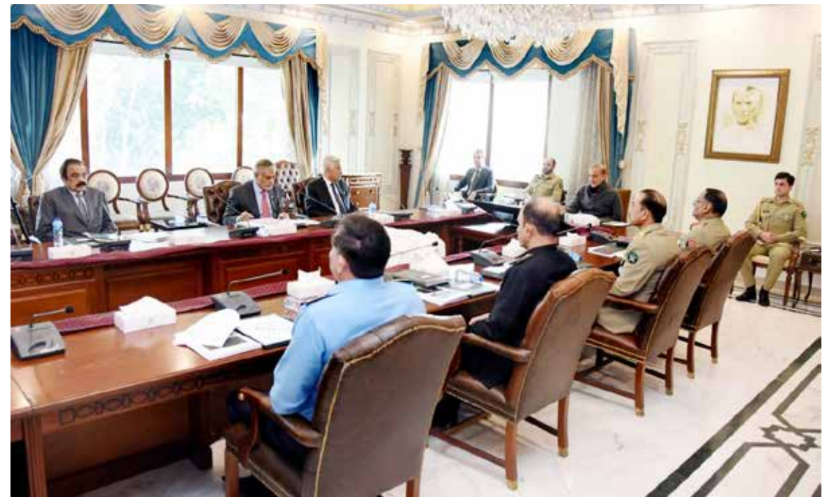
ISLAMABAD: Prime Minister Shehbaz Sharif chairs a meeting of National Security Committee.