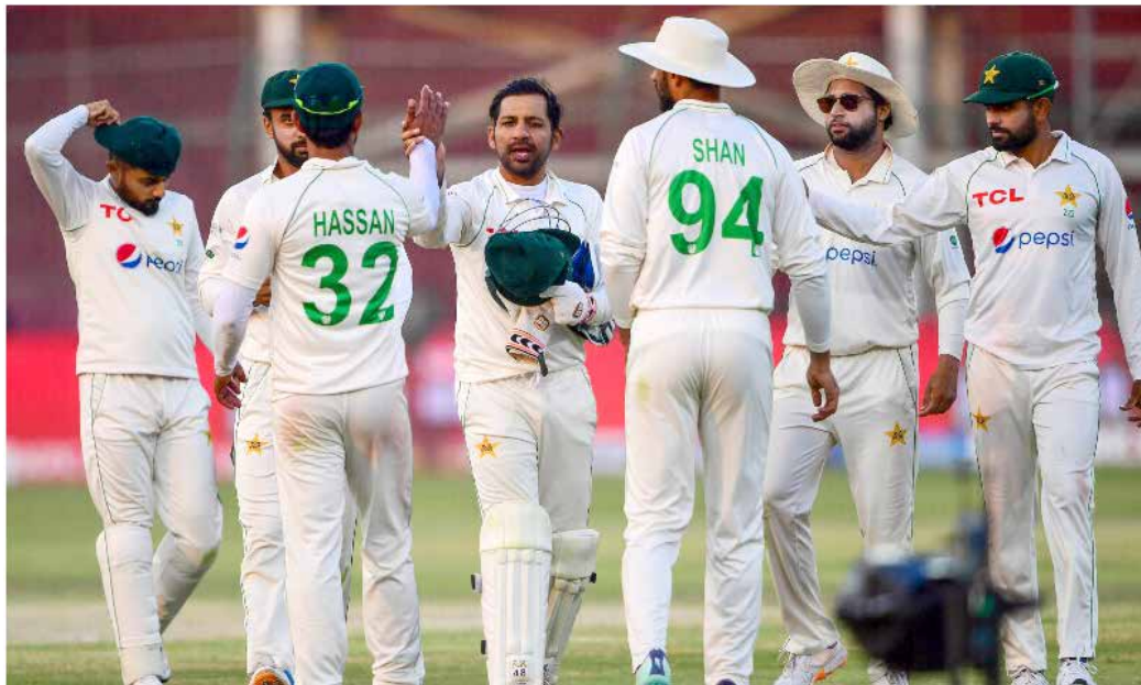
Williamson who made 36, but Pakistan pulled back after the visitors were 226-1 at tea. Salman had Conway caught behind by Sarfaraz Ahmed soon after

KARACHI: Off-spinner Agha Salman and pacer Naseem Shah helped Pakistan derail New Zealand to 309-6 on Monday after opener Devon Conway scored a brilliant hundred on the first day in the second Test in Karachi. Salman grabbed 3-55 and Shah took 2-44 to trigger a New Zealand middle-order slump which saw the tourists lose five wickets for 45 runs during the final session, slumping from 234-1 to 279-6. At the close, Tom Blundell and Ish Sodhi were batting on 30 and 11 respectively as they try to revive New Zealand's innings. Conway, who scored 122, put on 134 for the opening wicket with Tom Latham (71) after New Zealand won the toss on a National Stadium pitch that had traces of grass but did not initially support bowlers. Conway steadied the innings with another 100-run stand for the second wicket with Kane