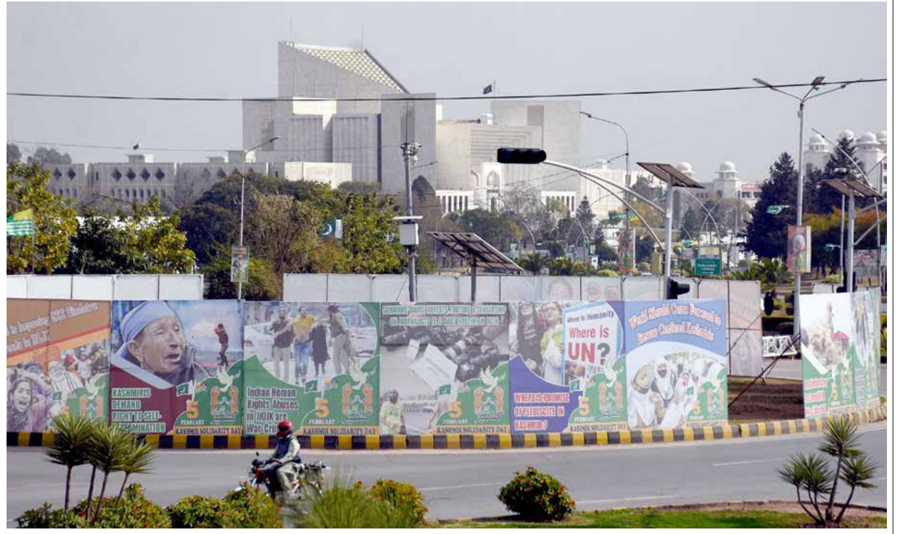
ISLAMABAD: Commuters drive past banners displayed at the D Chowk ahead of the Kashmir Solidarity Day.-Online