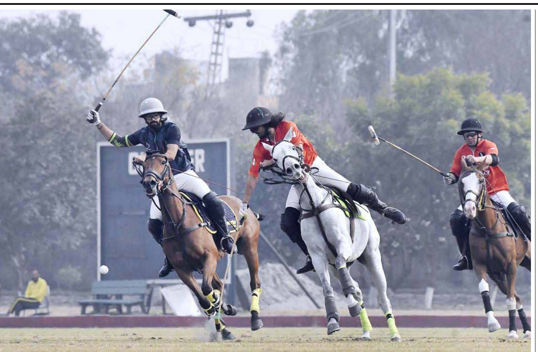
LAHORE: Semifinal Polo Match playing between Remington Pharma and Master Paints Newage cables at Jinnah Polo fields in 3rd Allama Iqbal Polo Cup.

proach against all kinds of tersians to compete in 2024. rorism would be the national motto, while implementation