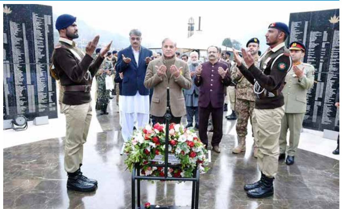
MUZAFFARABAD: Prime Minister Shehbaz Sharif laying floral wreath at Martyrs Monument, on Sunday. AJK PM Sardar Tahir Ilyas is also seen in the picture. - DNA

PTI terms IMF accord a 'death warrant' Political, economic structure of country destroyed - Habib