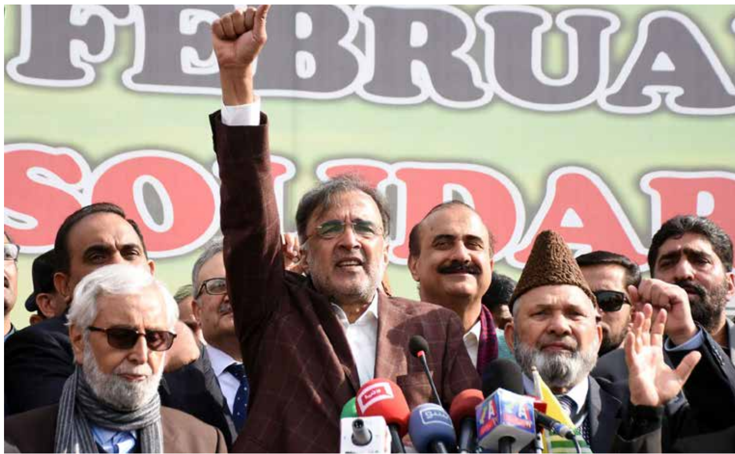
ISLAMABAD: Adviser to the Prime Minister Qamar Zaman Kaira addressing a public rally.

ISLAMABAD: Adviser to Prime Minister on Kashmir Affairs and Gilgit-Baltistan, Qamar Zaman Kaira Sunday said Pakistani nation was observing the Kashmir Solidarity Day on Sunday (February 5) across the world to give a strapping message of supporting the right to self-determination. Addressing a Solidarity walk jointly organized by the Ministry of Foreign Affairs and Kashmir Affairs and Gilgit-Baltistan, he said Kashmir is a jugular vein and an integral part of Pakistan, adding the whole nation is ratifying and endorsing the Kashmir cause since generations to generations. He said the country has always supported the Kashmir indigenous movement to get the right to self-determination and also urged the international community to play its pivotal role in resolving the lingering Kashmir issue as per the wishes of the Kashmiri people. The adviser said the sole objective of celebrating Kashmir Solidarity Day is to shake the conscience of the international community. He further said the world community should break silence over India's perpetrated atrocities and barbarism against innocent people of Kashmir. Reiterating government's resolve to support Kashmiris, Qamar Zaman Kaira said all walks of life including officials, students, journalists and others in Pakistan are supporting just the demand of Kashmiris for the right to self-determination. He said