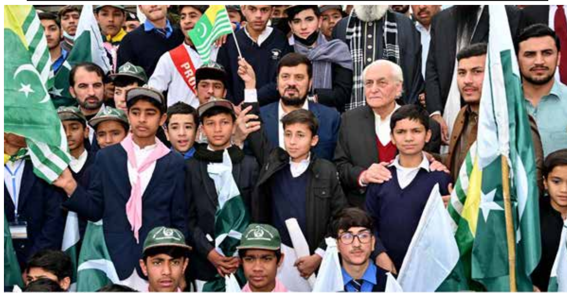
PESHAWAR: Governor Khyber Pakhtunkhwa Haji Ghulam Ali and Caretaker Chief Minister Muhammad Azam Khan in a group photo with students at Kashmir Solidarity Day.

Indian Illegally Occupied Jammu and Kashmir. They further said that Kashmiri people were being killed in fake encounters in the occupied territory on daily basis to spread fear among the people. Even the working journalists were imprisoned in fabricated cases to deprive them of their all legal fundamental rights. The journalists said that the Indian government violated the mutual agreements between Pakistan and India and international laws by abrogating the special status of occupied Kashmir. The New Delhi was bent upon changing the demography of the occupied territory to convert Muslims majority into minority by issuing domiciles to non-Kashmiri settlers.