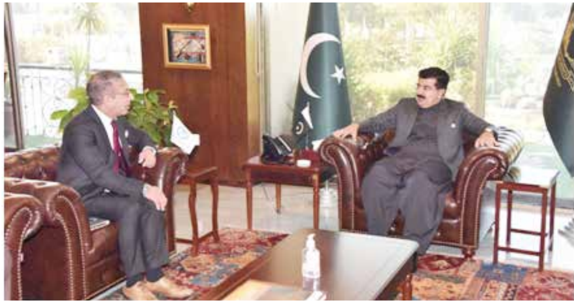
ISLAMABAD: Chairman Senate Sadiq Sanjrani meetin with Duarte Pacheco President of the Inter Parliamentary Union at the Parliament House.

ISLAMABAD: A two-day international conference for parliamentarians on road safety will kick off on February 8, with the theme of "A Safer Future Together - Action for Road Safety." The conference, titled "Road Safety Conference for Parliamentarians: A Global Perspective Pakistan 2023," will be held in a hotel and will focus on capacity building for an effective legislative framework on road safety. Several distinguished guests will attend the conference, including Retired Police Chief Commissioner (UNAMID) Sultan Azam Temuri, Chief of the National Transport Research Center Hameed Akhter, Head of Orthopedics at Shifa International Hospital Dr. Amer Noor, Mental Health Professional Dr. Mona Gauhar, Director General of the Punjab Emergency Service Department Dr. Rizwan Naseer, and former chairperson of the Citizens-Police Liaison Committee Ahmed Chinoy. The conference will cover a range of topics, including Institutional road traffic management, global and local perspectives on road safety, vulnerable road users, psychological trauma caused by road traffic crashes, safe vehicles and safe roads, post-traffic crash first responders, and road safety in metropolitan cities.—APP