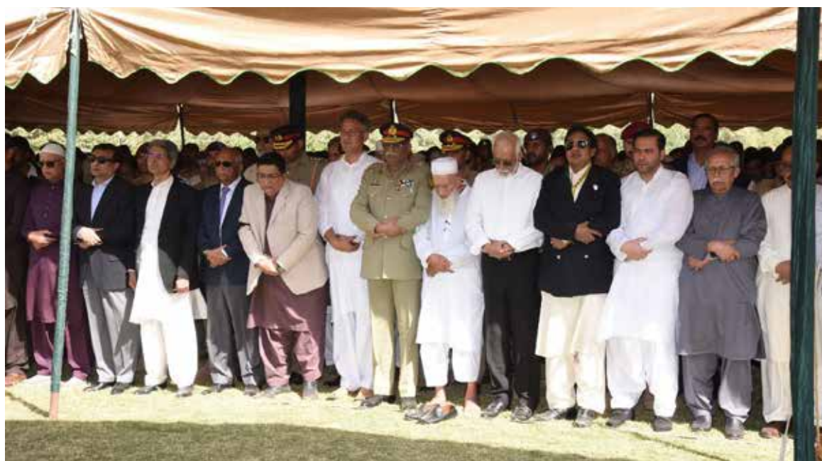
KARACHI: Funeral prayer of former President of Pakistan, General (r) Pervez Musharraf, was offered at Polo Ground Malir Cantt today. General Sahir Shamshad Mirza, CJSC, senior serving / retired Army officers, relatives of deceased and a large number of civil / military officials and public attended the funeral.