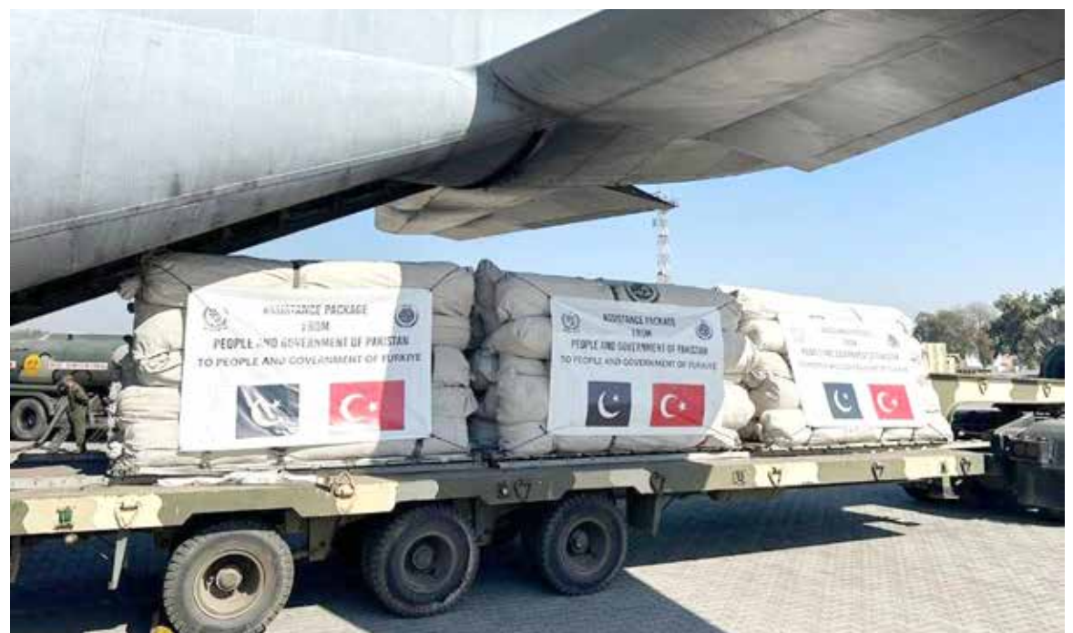
LAHORE: NDMA dispatches another PAF C-130 Aircraft carrying 9 tons load which includes Winterized Tents & Blankets on behalf of People of Pakistan for Quake-hit people of Türkiye.