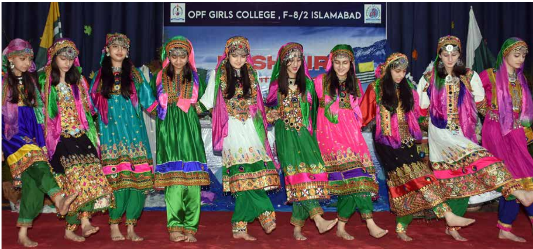
ISLAMABAD: Students performing in tableau during function in connection with Kashmir Solidarity day.