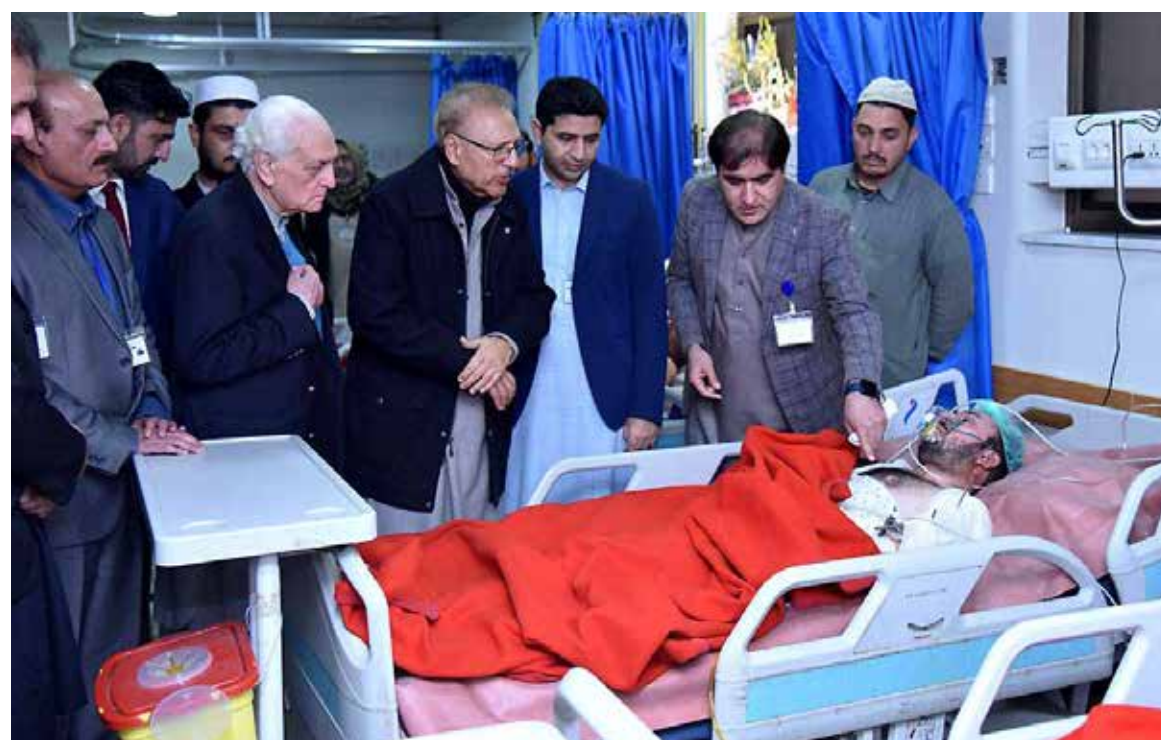
PESHAWAR: President Dr. Arif Alvi inquiring after the health of the patients, injured during the Police Line terrorist attack at Lady Reading Hospital.