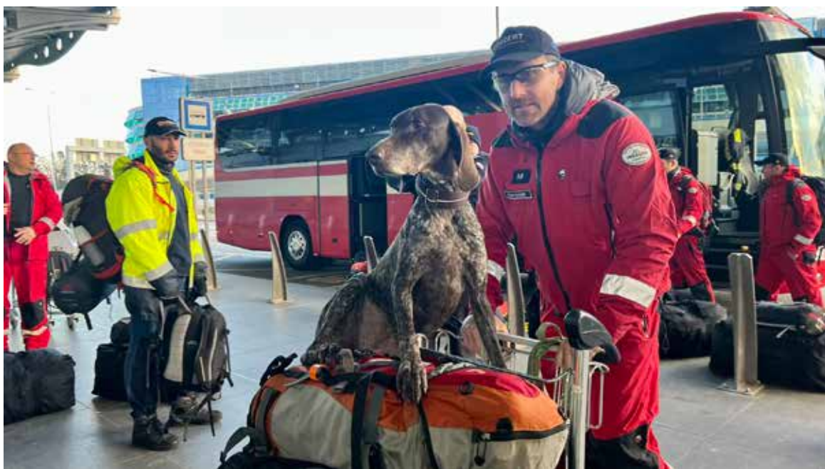
ISTANBUL: EU team arrives in Türkiye to take part in rehabilitation process.

In January, Sunak promised to tackle Britain's most serious problems, from cutting inflation to reducing illegal migration, in a move aimed at convincing his lawmakers he can lead them into the next election.