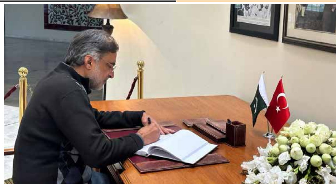
ISLAMABAD: Prime Minister Adviser Qamar Zaman Kairan signs the condolence book at Turkiye embassy to condole deaths of earthquake victims.