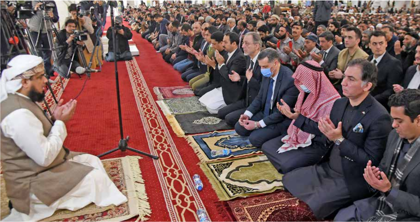
ISLAMABAD: People offer absentia funeral prayer for Turkey and Syria earthquake victims at Faisal Mosque in Federal Capital. The 7.8-magnitude quake struck early February 6 near the Turkish-Syrian border, and by Friday morning the death toll in both countries topped 21,000.