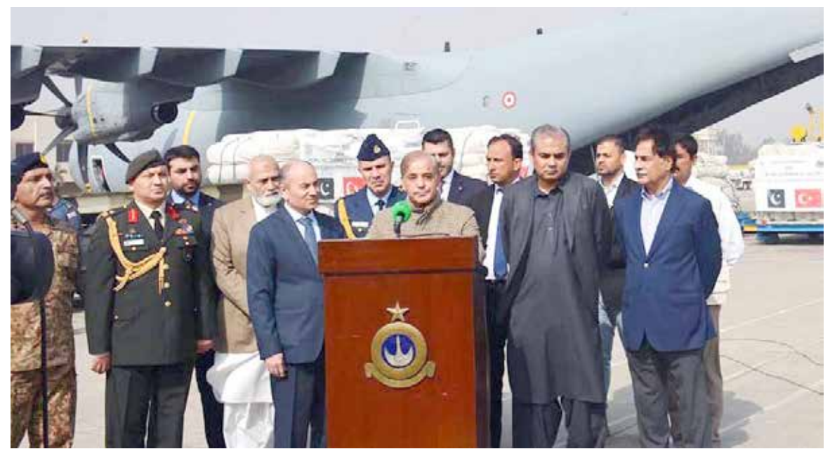
LAHORE: Prime Minister Muhannad Shehbaz Sharif talking to media on the occasion of seeing off a plane carrying relief goods for the earthquake victims of Turkiye; Federal Minister for Economic Affairs Sardar Ayaz Sadiq, Chief Minister of the Punjab Syed Mohsin Naqvi and Turkish Consul General Emir Ozbay are also present at the occasion. – DNA

Gen Bajwa concedes he was behind 'regime change': Imran Khan