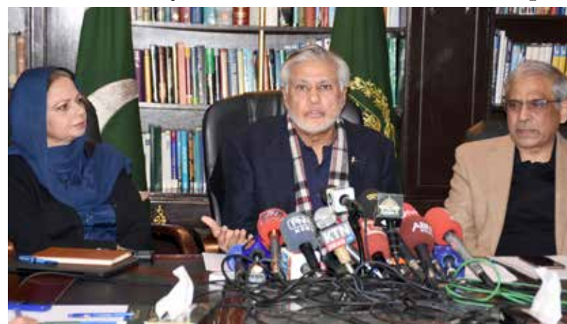
ISLAMABAD: Finance Minister Ishaq Dar addressing a press conference.