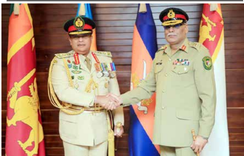
COLOMBO: Pakistan's Chairman Joint Chief of Staff Committee (JCSC) General Sahir Shamshad Mirza arrives in Sri Lanka for an official visit on the invitation of his counterpart General Shavindra Silva.