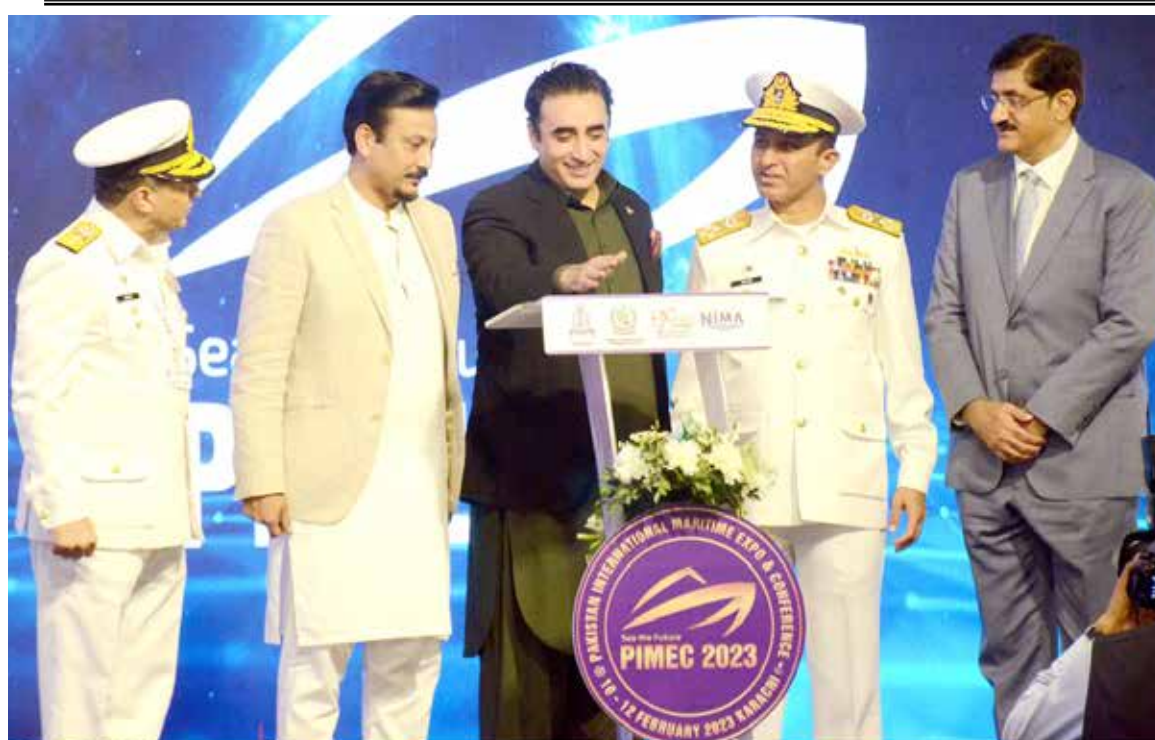
KARACHI: Foreign Minister Bilawal Bhutto Zardari along with Chief of the Naval Staff, Admiral Muhammad Amjad Khan Niazi, Federal Minister for Maritime Affairs Senator Syed Faisal Ali Subzwari, CM Sindh Syed Murad Ali Shah, inaugurates Pakistan International Maritime Expo & Conference PIMEC -2023at Expo Centre.