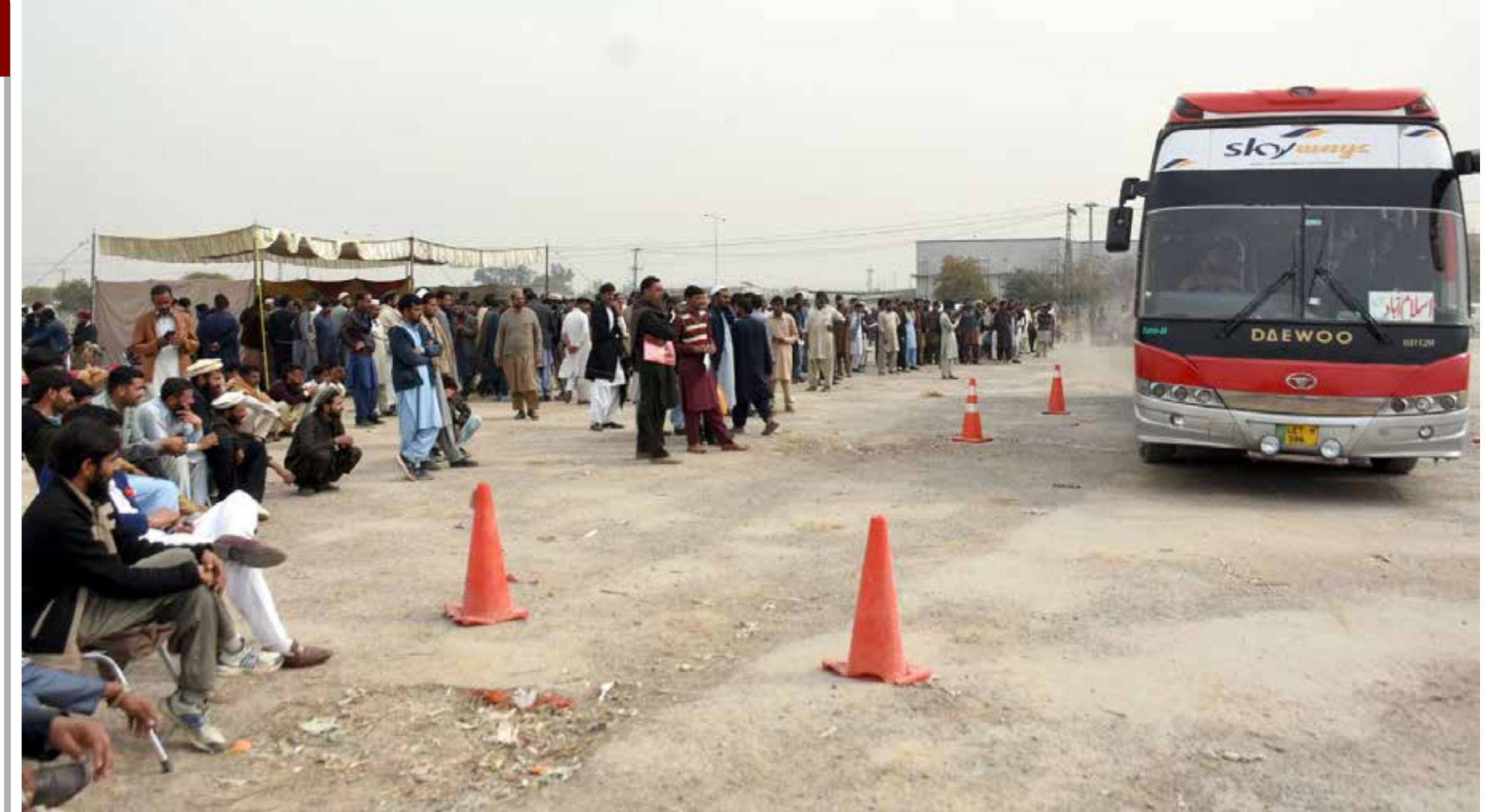
ISLAMABAD: People are stands in a queue for driving test to applying for drivers job in Saudi Arbia, at sector I-10 in Federal Capital.