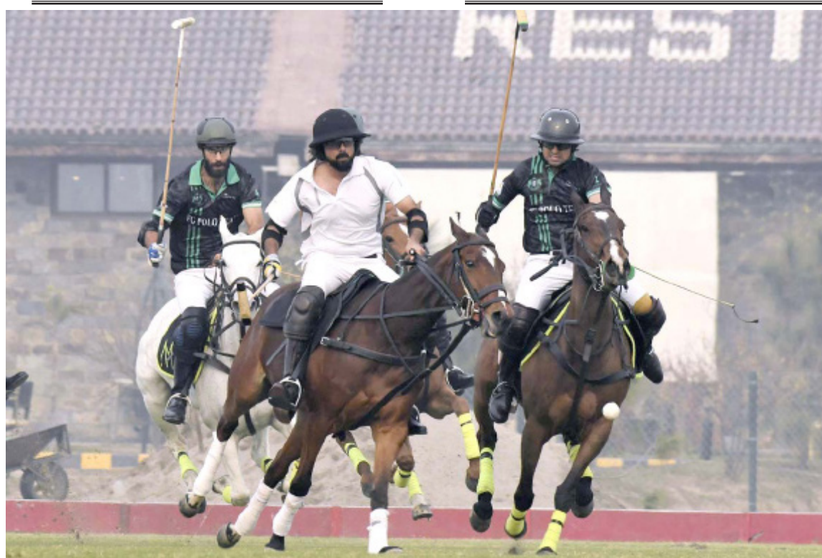
LAHORE: View of Polo match between BN Polo and FG Polo team during AR Developers 3rd Jinnah Gold Cup 2023 at Jinnah Polo Fields.

had been removed from the ODI captaincy without any communication from the governing body. "There was no need to bring up this topic... but he [Mr Kohli] did so intentionally," Mr Sharma can be heard saying in the video. He also alleged that some players take injections to speed up their recovery after injuries and that they play even when not match-fit. Mr Sharma has made no public comment since the footage emerged.