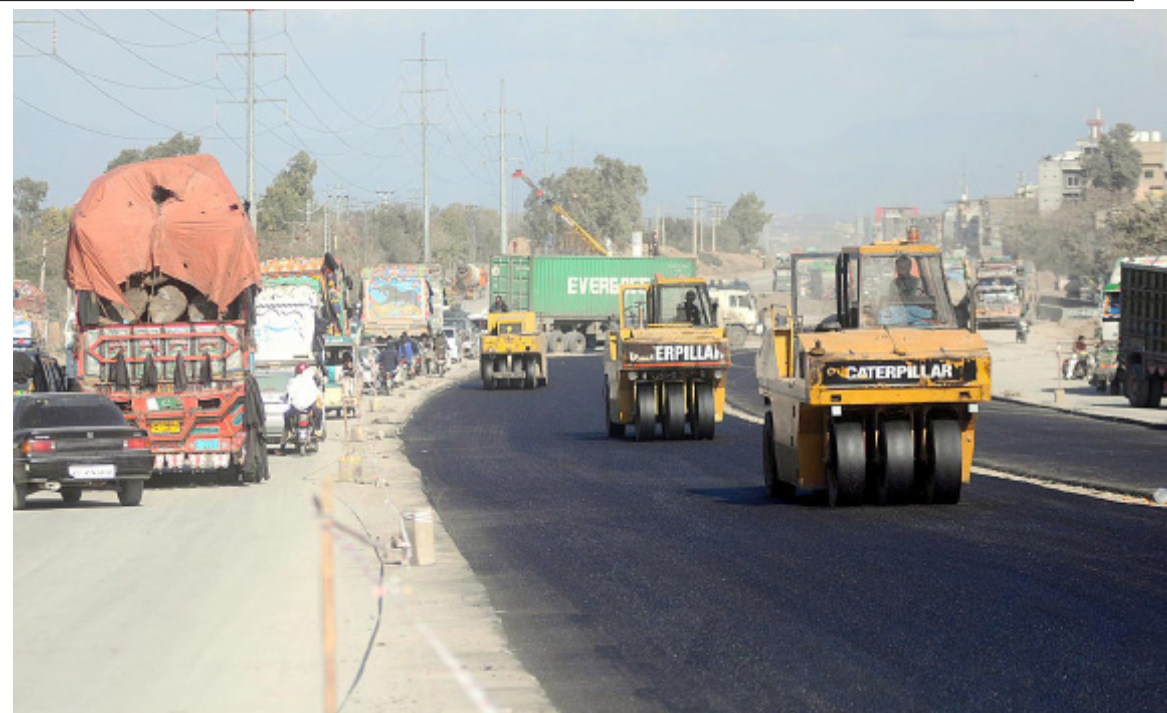
ISLAMABAD: Labourers busy in construction work of IJP Road during development work in the city.