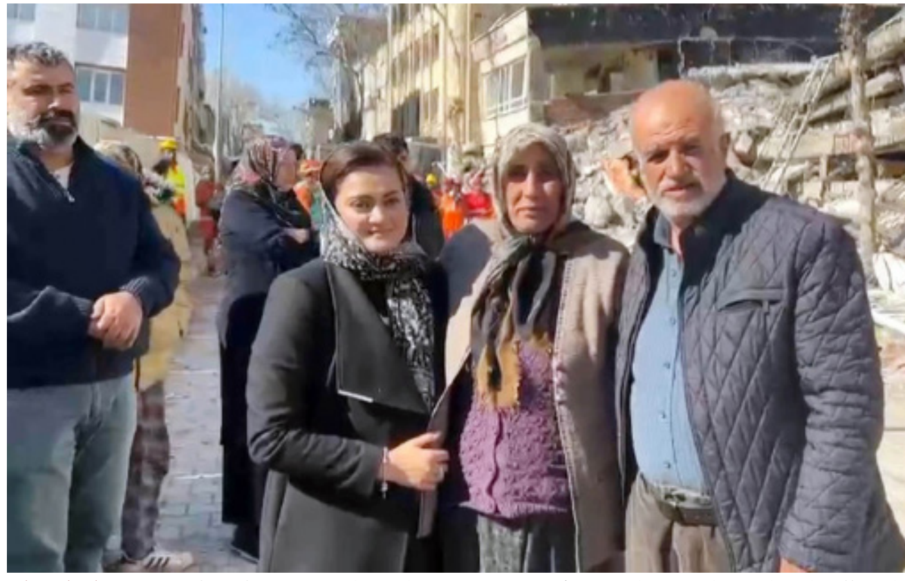
ADIYAMAN: Minister for Information and Broadcasting Marriyum Aurangzeb meets the earthquake-affected people in Adiyaman, Turkiye.