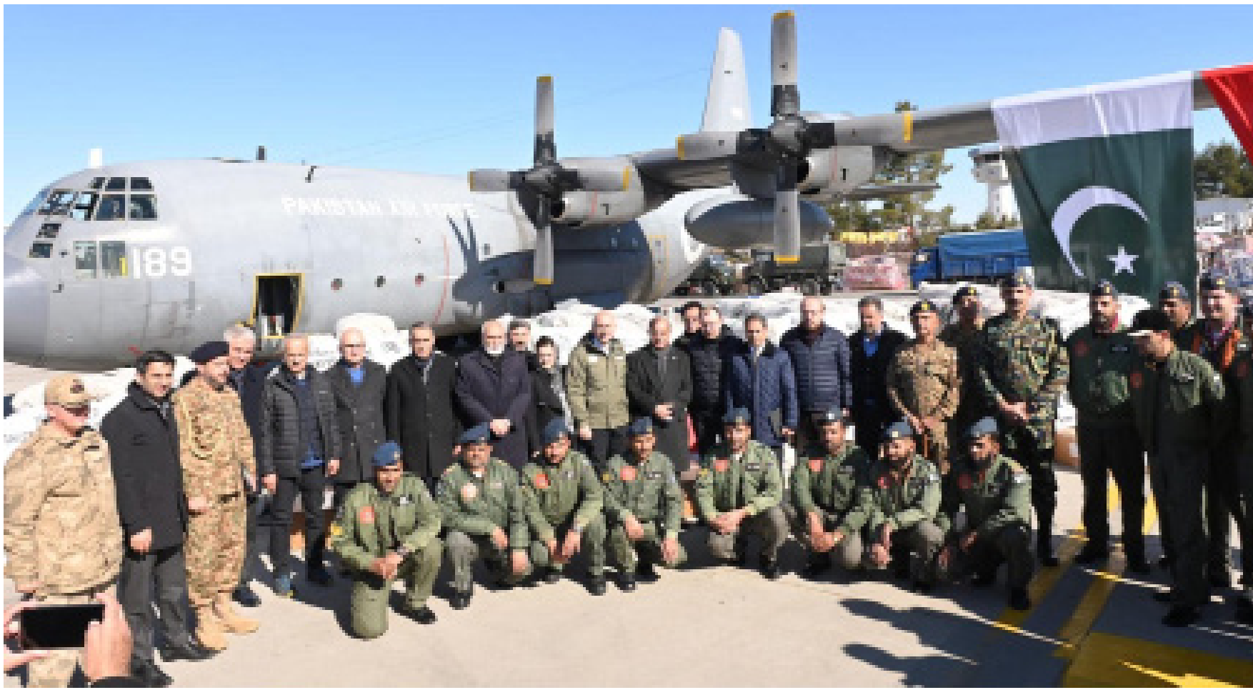
Prime Minister Muhammad Shehbaz Sharif handing over the relief goods to Turkish authorities sent by Pakistan for earthquake victims. Adiaman, Türkiye.

BEIJING: Pakistan's rice export to China in 2022 surpassed USD 455 million with a volume of more than one million tonnes, for the first time between China-Pakistan rice trade, said Ghulam Qadir Commercial Counsellor at Pakistan's Embassy in Beijing, China. Ghulam Qadir indicated that according to the General Administration of Customs of the People's Republic of China (GACC), last year, bilateral trade in agriculture products increased significantly and China imported more than 1.19 million tons of different types of rice from Pakistan, an increase of 53% year on year. "Our rice exports to China surpassed one million tons for the first time, due to facilitation from both governments and hard work of businessmen. With the opening up of China, these exports are forecast to grow more", he added. He further said that according to statistics from the General Administration of Customs, in 2022, China's imports of Semi or wholly milled rice (Commodity Code: 10063020) from Pakistan touched USD 211.88 million, while two kinds of Broken rice (Commodity Code: 10064020, 10064080) reached USD 162.78 million and USD 80.74 million respectively. "The Chinese Government is supporting Pakistan by establishing offline and online Pavilions and Pakistani rice has hit the e-commerce platform in China and sales are expected to grow further. We are working with GACC to ensure more Pakistani rice enterprises register and increase our exports even further", Qadir mentioned.—APP