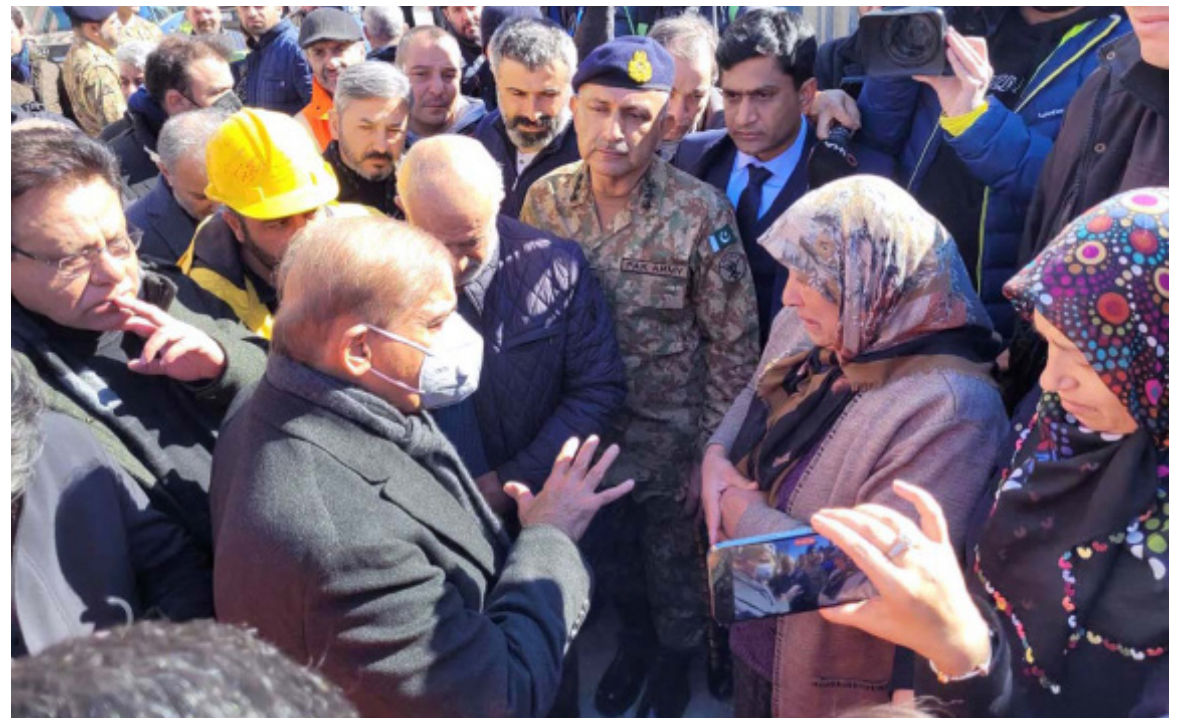
ADIAMAN: Prime Minister Muhammad Shehbaz Sharif meeting Turkish earthquake victims in Adiyaman and offering condolences. - DNA