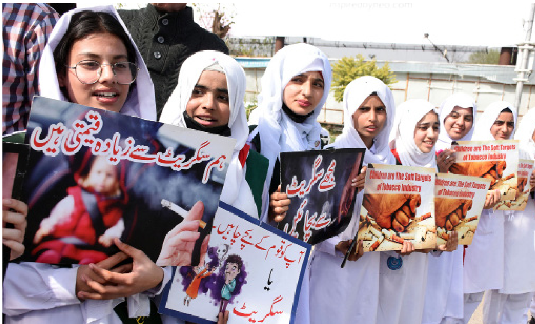
ISLAMABAD: Participants hold a banner during a Anti-Tobacco Walk organized by PANAH outside NPC