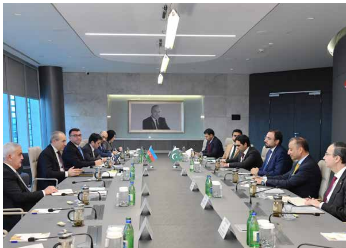
BAKU: Federal Minister of BoI, Chaudhry Salik Hussain, Minister of Industries, Syed Murtaza Mahmud, Minister of State for Petroleum Musadik Malik hold a meeting with Minister of Economy of Azerbaijan Mikayil Jabbarov.—DNA