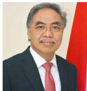
couraged students in Pakistan to make use of scholarships being offered by Indonesian government

charts of economic complexity indicating industries where Pakistan manufactures have strong comparative advantage and export to fill global market, and corresponding market in Indonesia where Indonesia purchase them from many sources. He made reference to Pakistani products such as medical equipment, leathers, garments, and textile that could become important trade commodities not only to Indonesia market but also globally. The envoy emphasized the importance of building people-to-people connections between the nations, and he en-