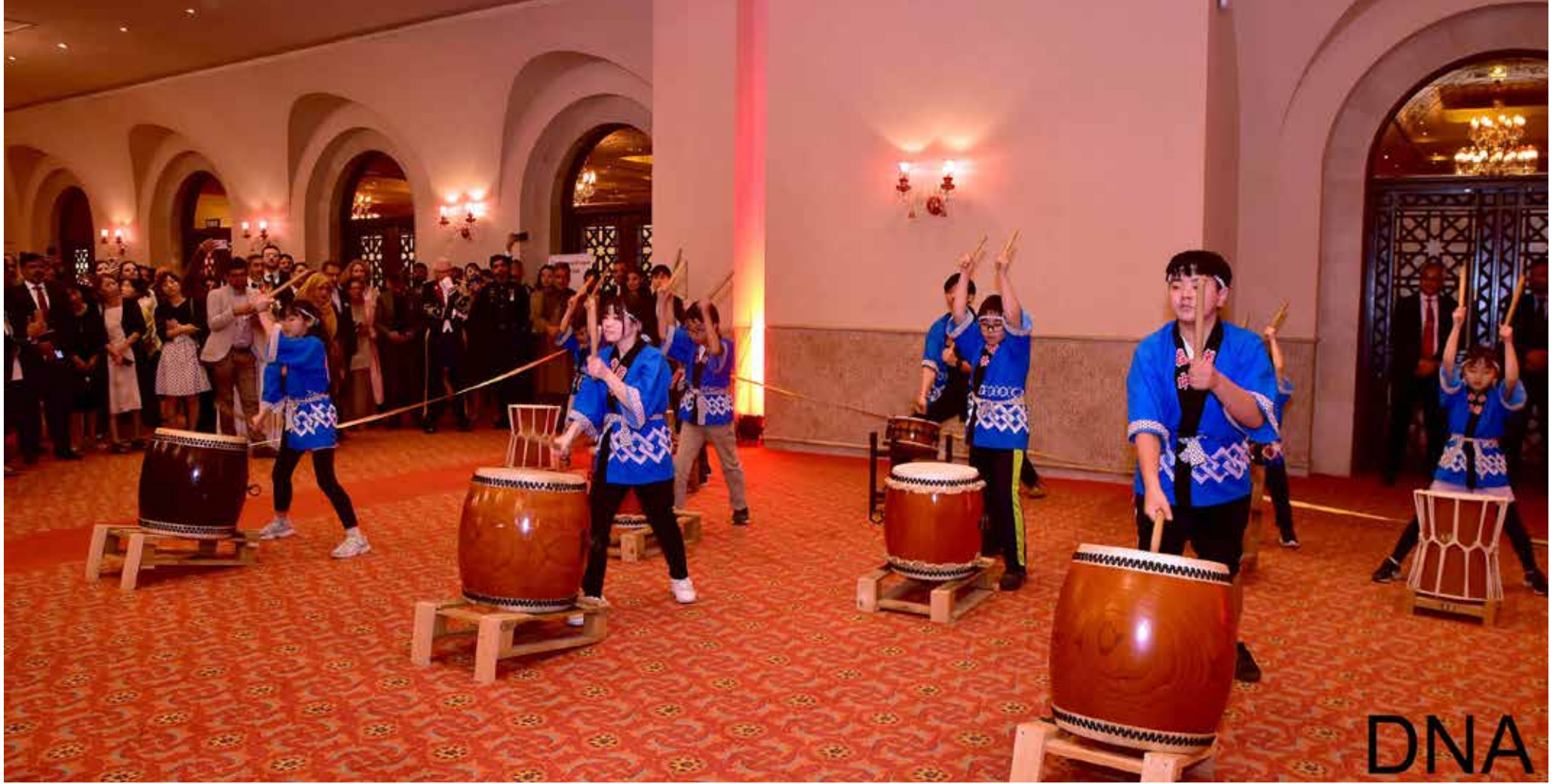
ISLAMABAD: Japanese drummers perform on the occasion of the 63rd Birthday of the Emperor of Japan, at Islamabad Serena Hotel.