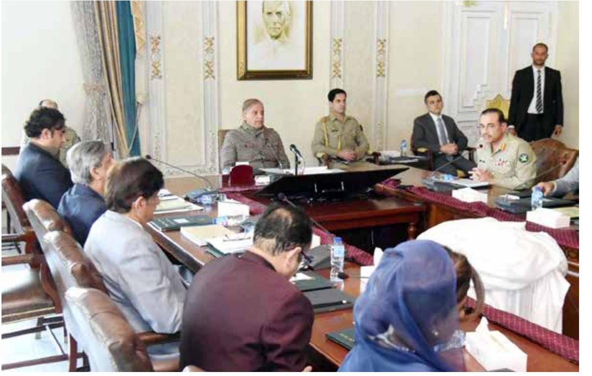
ISLAMABAD: PM Muhammad Shehbaz Sharif chairs meeting of the Central Apex Committee.