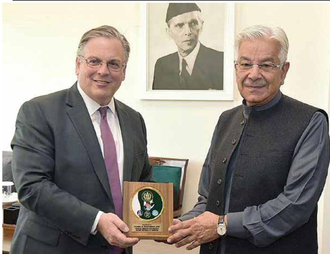
ISLAMABAD: Defence Minister Khawaja Muhammad Asif presenting a shield to H.E Donald Blome US Ambassador to Pakistan in Federal Capital

legislation required to unlock European Union funds. "We need to pay attention to Turkey as in the end, the entire process will stall. Unless there is a solution to Turkey's problem, then the expansion could fail." German Foreign Minister Annalena Baerbock last week