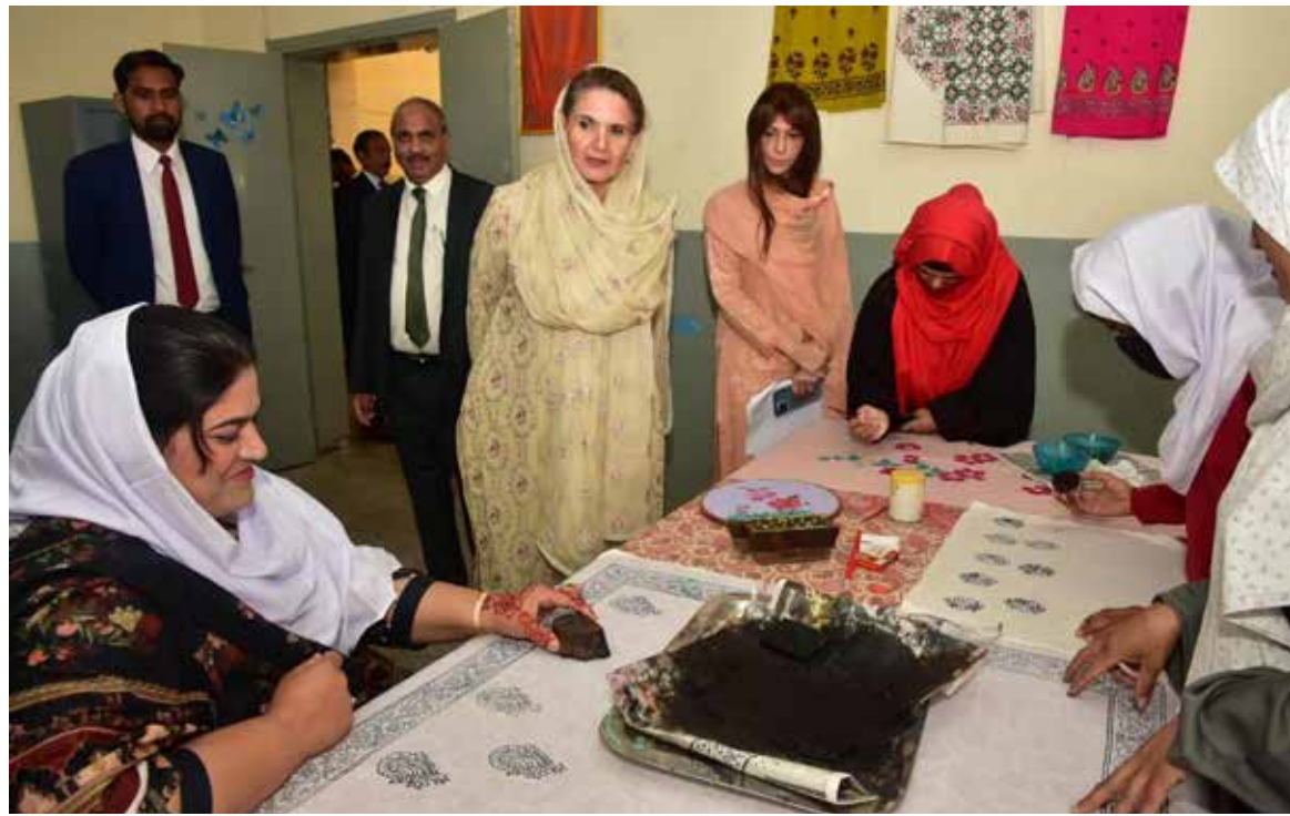
ISLAMABAD: First Lady Begum Samina Arif Alvi being briefed about training facilities for students with disabilities, at the National Training Center for Special Persons.

MOSCOW: Former Russian President Dmitry Medvedev has warned that the continued influx of Western weaponry to Ukraine amid the raging war risks a global nuclear catastrophe. In his remarks published on Monday, Medvedev, a key aide to President Vladimir Putin and deputy chairman of the Security Council of the Russian Federation, urged an immediate halt to the Western supply of heavy weaponry to the embattled government in Kiev. The Russian official reiterated his threat of nuclear war over Ukraine if Western countries continue to arm Ukraine despite repeated warnings from Moscow. "Of course, the pumping in of weapons can continue ... and prevent any possibility of reviving negotiations," Medvedev said in remarks published in the daily Izvestia. "Our enemies are doing just that, not wanting to understand that their goals will certainly lead to a total fiasco. Loss for everyone. A collapse. Apocalypse. Where you forget for centuries about your former life, until the rubble ceases to emit radiation." The latest comments by Medvedev follow Putin's nuclear warning last week and his Sunday remarks casting Moscow's confrontation with the West as an existential battle for the survival of Russia and the Russian people. Since Russia launched its military operation in Russia a year ago, the US and its European allies have provided billions of dollars in military aid to Ukraine, despite repeated warnings from the Kremlin.—APP