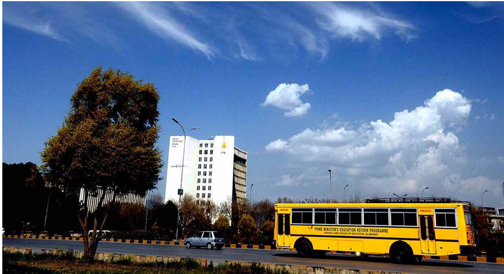
ISLAMABAD: A beautiful view of clouds in a pleasant sunny day at Zero Point.