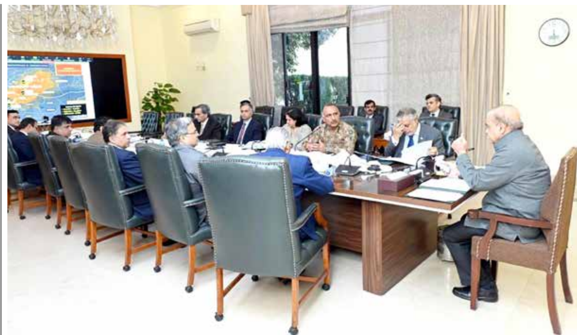
ISLAMABAD: Prime Minister Muhammad Shehbaz Sharif chairs a meeting to review relief activities by Pakistan in earthquake hit areas of Turkiye and Syria.