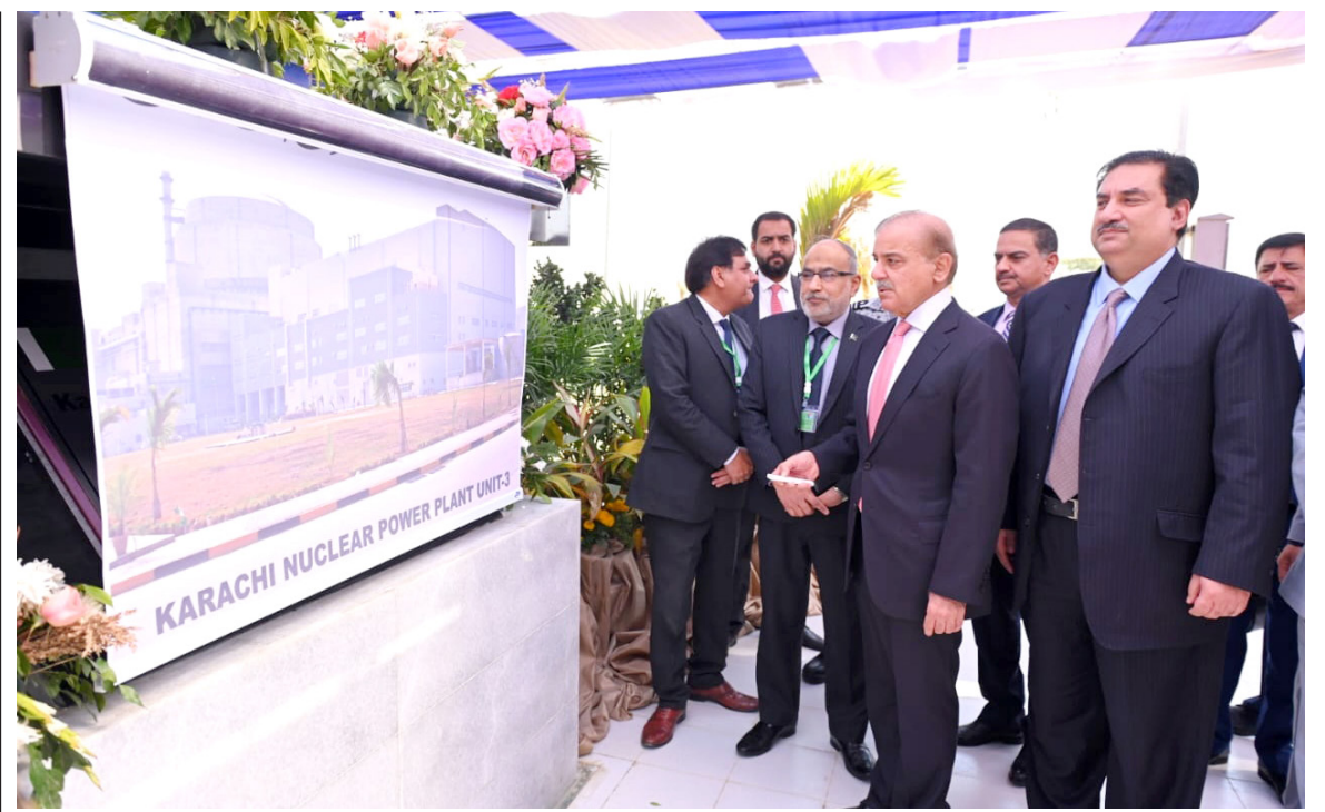
KARACHI: Prime Minister Muhammad Shehbaz Sharif unveiling the plaque of unit 3 of Karachi Nuclear Power Plant (K-3).