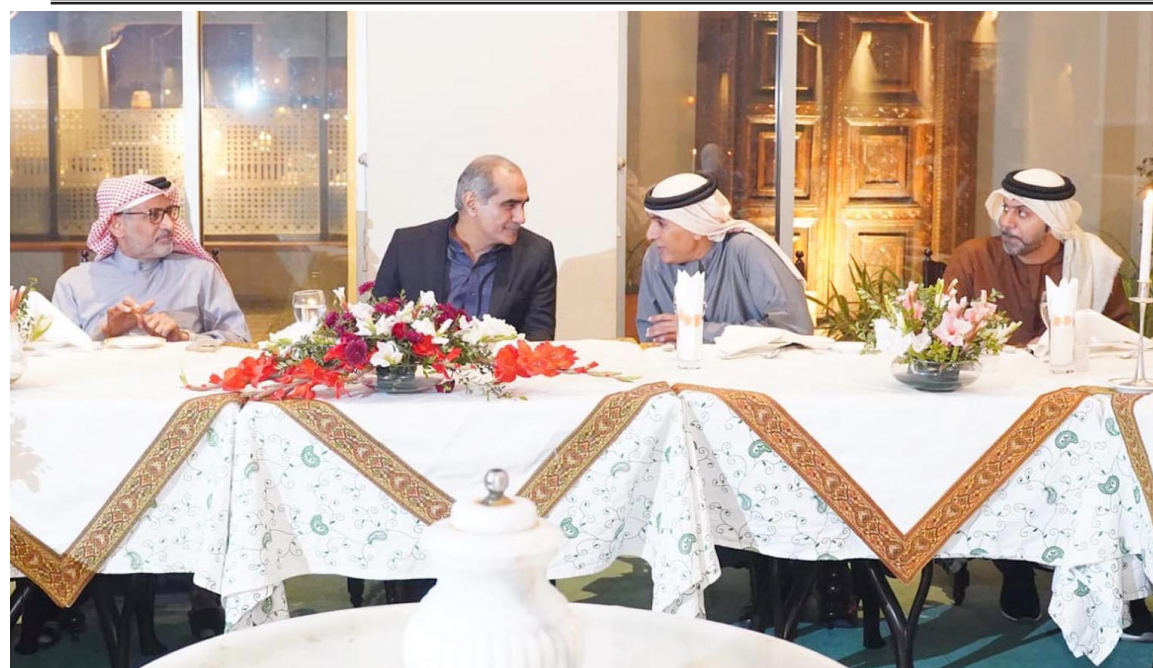
ISLAMABAD: Federal Minister for Aviation hosted dinner in honor of visiting UAE delegation. — DNA

ATHENS: Pharmacists in Greece and Italy have pinpointed two main reasons for the persisting drug shortage in the two countries. The first is the limitation by China and India on the export of raw materials needed for drug production, and the second is the ongoing war in Ukraine. Speaking to Anadolu, Konstantinos Lourandos, the president of the Pharmaceutical Association of Attica, said the main problem behind the medicine shortages in Europe is the shortage of raw materials used by the industry. However, the situation in Greece is different. Greece imports medicines but some big pharmaceutical depots re-export them to the countries where they are priced higher, Lourandos said. Therefore, according to him, Greek authorities should find a way to prevent the re-export of medicines.