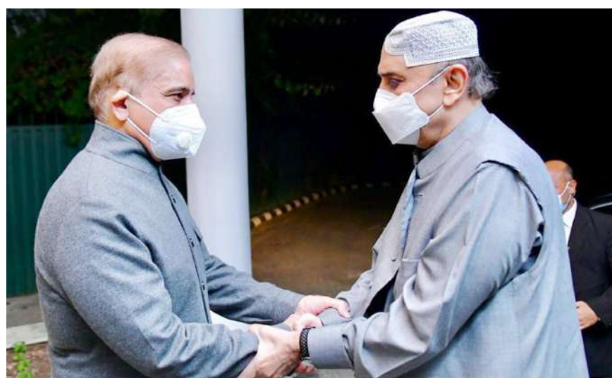
ISLAMABAD: Prime Minister Shehbaz Sharif greets PPP Chairman Asif Ali Zardari.