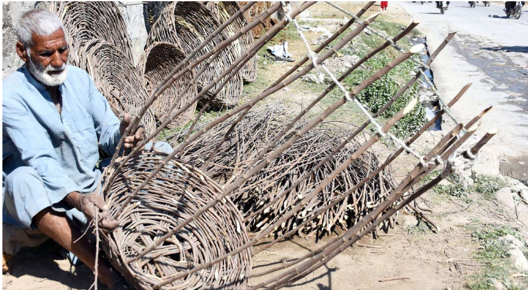
ISLAMABAD: An old man is busy in preparing traditional Basket weaving with Tree branches at his workplace in Golra area in Federal Capital.