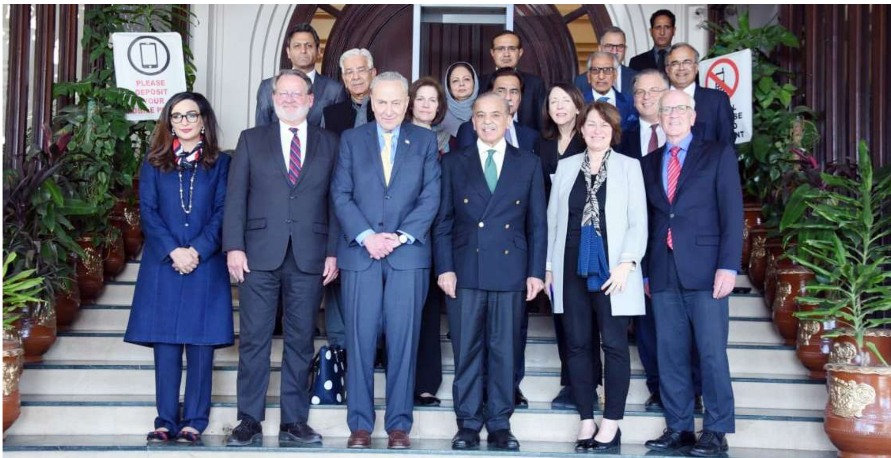
ISLAMABAD: A 9-member United States Senate delegation led by Senator Charles Schumer, Senate Majority Leader, called on Prime Minister Muhammad Shehbaz Sharif. – DNA

ANTAKYA: Turkey has stepped up plans to house victims of the devastating earthquake which struck its border region with Syria, the interior minister said, as the combined death toll in the two countries crept towards 50,000. Suleyman Soylu said 313,000 tents had been erected, with 100,000 container homes to be installed in the disaster zone which stretches for hundreds of kilometres inland from the Turkish and Syrian border. The number of people killed in Turkey has risen to 43,556, Soylu said, while in Syria the death toll was close to 6,000. The United Nations said more than 4,500 were killed in Syria’s rebel-held northwest, and the Syrian government said 1,414 people died in the area under its control. Soylu said more than 600,000 apartments and 150,000 commercial premises had suffered at least moderate damage. – Agencies