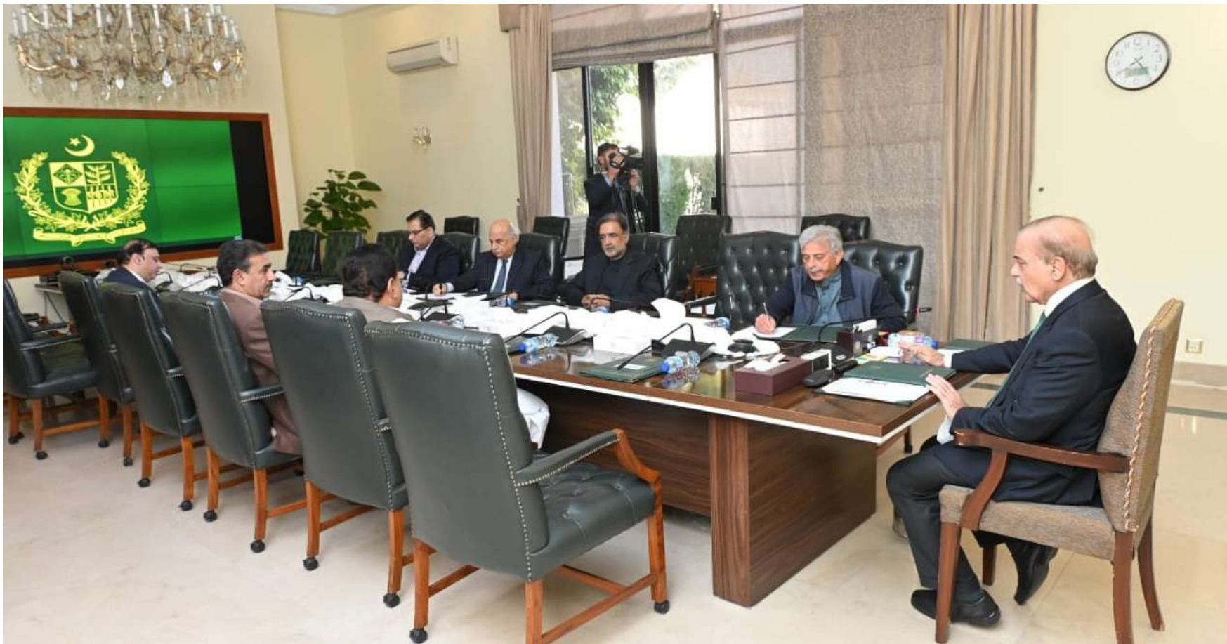
ISLAMABAD: Prime Minister Muhammad Shehbaz Sharif chairs a meeting on austerity measures.