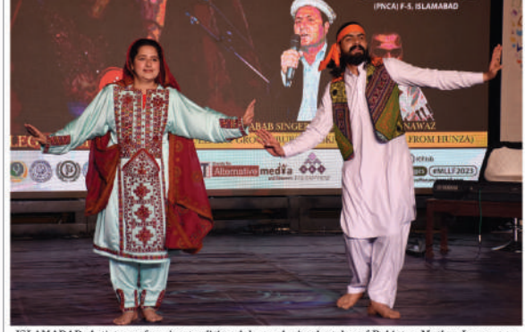
ISLAMABAD: Artists performing traditional dance during last day of Pakistan Mother Languages Literature Festival 2023 at PNCA in Federal Capital.