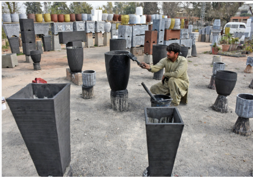
ISLAMABAD: worker is busy in paint of fancy plants pots at his workplace in Federal Capital.