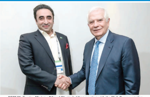
BERLIN: Foreign Minister Bilawal Bhutto holding meeting with the High Representative of the European Union for Foreign Affairs and Security Policy Josep Borrell.