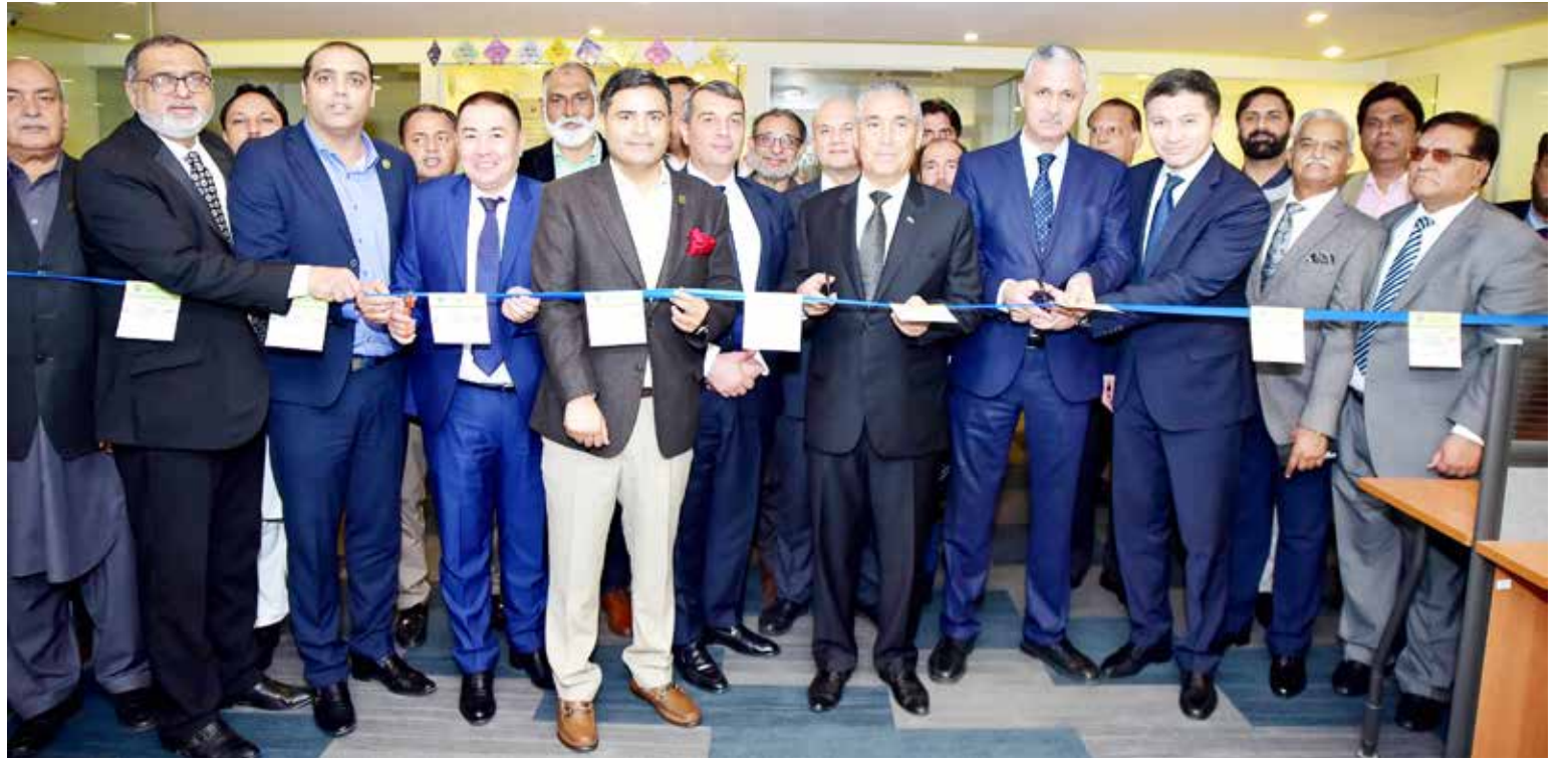
ISLAMABAD: Ambassadors and Heads of Economic Sections of Turkmenistan, Azerbaijan, Tajikistan, Kyrgyzstan, Uzbekistan, Turkiye and others cutting the ribbon during the inauguration ceremony of "CARs and Azerbaijan Facilitation Desk" at Islamabad Chamber of Commerce & Industry.