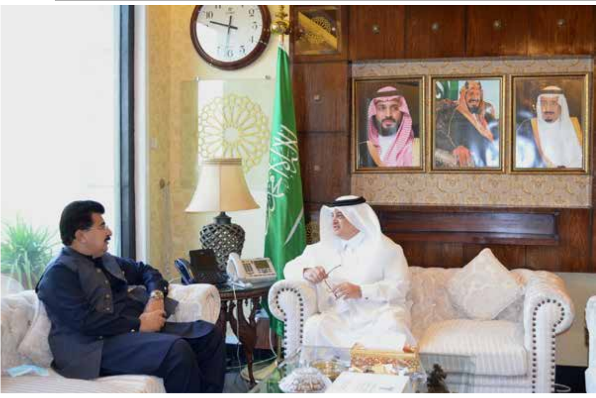
ISLAMABAD: Saudi Ambassador to Pakistan Nawaf bin Saeed Al-Malki meets Chairman Senate, Sadiq Sanjrani.

cause of promotion of commercial activities in the region. He plays an effective role in highlighting of different problems through contacting high ups of different departments besides issuing press statements in this regard. His services for establishment of Azakhel Dry Port and for making it promotional are acknowledged and appreciated by office bearers of different trade bodies.