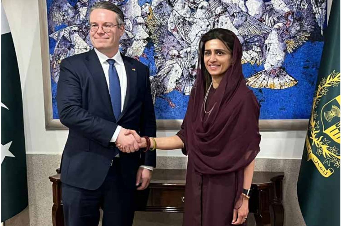
ISLAMABAD: Minister of State for Foreign Affairs Hina Rabbani Khar holds a meeting with her German counterpart Dr Tobias Lindner here on Monday.