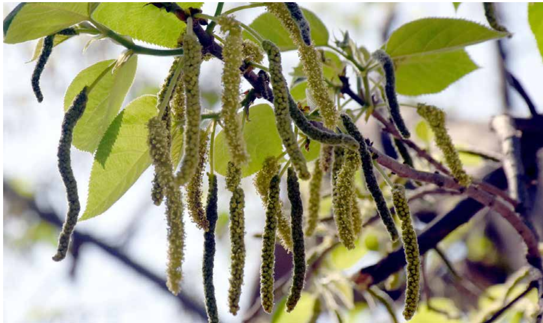
ISLAMABAD: A view of tree which cause allergy, the pollen count in the capital has increased manifold which causes problems for the people sensitive to pollen, in Federal Capital.

Pakistan Tourism Development Cooperation (PTDC) along with other provincial and regional partners will showcase Pakistan's rich tourism potential in the event. According to the PTDC official, ITB (Internationale Tourismus-Börse) Berlin is the world's largest tourism trade fair held every year in Berlin which is expected to be attended by over 10,000 exhibitors and 160,000 visitors. The tourism boards, tourism departments tour operators, travel agents, hotels, system suppliers, airlines and car rentals agencies from more than 180 countries are among the companies that will be present at the event as exhibitors. Participation of Pakistan in this International Tourism Exhibition can help create a soft image of the country internationally and enhance the Business to Business (B2B) and Government to Government (G2G) linkages in the tourism and hospitality sector of Pakistan and Germany. "The event will provide an opportunity to showcase the great potential of Pakistan's tourism industry and create linkages with the leading international players of the tourism industry which will greatly help attract more tourists", the official added.—APP