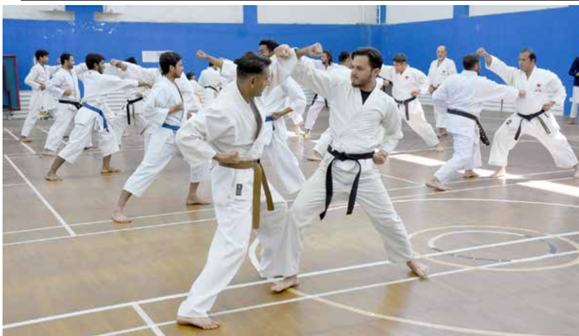
ISLAMABAD: The participants of karate workshop demonstrate their skills at the Pakistan sports complex which was organized by the Embassy of Japan in cooperation with the Japan Karate Association (JKA) in Federal Capital.