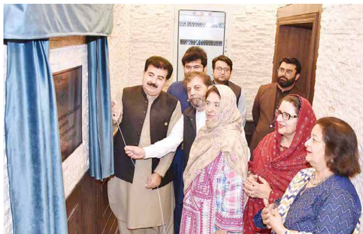
Islamabad: Chairman Senate, Muhammad Sadiq Sanjrani inaugurating the education parliamentarians caucus Pakistan at c-block budding senate of Pakistan.

ISLAMABAD: The agriculture credit disbursement increased by 28.3 percent during the first seven months of the current fiscal year as compared to the corresponding period of last year, the finance ministry said in a recent report. During July-January (2022-23), the agriculture disbursement stood at Rs.949.9 billion against the disbursement of Rs.740.3 billion from July-January (2021-22), showing a growth of 28.3 percent, according to monthly Economic Update and Outlook. The increased disbursement of agriculture credit is expected to further boost wheat production, leading to a target of 28.4 million tonnes, indicating a promising outlook for farmers and the agricultural sector. However, favorable weather conditions, the availability of high-quality seeds, and sufficient fertilizers would be critical in achieving the targeted output. According to the report, so far, the estimates of ongoing Rabi season for wheat sowing in 2022-23 have achieved 96 percent, covering 21.94 million acres. Furthermore, the Kissan Package 2022 is expected to have a positive impact on the agriculture sector's productivity. Meanwhile, during Rabi 2022-23 (December 2022), urea and DAP off-take stood at 833 thousand tonnes, 39.2 percent higher than December 2021, and 158 thousand tonnes, 35.2 percent higher than December 2021 respectively.—APP