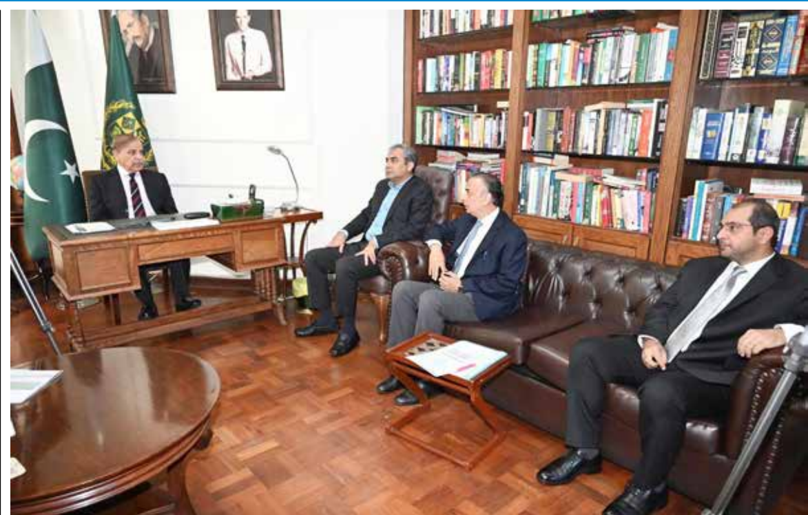
LAHORE: Prime Minister Shehbaz Sharif chairs a meeting on Ramzan Package.