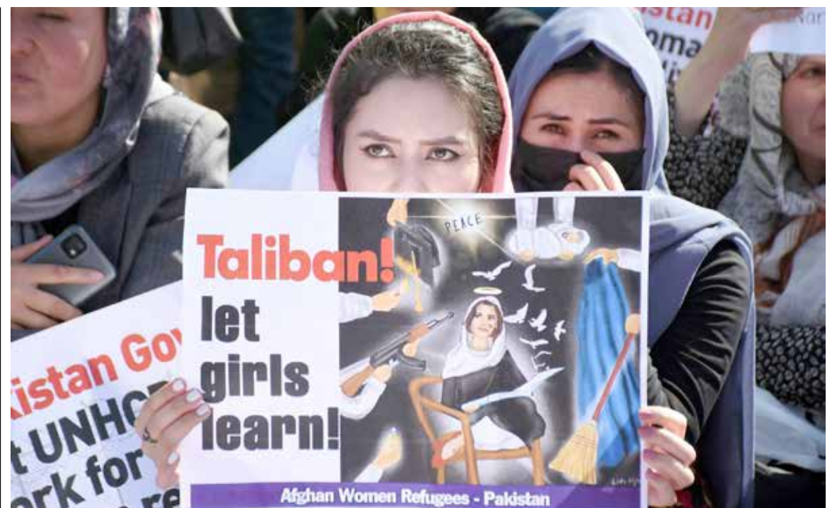
ISLAMABAD: Activists of Women March hold placards on the occasion of International Women Day, in front of the NPC, on Wednesday.

PESHAWAR: The meeting in Peshawar on Wednesday between a delegation of Election Commission of Pakistan and Khyber Pakhtunkhwa governor ended without result as the latter has failed to give any date for elections to the provincial assembly. Sources said that a consultation between the ECP delegation and KP Governor Haji Ghulam Ali failed to produce any result as the latter did not suggest any election date during meeting. The governor will hold another meeting with Chief Election Commissioner Sikandar Sultan Raja next week. The ECP delegation comprised secretary election commission, special secretary and the DG law. The ECP delegation gave briefing to KP Governor Ghulam Ali. Earlier the ECP delegation reached Peshawar on the invitation of KP Governor Ghulam Ali to make consultations on general elections in the province. Governor of Khyber-Pakhtunkhwa (KP) Ghulam Ali on Monday had invited the Election Commission of Pakistan (ECP) for consultation, saying he would give a date for polls after deliberation. A few days ago, the Supreme Court announced its verdict after two-day-long proceedings in the case regarding the delay in the announcement of the date for provincial elections in Punjab and KP.