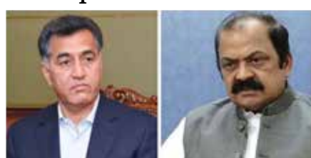
Ex ISI Chief FAIZ HAMEED Interior Minister RANA SANAUULLAH

LAHORE: Pakistan Muslim League Nawaz (PML-N) senior vice president Maryam Nawaz has demanded the court martial of former DG ISI Lieutenant General (Lt Gen) Retired Faiz Hameed. In an exclusive interview with a web channel, Maryam Nawaz alleged that Faiz Hameed had played role in toppling the PML-N government for two years and backing PTI chief Imran Khan's government which brought destruction to the country. She said that Faiz Hameed must see his court martial for his unconstitutional role and exemplary punishment should be given to him. "I knocked on the court's door against Gen Faiz Hameed when he was the head of the ISI. I submitted the entire evidence along with