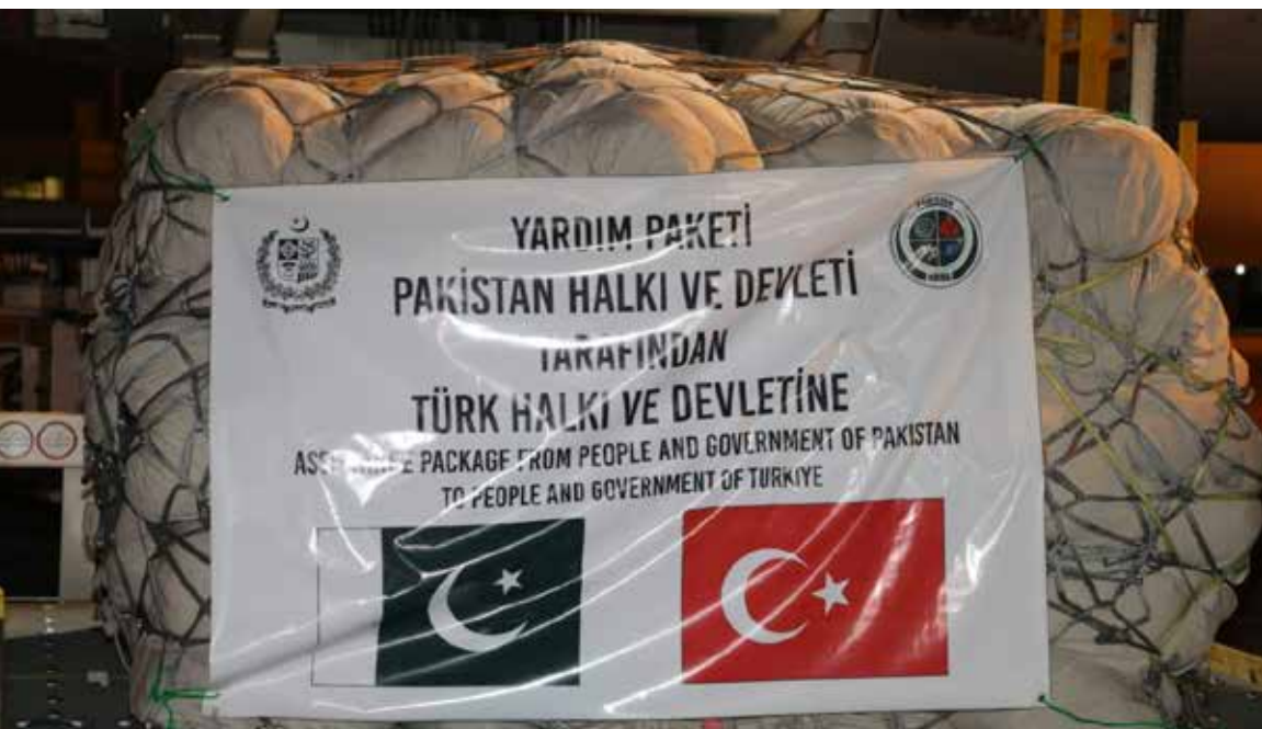
including three Pakistan

ANKARA: The Government of Pakistan has initiated a special flight operation to transport 50,000 tents to Turkiye during the next two weeks. First aircraft of this special flight series, carrying 1200 winterized tents arrived at Adana from Pakistan tonight. In line with the glorious history of supporting each other under all circumstances, the Prime Minister Shehbaz Sharif himself is monitoring the earthquake relief assistance from Pakistan. Under the directions of the Prime Minister, an air bridge was immediately established between Islamabad and Ankara on 6th February 2023 to transport rescue teams and deliver essential relief goods. Since then, earthquake relief supplies are being transported to broth-