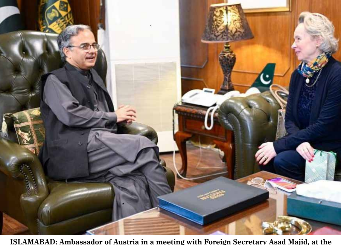
Ministry of Foreign Affairs.—DNA

Admitted in Eye Ward of LRH, he said that most of the SCP patients were being treated by the junior doctors, adding the procedure to avail the treatment under the incentive was too lengthy and demanded simplification.-APP