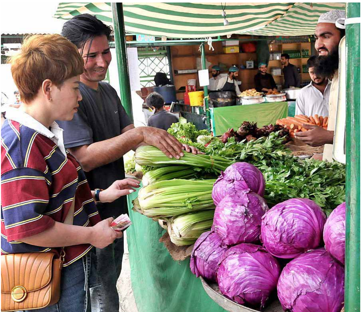
ISLAMABAD: A foreigner couple purchasing vegetables from vendor at Sunday Bazaar in Federal Capital.