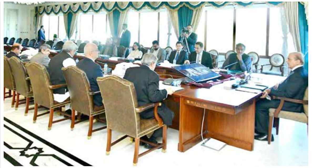
ISLAMABAD: PM Shehbaz Sharif chairs a meeting on pro-poor initiative, on Monday.

ISLAMABAD: Two non-bailable arrest warrants were issued for PTI chairman and former prime minister Imran Khan on Monday after he failed to appear in courts in cases linked to the Toshakhana reference and threatening a woman additional district and sessions judge.