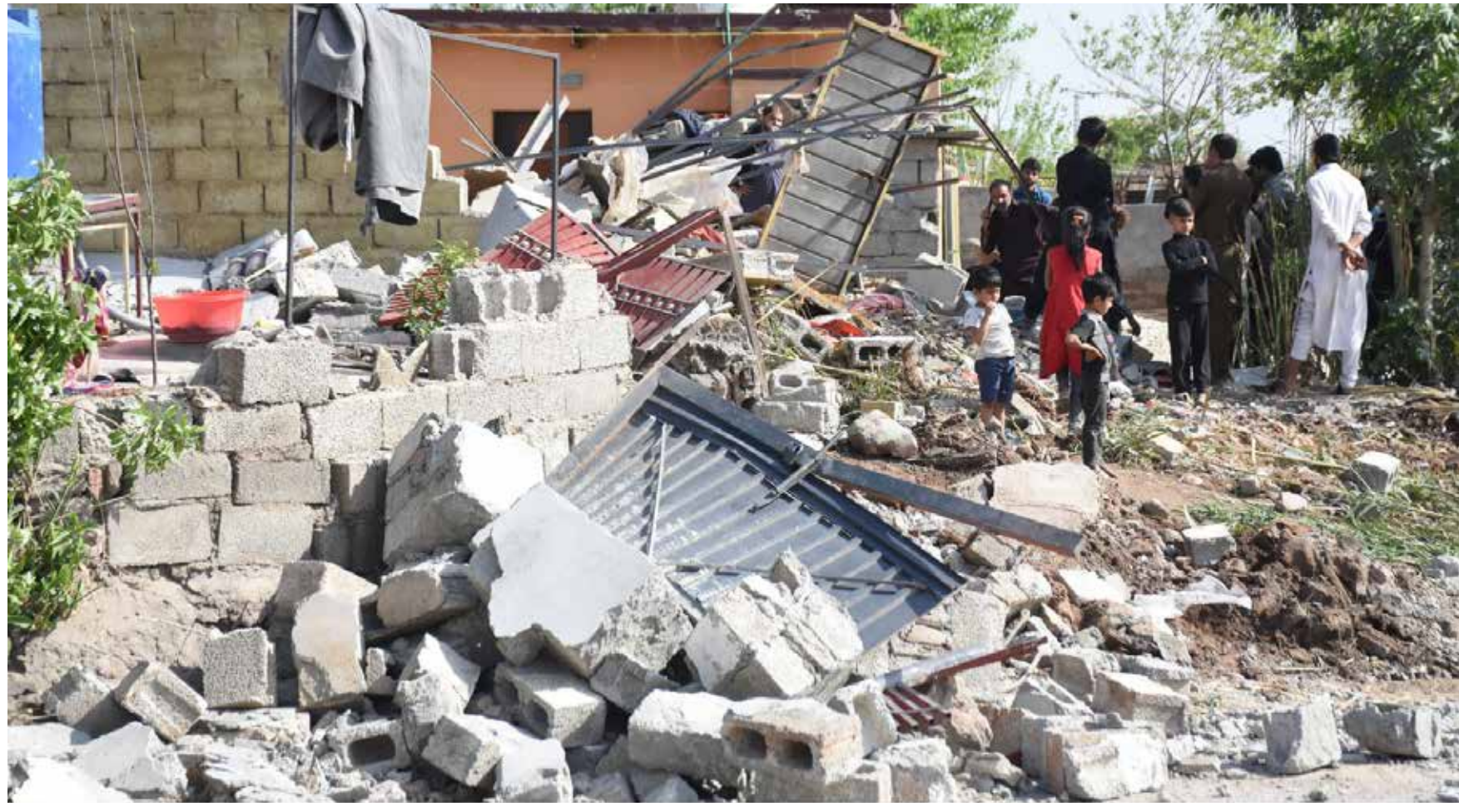
ISLAMABAD-Mar14: Workers of Capital Development Authority (CDA) demolishing illegal constructed houses during anti encouragement operation at Bari Imām area, in Federal capital.

ordinary means is difficult, so you are informed to attend the court personally, through counsel or attorney on 16-03-2023 at 9 am avoid exparte