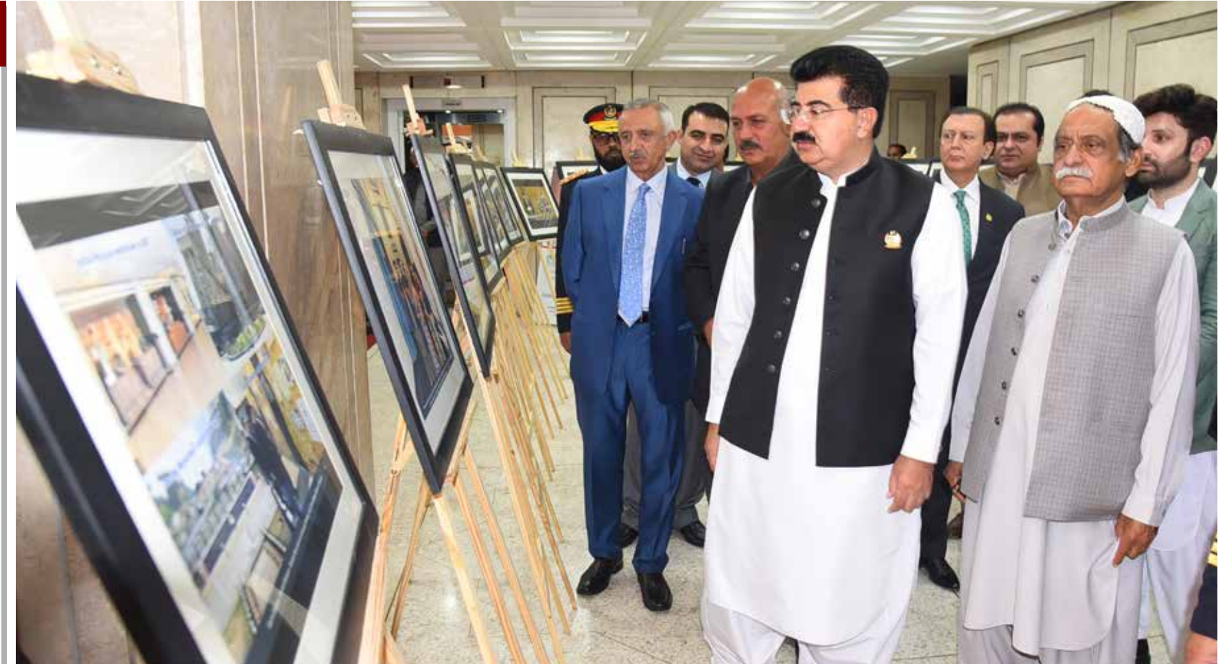
ISLAMABAD: Chairman Senate, Muhammad Sadiq Sanjrani and parliamentarians witnessing the photo exhibition in connection of the golden jubilee celebrations of the Senate of Pakistan at Parliament House.

"Pakistan Railways has around 7,791 kilometres railway network across the country which will not only help the department to improve its financial condition but also attract investors to invest," the official sources in the Ministry told APP. They said the matter also came under discussion during a meeting of the Eco-