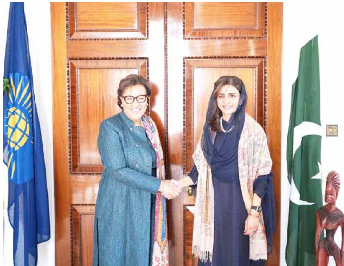
LONDON: On sidelines of Commonwealth Day celebrations MoS Hina Rabbani Khar met Commonwealth Secretary-General Patricia Scotland.