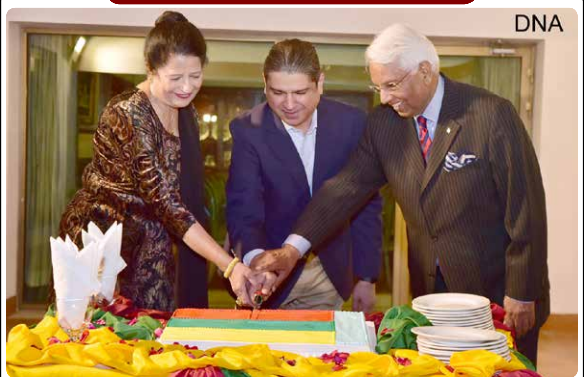
ISLAMABAD: Minister for Inter-Provincial Coordination and Special Initiatives Sardar Ehsaan-ur-Rehman Mazari, Hon. Consul General of Lithuania Masud M Khan and his spouse cutting cake to celebrate National Day of Lithuania. — DNA

Govt to act per ECP's decision on polls: PM