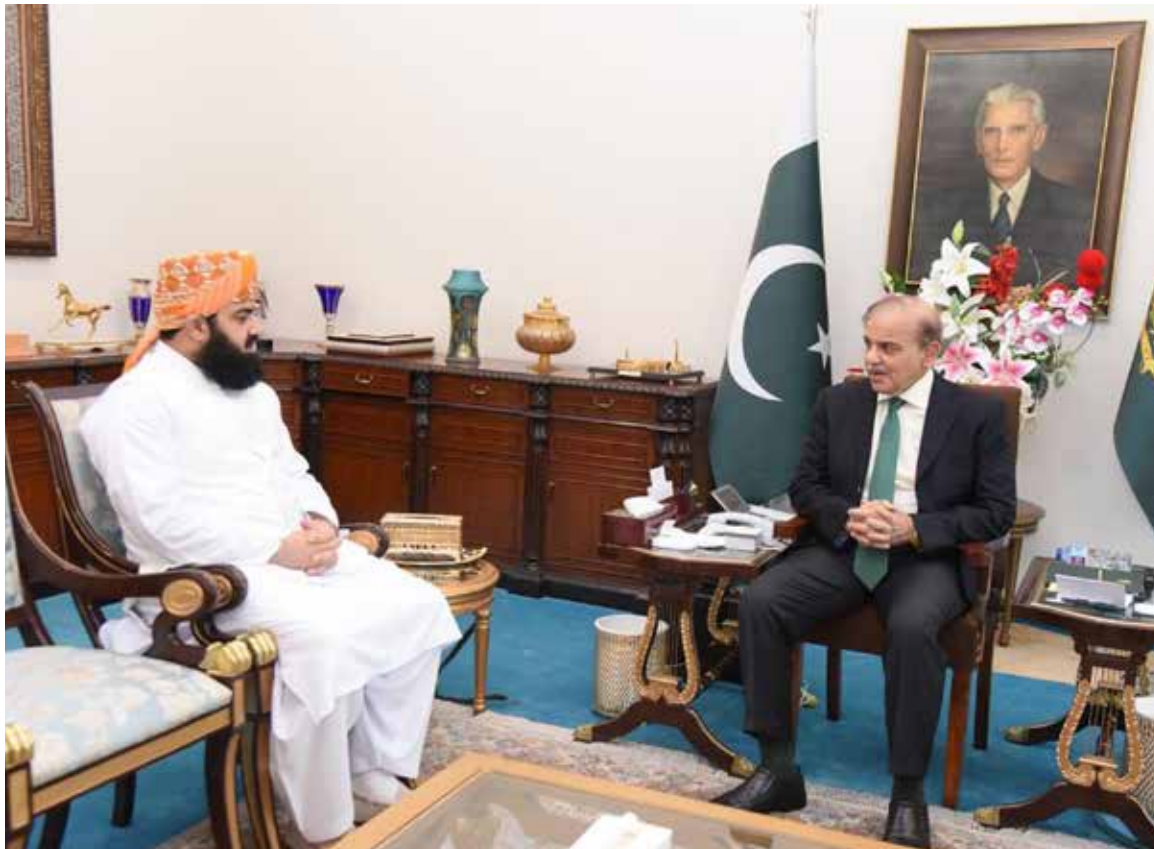
ISLAMABAD: Federal Minister for Communications Moulana Assad Mehmood calls on Prime Minister Muhammad Shehbaz Sharif.