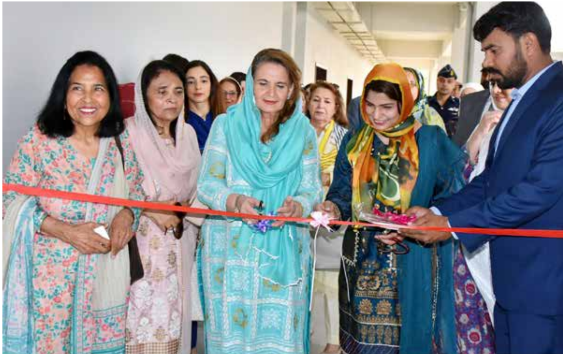
Alamabad (Swabi): First Lady Begum Samina Arif Alvi inaugurating Teachers Training Facility at AA Training Center at Rashid memorial welfare organization.