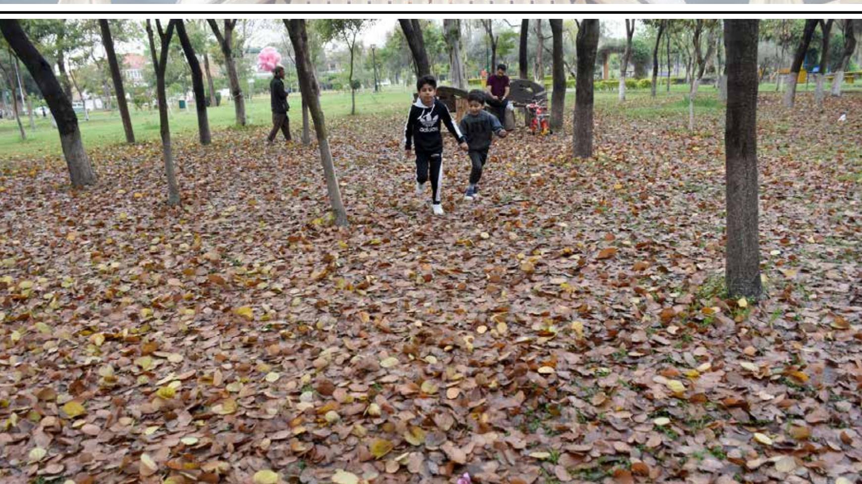
ISLAMABAD: Children are enjoying at Kachnar Park, in Federal Capital.

How much role are playing in availability of food items the completed and ongoing projects under the Ministry of National Food Security & Research and agriculture departments ?I will write an investigative article on the completed and ongoing pro-