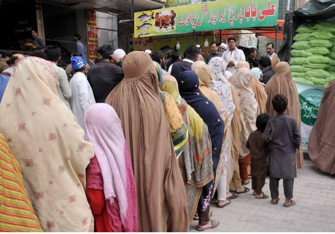
ISLAMABAD: A large number of women in a queue to collect government free flour in connection with Ramzan ul Mubarak at Khana pull in the Federal Capital.