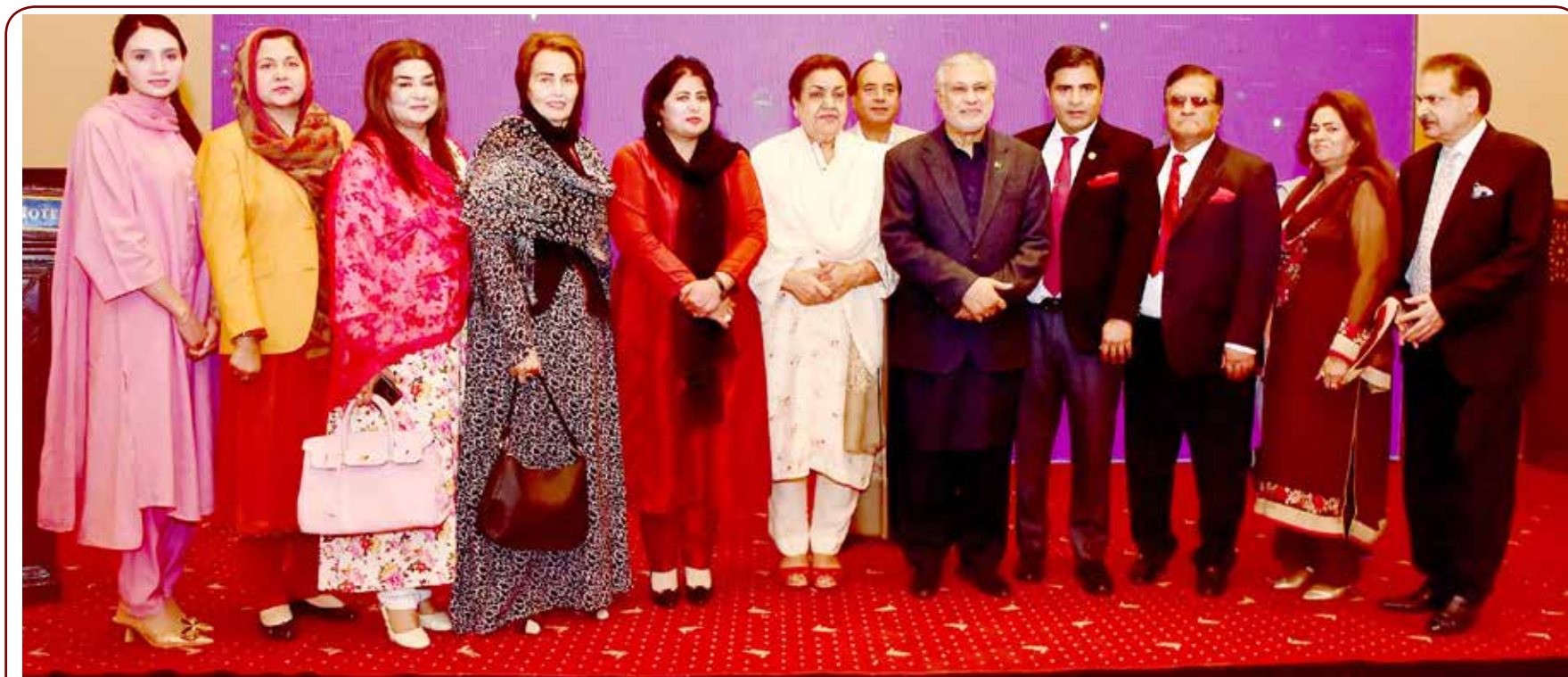
ISLAMABAD: Finance Minister Ishaq Dar posing for a group photo with the winners of the women awards during an Iftar dinner hosted by the ICCI.— Another picture and news on the Back Page.

PESHAWAR: The Sikh community in Peshawar has continued its goodwill gesture of serving food among fasting Muslims during the holy month of Ramzan with the objective of promoting love, fraternity, respect and honor among people of different faiths. Every year Sikh community living in different parts of the country including Peshawar, arrange Iftari (serving of food for breaking fast) and food distribution among fasting Muslims with the aim of reflecting the sentiments of reverence they had for holy month of Ramzan. As the fasting month of Ramzan begins, Sikh residents in Peshawar come out for arranging Iftar dinners, announcing special discounts on their shops for fasting Muslims besides helping the poor fasting faithful by providing them edible goods at their doorsteps. For ordinary citizens gathering of