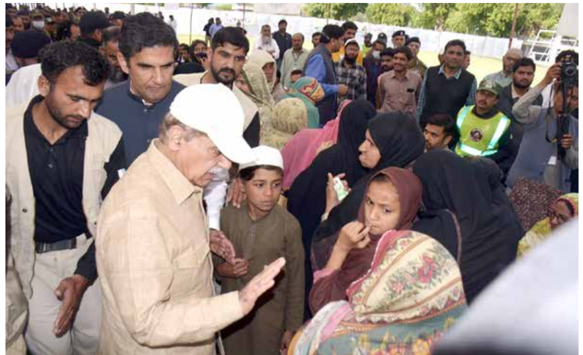
BAHAWALPUR: Prime Minister Shehbaz Sharif visits free flour distribution centers to overview the process of distribution.