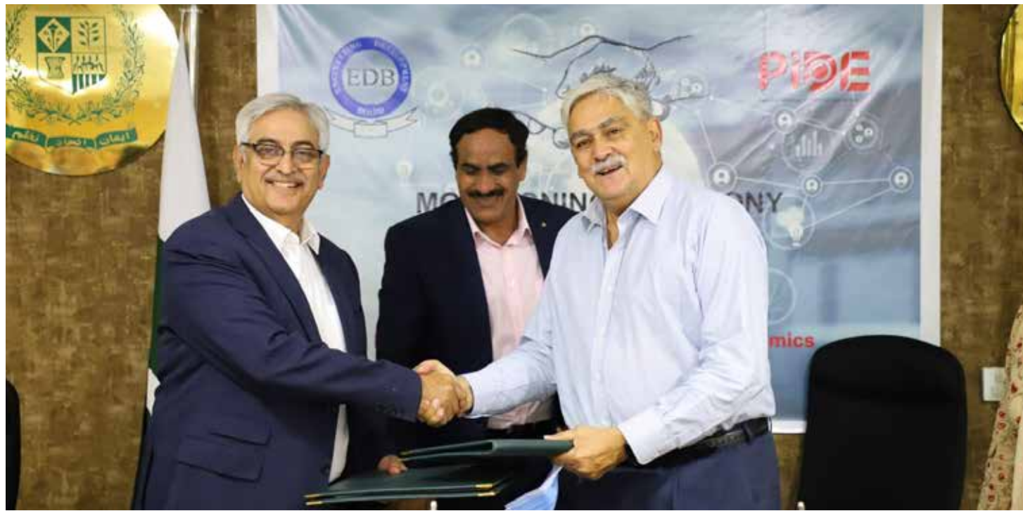
ISLAMABAD: A Memorandum of Understanding was signed between the Pakistan Institute of Development Economics (PIDE) and the Islamabad Engineering Development Board (EDB).