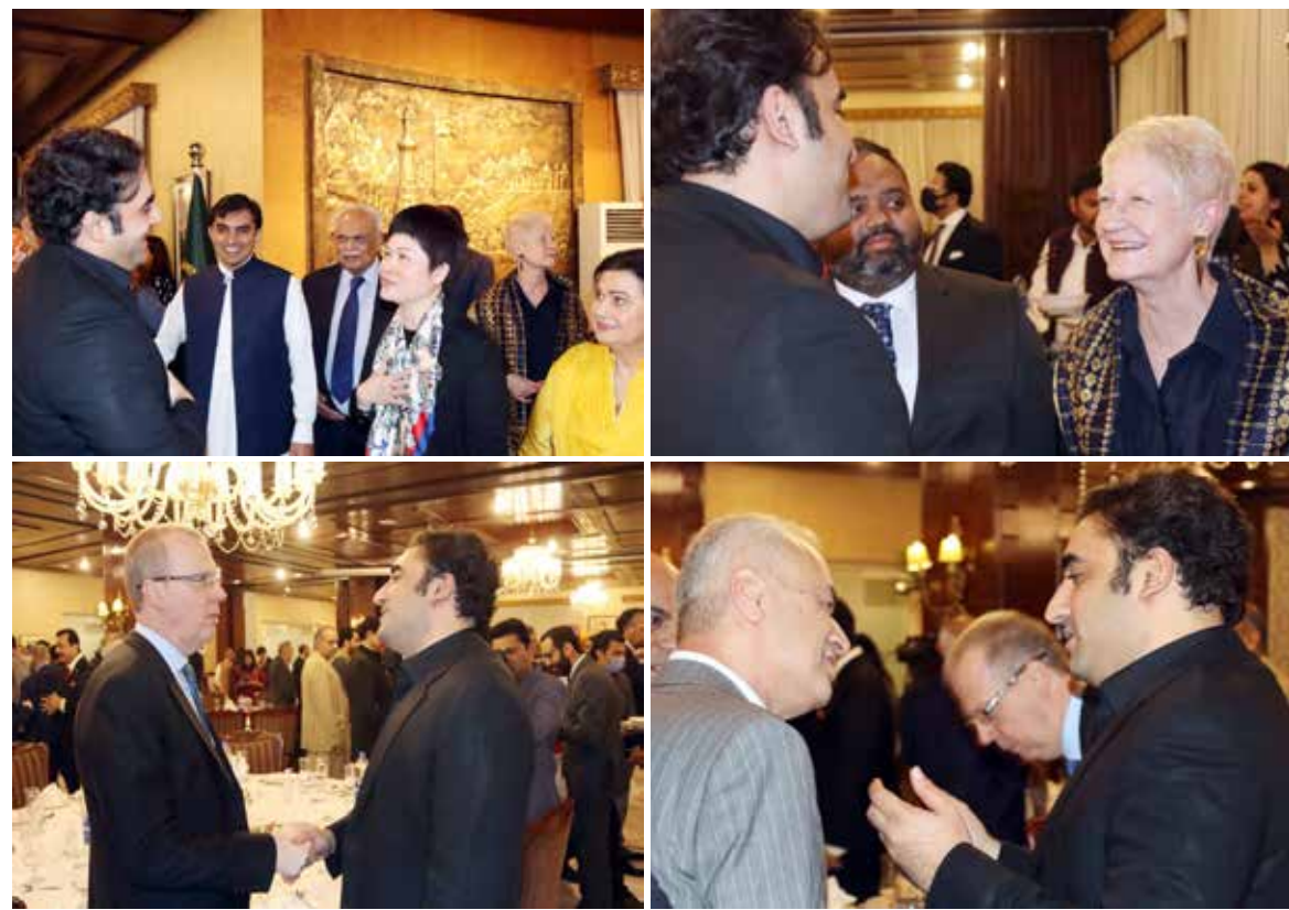
ISLAMABAD: Foreign Minister Bilawal Bhutto Zardari interacting with diplomats at an Interfaith Iftar dinner hosted in honour of the Diplomatic Corps, on Thursday, at the Ministry of Foreign Affairs.