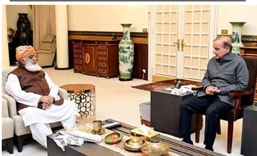
ISLAMABAD: President Jamiat Ulema e Islam (F) Maulana Fazal ur Rehman calls on Prime Minister Muhammad Shehbaz Sharif.