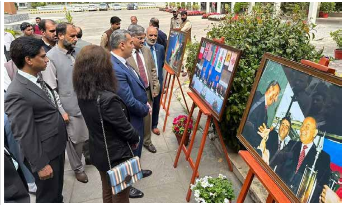
ISLAMABAD: Azerbaijan Embassy in Pakistan held a photo exhibition dedicated to the 100th birth anniversary of National Leader of the Azerbaijani people Heydar Aliyev at Allama Iqbal Open University, one of the leading higher education institutions of Pakistan.