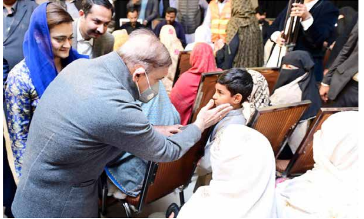
ISLAMABAD: Prime Minister Muhammad Shehbaz Sharif visits Free Flour Distribution Points established as part of Prime Minister's Ramzan Relief Package for deserving families.