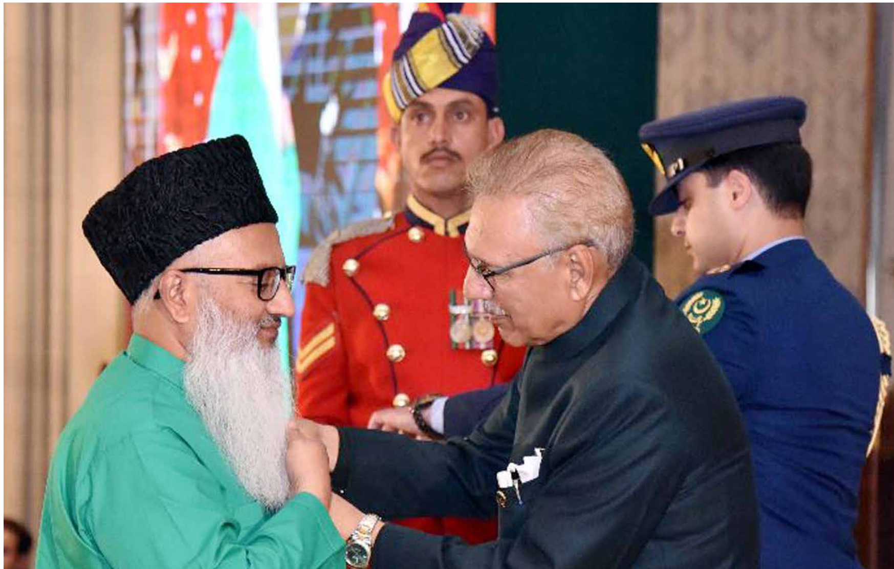
ISLAMABAD: President Dr Arif Alvi conferring the Pakistan Civil Award of Hilal-i-Imtiaz upon Muhammad Ramzan Chhipa in recognition of his services in the field of Public Service at the Investiture Ceremony on Pakistan Day, held at Aiwan-e-Sadr.