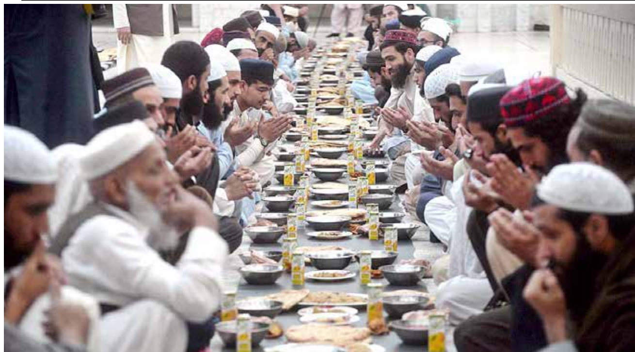
PESHAWAR: Faithful offering dua to break their fast on first day of holy Ramzan at Dervish Masjid.

KARACHI: In another bid to unlock the International Monetary Fund (IMF) programme, the State Bank of Pakistan (SBP) is likely to further raise the interest rate by 2% during its upcoming meeting of the Monetary Policy Committee (MPC), reported The News. The staff-level agreement between the IMF and Pakistan was scheduled to take place on February 9. However, the government failed to convince the global lender. The Shehbaz Sharif-led government is taking desperate measures to get the much-needed funds, but the IMF is not satisfied with the prior steps taken by the incumbent government. The sources said that the IMF demanded Pakistan to jack up the interest rate by 4%. The fund was of the view that inflation was lower in Pakistan as per the interest rate.