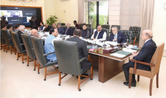
ISLAMABAD: Prime Minister Shehbaz Sharif chairs a meeting with regards to Ramadan Package for Islamabad.

ISLAMABAD: The Government of Japan has awarded MEXT (Ministry of Education, Culture, Sports, Science and Technology of Japan) Research Scholarships for Masters/Doctorate degrees to eleven (11) Pakistani students for academic year 2023-25 aiming to provide them with an opportunity to pursue higher studies in their respective fields at the prominent universities in Japan.