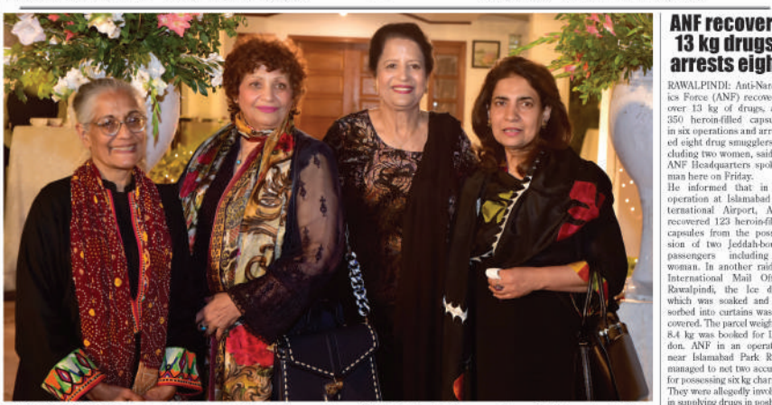
ISLAMABAD: Women posing for a picture on the occasion of the National Day reception of Lithuania.