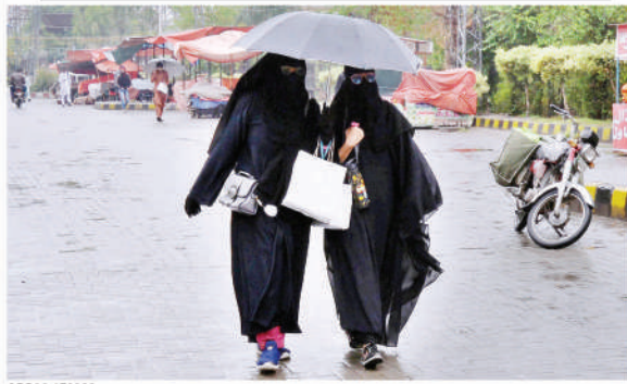
RAWALPINDI: Women heading towards their destination holding umbrella during rain in the city.—APP

The items which recorded a decrease in their average prices on a week-on-week (WoW) included onions (15.91%), chicken (5.97%), garlic (5.73%), pulse Masoor (2.27%), eggs (2.26%), LPG (1.90%), vegetables (1.84%), gas charges for 43 (108.38%), diesel (102.84%), tea lipton (81.29%), petrol (81.17%), rice irri-679 (78.75%), rice basmati broken (78.10%), bananas (77.44%), eggs (72.19%), pulse moong (69.44%), wheat flour (56.27%) and bread (55.38%). The commodities which recorded a decrease in their average prices on a YoY basis included tomatoes (21.87%) and chillies powdered (7.42%).—APP