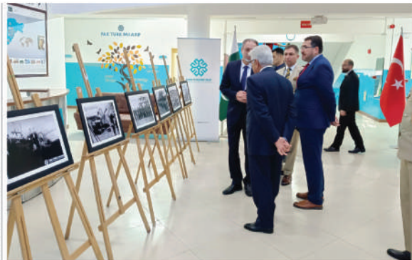
ISLAMABAD: Defence minister of Pakistan, Khawaja Asif along with Turkish ambassador witnessing photo exhibition during "18 March Chankakkale Victory and Martyrs' Day" and "Anniversary of Adoption of the National Anthem and Mehmet Akif Ersoy Memorial Day" ceremony which was organized in cooperation with Turkish embassy and Pak-Turk Maarif Int'l Schools.

"We need collective action as climate change cannot be tackled alone by one country or region." The minister said Pakistan was at the forefront of the most impacted countries due to climate change. She also added that international organisations and all countries had to find solutions together to combat climate change.