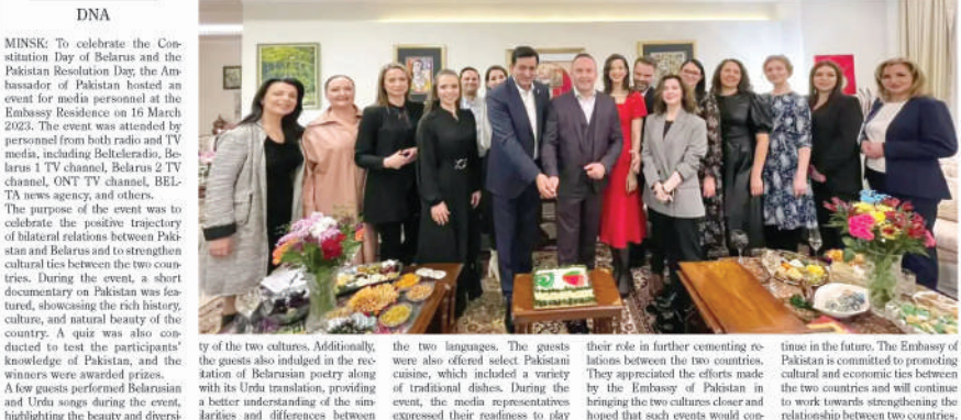
MINSK: To celebrate the Constitution Day of Belarus and the Pakistan Resolution Day, the Ambassador of Pakistan hosted an event for media personnel at the Embassy Residence on 16 March 2023. The event was attended by personnel from both radio and TV media, including BelteleRadio, Belarus 1 TV channel, Belarus 2 TV channel, ONT TV channel, BELTA news agency, and others. The purpose of the event was to celebrate the positive trajectory of bilateral relations between Pakistan and Belarus and to strengthen cultural ties between the two countries. During the event, a short documentary on Pakistan was featured, showcasing the rich history, culture, and natural beauty of the country. A quiz was also conducted to test the participants' knowledge of Pakistan, and the winners were awarded prizes. A few guests performed Belarusian and Urdu songs during the event, highlighting the beauty and diversity of the two cultures. Additionally, the guests also indulged in the recreation of Belarusian poetry along with its Urdu translation, providing a better understanding of the similarities and differences between the two languages. The guests were also offered select Pakistani cuisine, which included a variety of traditional dishes. During the event, the media representatives expressed their readiness to play their role in further cementing relations between the two countries. They appreciated the efforts made by the Embassy of Pakistan in bringing the two cultures closer and hoped that such events would continue in the future. The Embassy of Pakistan is committed to promoting cultural and economic ties between the two countries and will continue to work towards strengthening the relationship between two countries.

They appreciated the efforts made by the Embassy of Pakistan in bringing the two cultures closer and hoped that such events would continue in the future. The Embassy of Pakistan is committed to promoting cultural and economic ties between the two countries and will continue to work towards strengthening the relationship between two countries