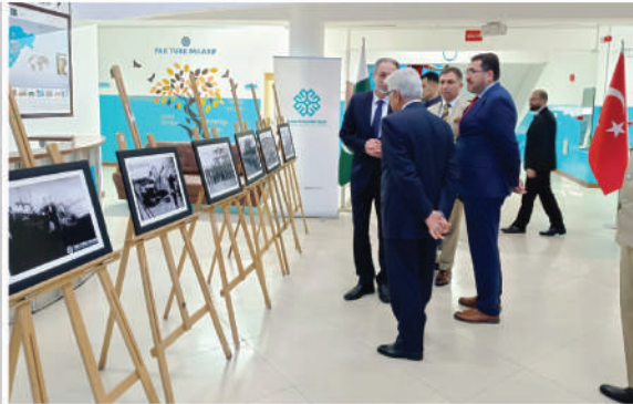
ISLAMABAD: Defence minister of Pakistan, Khawaja Asif along with Turkish ambassador witnessing photo exhibition during "18 March Canakkale Victory and Martyrs' Day" and "Anniversary of Adoption of the National Anthem and Mehmet Akif Ersoy Memorial Day" ceremony which was organized in cooperation with Turkish embassy and Pak-Turk Maarif Int'l Schools.

legislation should not be confined with policies as the provinces had to make their own laws as per their needs. "Pakistan is facing a financial crisis, the World Bank has an important role to play in dealing with climate change finance. Pakistan needs $348 billion for climate adaptation and mitigation by 2030. Even if Pakistan goes completely green, our emissions will not affect the global climate," Sherry Rehman said. The minister added that the country was not among the big carbon emissions emitters, yet it did not have the world's attention. The World Bank was created to eradicate poverty and ensure sustainable prosperity, she said, adding, "Today both the goals are challenged by climate change." She added that everyone in the world was scared by the speed of changing climate change. "Genova conference was a great success, but when funding comes, another disaster on the ground could hit. I urge the World Bank and other financial institutions to reconsider the eco-finance system," Sherry Rehman ended. Country Director for Pakistan, World Bank, Najj Benhassine, SAPM Muhammad Jehanzeb Khan, and others also addressed the Report launching ceremony.