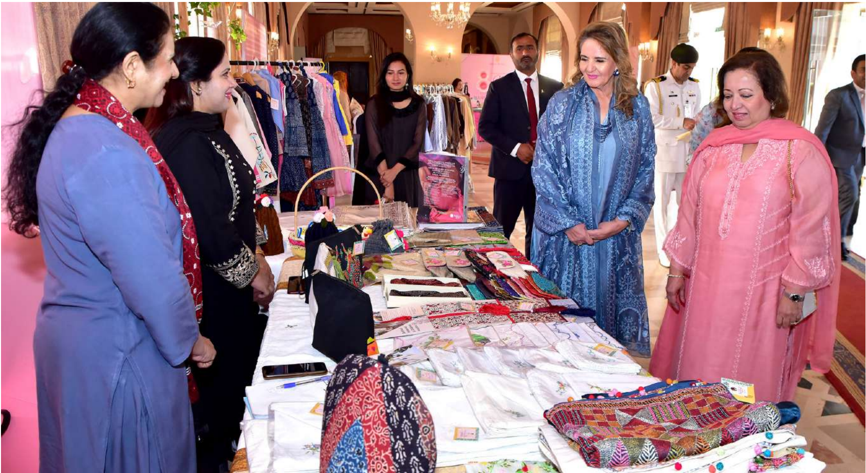
ISLAMABAD: First Lady Samina Alvi visiting various stalls on the occasion of Women Day function organized by Serena Hotels.