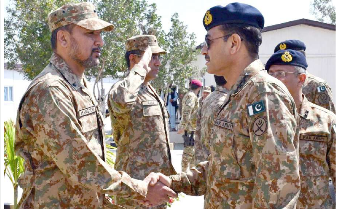
GWADAR: Chief of Army Staff General Syed Asim Munir meets the troops during visit to the port city of Gwadar.