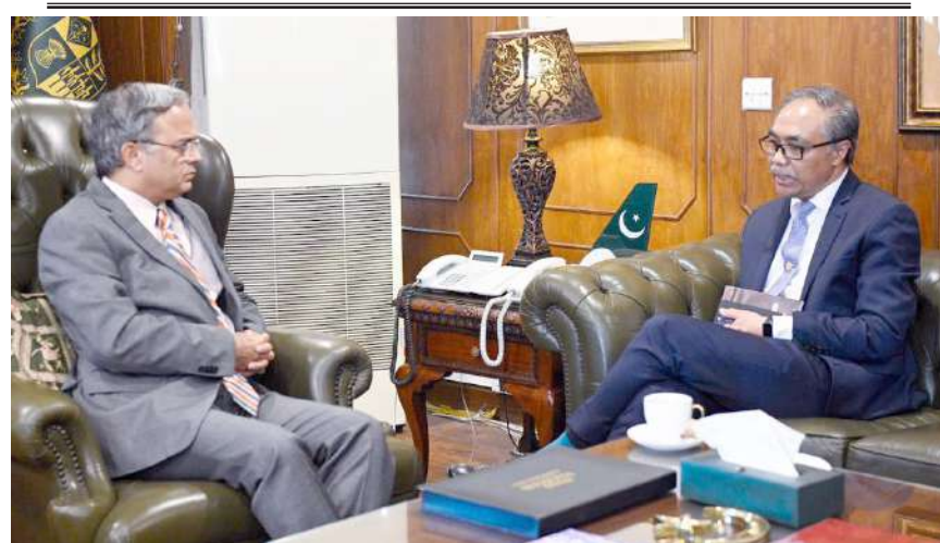
ISLAMABAD: Ambassador Adam Tugio of Indonesia called on the Foreign Secretary Asad Majeed Khan in the Ministry of Foreign Affairs and exchanged views on a wide range of issues of mutual interest. They resolved to enhance bilateral economic cooperation between two countries with particular focus on trade and investment. – DNA