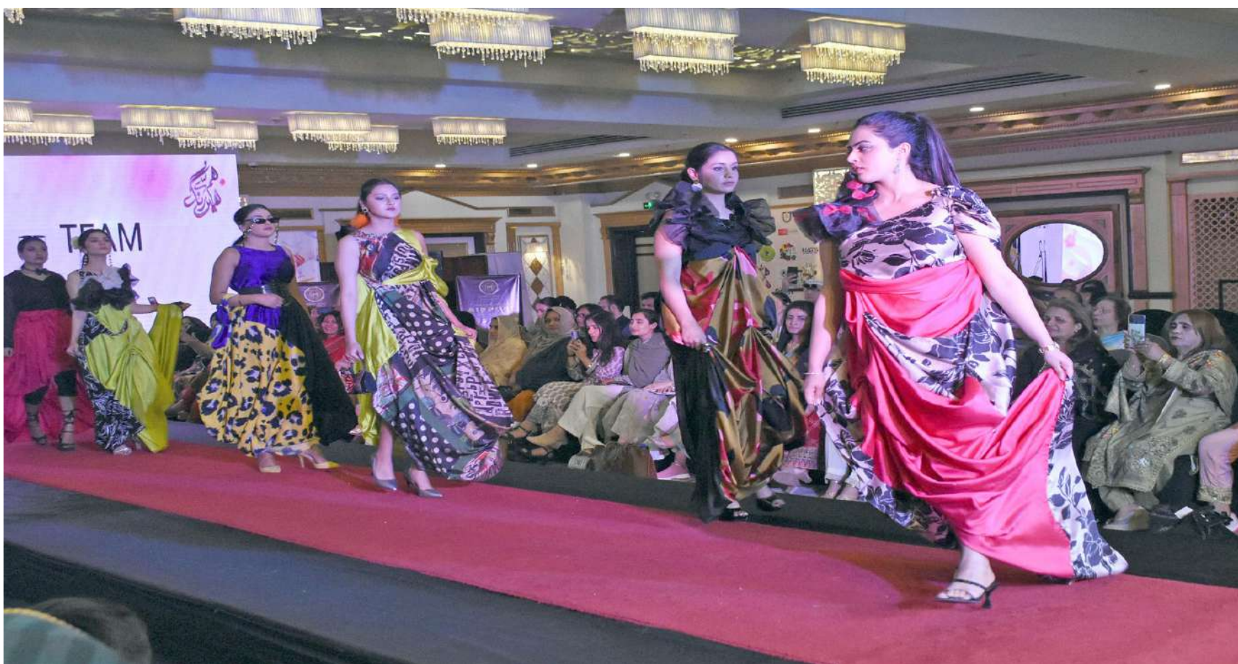
ISLAMABAD-Mar08: Models wearing party dresses walks on ramp during fashion show to mark the International Women's Day, at a local hotel, in Federal Capital, Organized by SAARC Chamber Women Entrepreneurs Council (SCWEC).