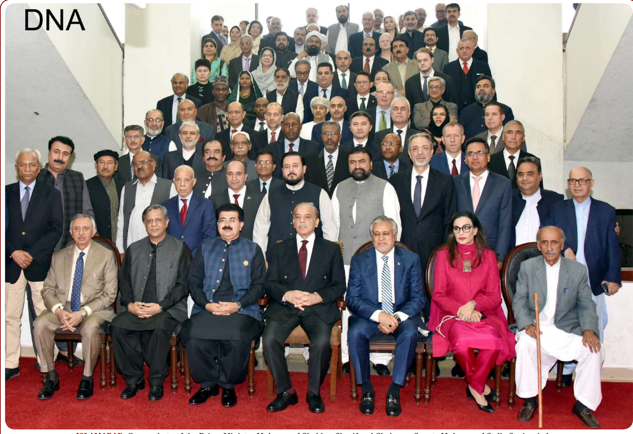
ISLAMABAD: Group photo of the Prime Minister Muhammad Shahbaz Sharif and Chairman Senate Muhammad Sadiq Sanjrani along with members of the Senate and diplomats on the eve of Golden Jubilee Celebrations of the Senate of Pakistan.

FRIDAY, MARCH 17, 2023 | WWW.ISLAMABADPOST.COM.PK