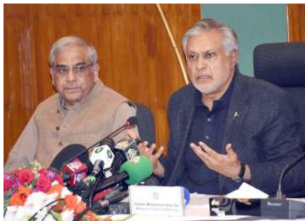
ISLAMABAD: Finance Minister Ishaq Dar addressing a press conference.

Condemns Khan's criticism, reveals an additional $500 million in "next few days" from China