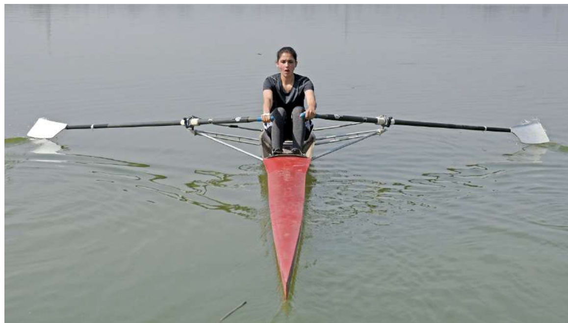
ISLAMABAD: A student take part during 9th Higher Education Commission Intervarsity Women Rowing Championship at Rawal Dam in Federal Capital, Organized by Rawalpindi Women University Directorate of Students Affairs.

MUNICH: Bayern Munich forward Sadio Mane is in the frame for a return to the starting lineup in Wednesday's second leg with Paris Saint-Germain, after manager Julian Nagelsmann on Friday promised "more minutes" for the returning striker. Speaking ahead of Saturday's Bundesliga clash at Stuttgart, Nagelsmann said Mane will continue his return following three months on the sidelines after a leg injury ruled him out of the World Cup. The Senegal forward made his first appearance since November when he came off the bench for 25 minutes in Sunday's 3-0 win over fellow title-chasers Union Berlin. Nagelsmann suggested that Mane would again feature off the bench against Stuttgart. "He's making a good impression. We will try and give him more minutes," said Nagelsmann. "It was a serious injury but his fitness levels are good. Sadio is part of the usual competition for spots." Nagelsmann said his side needed to "walk the tightrope" with team selections ahead of the "incredibly important game" against PSG while considering their push for domestic honours. Bayern hold a 1-0 advantage ahead of Wednesday's return Champions League fixture and sit equal on points with Borussia Dortmund in the league. Bayern could be three points behind at kickoff should Dortmund win Friday's home clash with RB Leipzig but Nagelsmann implied the priority was to ensure progression to the Champions League quarter-finals.