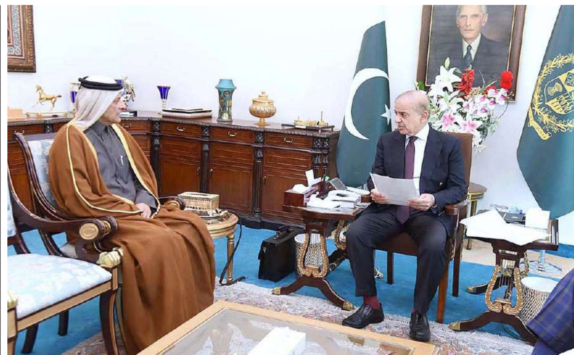
ISLAMABAD: Ambassador of Qatar, Sheikh Saoud Bin Abdul Rahman bin Faisal Al Thani calls on Prime Minister Shehbaz Sharif.

Maryam slams PTI over 'audio leak' Says they will 'puncture' all four tyres of the 'truck'