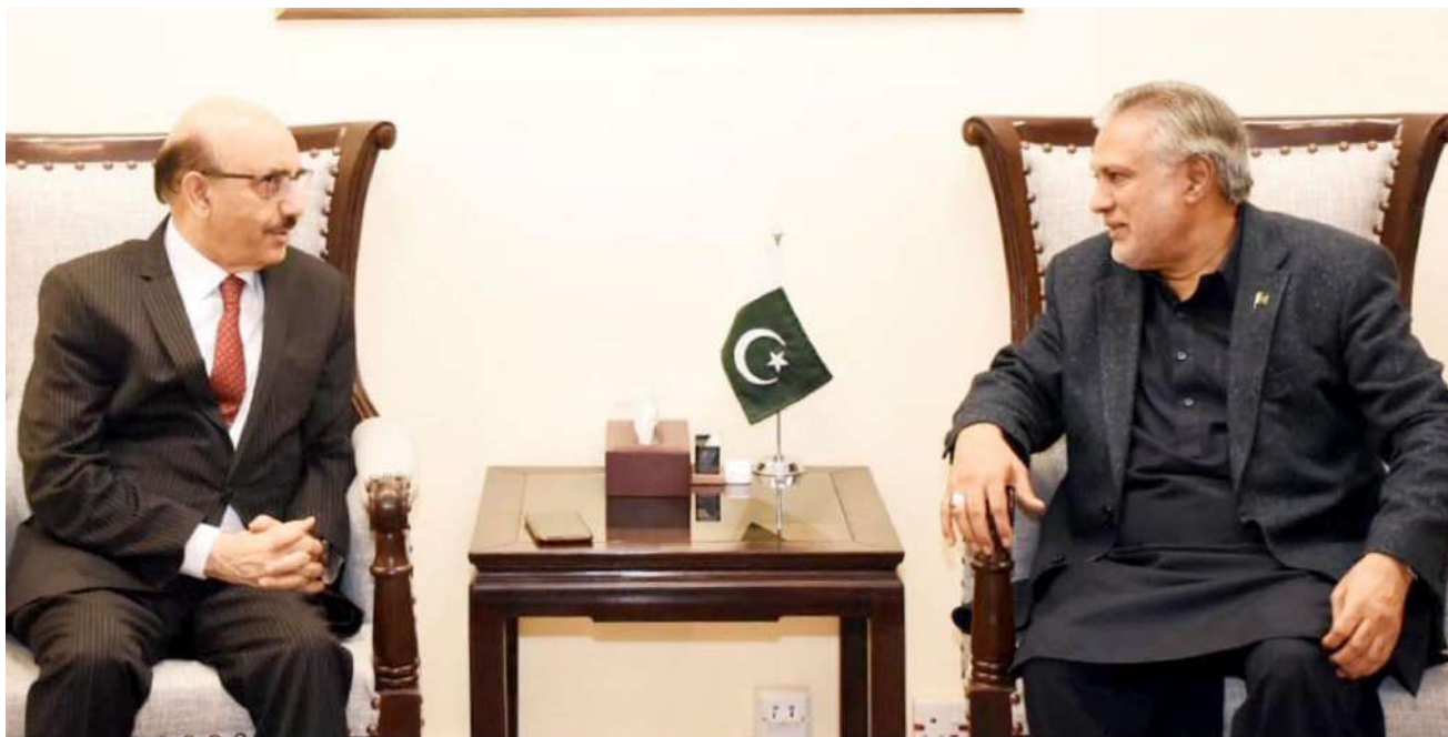
ISLAMABAD: Pakistan's Ambassador to US of America, Masood Khan calls on Finance Minister Ishaq Dar.

PHNOM PENH: Cambodian opposition leader Kem Sokha has been sentenced to 27 years under house arrest after being found guilty of treason following a three-year trial in which a judge deemed that his election campaigning and civil society work were designed to encourage a 'colour revolution'. The judge at the Phnom Penh Municipal Court told the former president of the Cambodia National Rescue Party (CNRP) that he would be banned from politics and voting in elections indefinitely. Nor would he be allowed to meet anyone outside his family while under house arrest. Kem Sokha was arrested in September 2017 without a warrant in a midnight raid on his home and taken to a provincial jail.