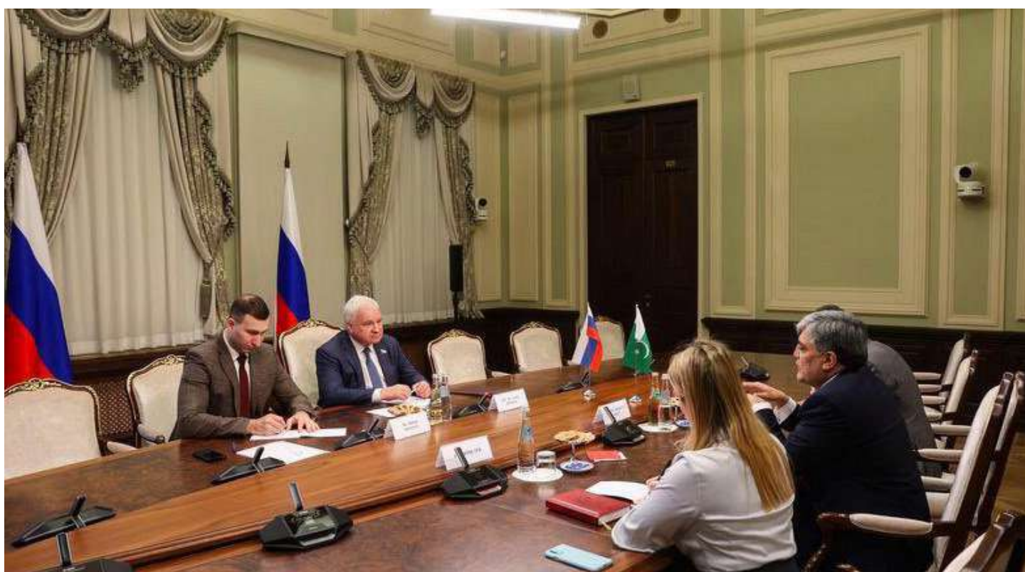
MOSCOW: Amb Shafqat Ali Khan called on Senator Andrey Denisov Vice Chair of the Foreign Relations Committee of the Federation Council. Views were exchanged on bilateral relations, ideas to enhance parliamentary cooperation & topical issues of regional & international politics.—DNA

they can be exposed to in the future. (The state) has done a lot of work to prevent the fallout but we still have work to do," he said. Most of Türkiye is located on the Anatolian tectonic plate, which sits between two major plates, the Eurasian and African, and a minor one, the Arabian. As the larger African and Arabian plates shift Türkiye is being literally squeezed, while the Eurasian plate impedes any northward movement. Thus, Türkiye sits on several fault lines. Türkiye also risks aggravating forest fires amid concerns over climate change that intensifies the severity and size of fires, while floods because of unprecedented precipitation claimed dozens of lives in the country's north in 2021.—Agencies