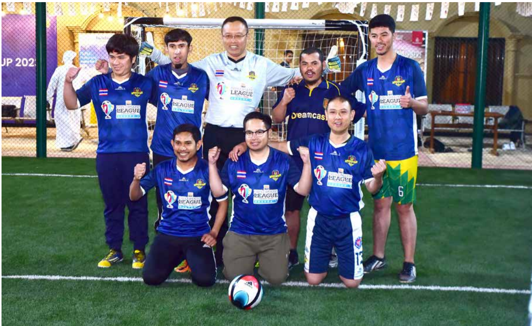
ISLAMABAD: Thailand Football team posing for a picture during Diplomatic Football league match played at the UAE embassy. – DNA

FROM PAGE 01 The Ambassador of the United Arab Emirates appreciated development-oriented economic policies of Pakistan initiated by the present government and expressed the interest of the UAE in augmenting and furthering investment in various sectors of the economy of Pakistan. Finance Minister Senator Ishaq Dar welcomed the investment proposals of the UAE in Pakistan and extended full support and cooperation by the government.