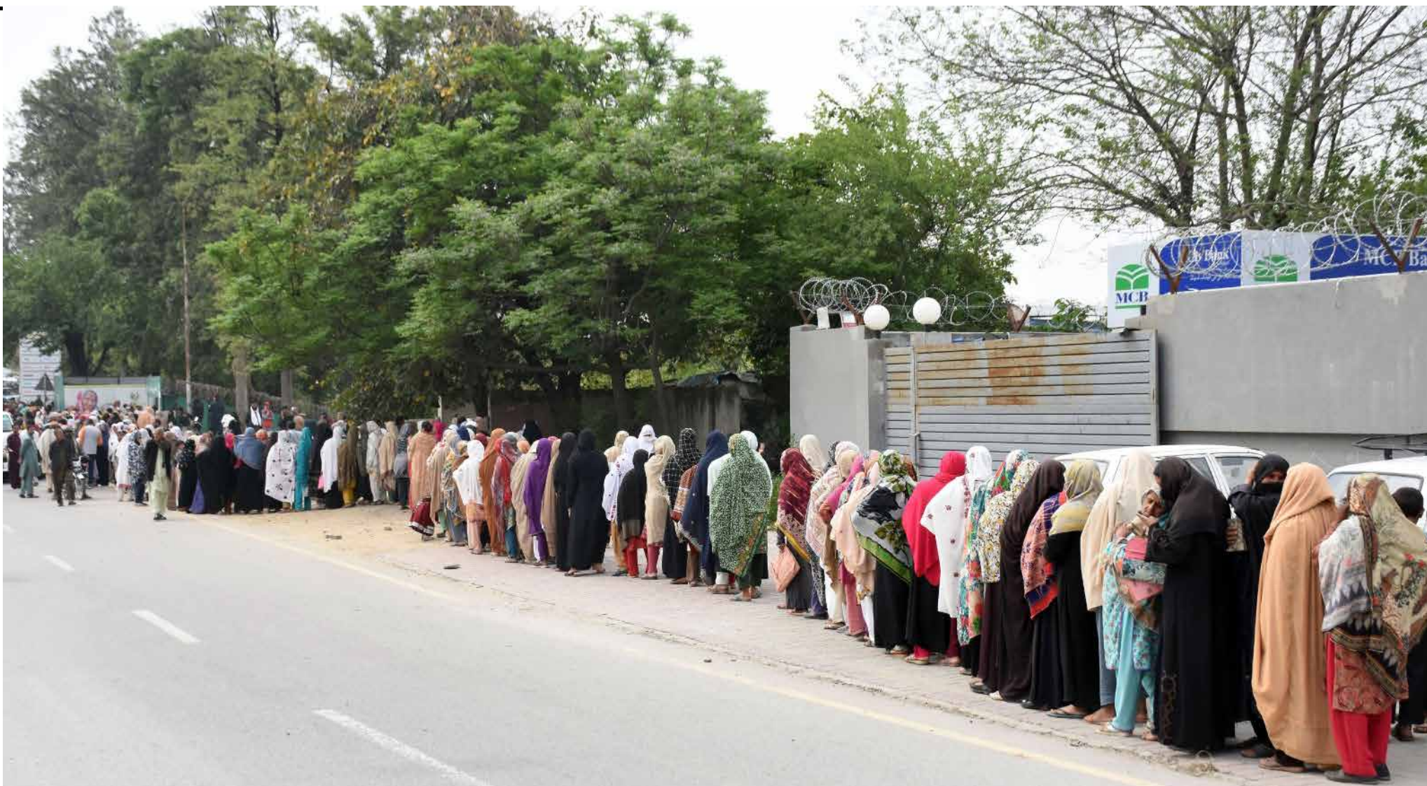
ISLAMABAD: A large number of deserving people stand in long queue outside Benazir Income Support Program (BISP) Center to take monthly support Income at Sector G-7 in Federal Capital.