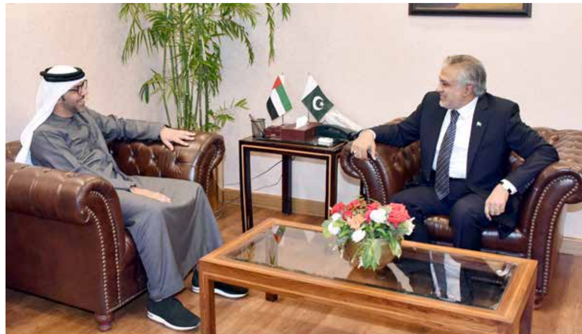
ISLAMABAD: Finance Minister Ishaq Dar in a meeting with Ambassador of UAE Hamad Obaid Ibrahim Al-Zaabi.