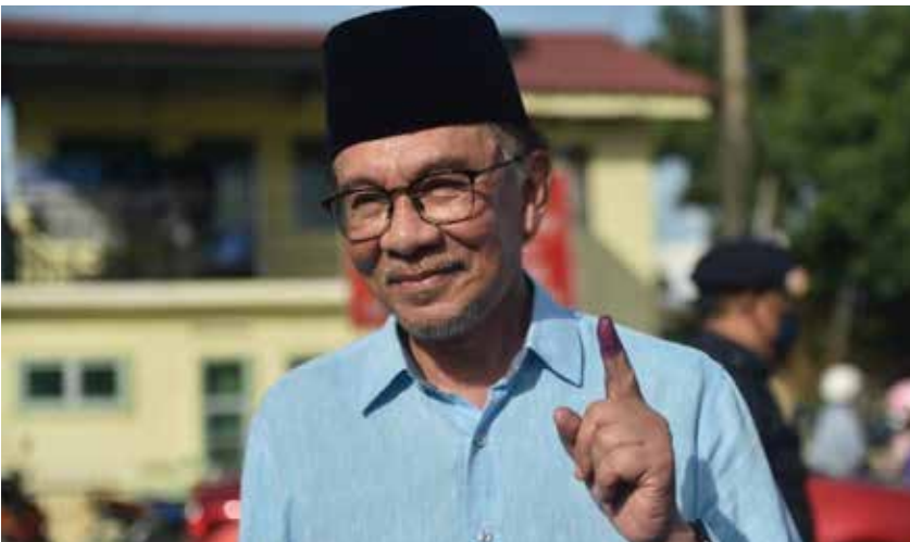
Asian region should continue to be led by the 10-member ASEAN with its policy of neutrality and as a zone of peace while having good relations with all countries. The mineral-rich warm waters of the South China Sea have long been the subject of contention between China and some regional countries, with the US siding with countries opposing China's claims.

KUALA LUMPUR: Malaysian Prime Minister Anwar Ibrahim has called for a dialogue to resolve the longstanding dispute over the South China Sea, observing that the problem is not "insurmountable." There is no easy solution to the overlapping territorial claims in the South China Sea, nor is the problem insurmountable as long as there is dialogue, Ibrahim, who visited Beijing last week, said in an interview published Tuesday by the Chinese English daily China Daily. Stressing that the South China Sea issues should not be "that contentious," Ibrahim called for dialogue with other Association of Southeast Asian Nations (ASEAN) member states that also claim a stake in the rich resources of the sea to resolve the differences. "I believe that there is no easy solution to that problem. As we think of each other as friends, we continue to have dialogue, this problem is not insurmountable," he added. He expressed satisfaction that the Chinese leadership had agreed to take the position of engaging in dialogues and promoting proper understanding of