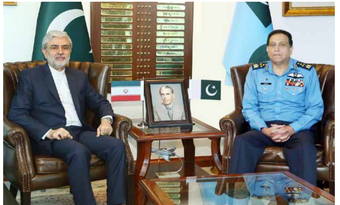
ISLAMABAD: Ambassador of Iran, Seyed Mohammad Ali Hosseini calls on Air Chief Marshal Zaheer Ahmed Baber Sidhu.