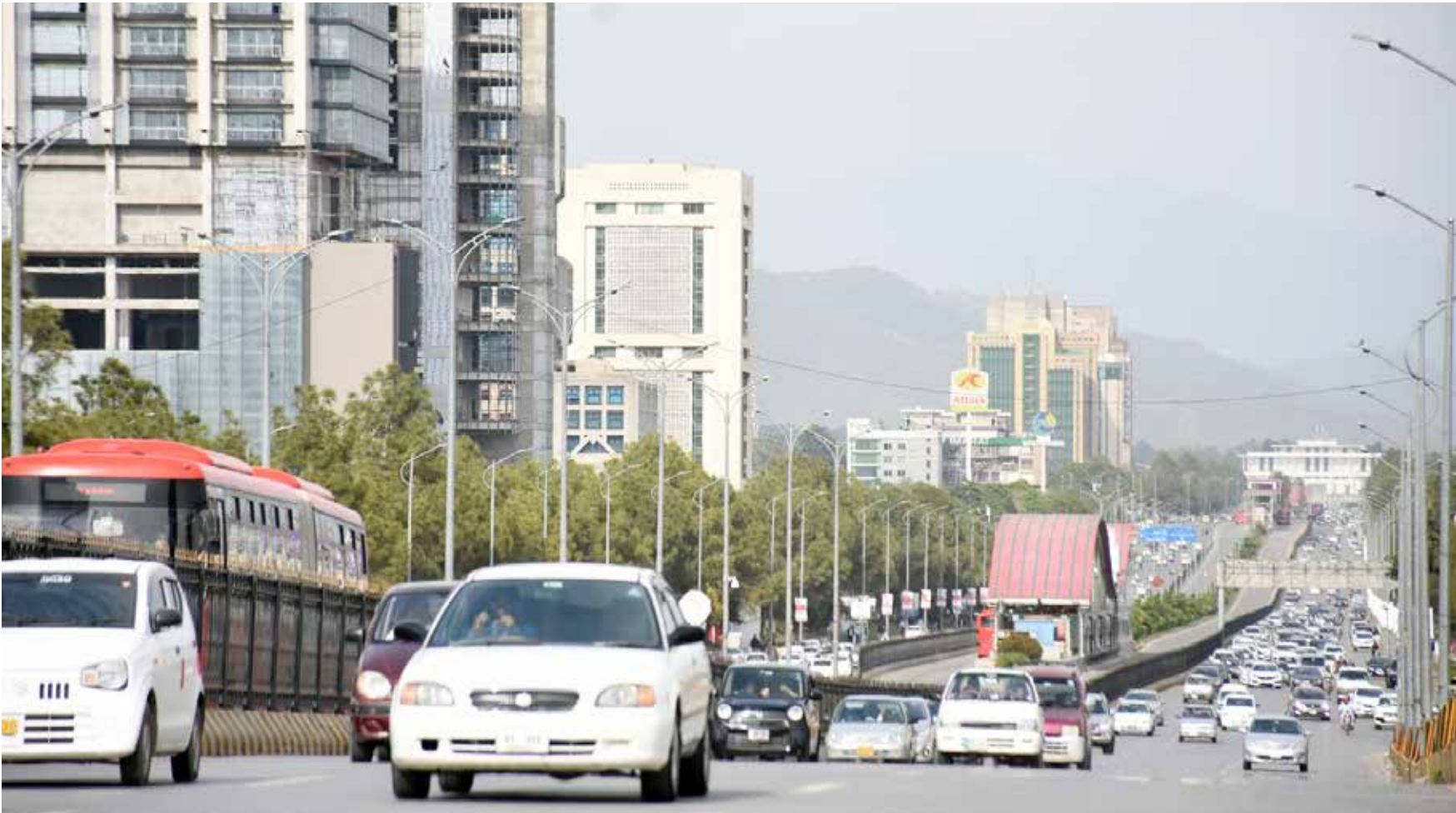
ISLAMABAD: Motorists are on their way at Jinnah Avenue as people are leaving back to their houses as per Notification of Establishment Division the public offices under the Federal Government timings are 7:30 AM to 01:30 PM, in Federal Capital.

PTI Chief Imran Khan. "Imran gets bail in just two hours," she raved. She said that except these 3-4 judges, the rest of judges are with the people. "A jackal who calls himself a leader, when he comes out of his house, he covers his head with a black box. Imran and his facilitators know that he is guilty," she said vociferously. Maryam wondered that never a court gave an epithet of Sicilian mafia to any dictator, nor did it disqualify a dictator. "Whenever a court disqualified a ruler, it was anelected prime minister," she lamented. The PML-N leader said that the PTI people keep on humiliating judges. They reach courts in the form of groups, she added. She said that she is not afraid of disqualification, she had been disqualified for six years. Maryam said that five-member bench announced that Imran Khan violated the constitution. "Is it a minor crime to violate the constitution?" she wondered. Earlier, Pakistan Muslim League-Nawaz chief organizer Maryam Nawaz arrived at Rawalpindi Judicial Complex. A large number of lawyers also arrived at the judicial complex.