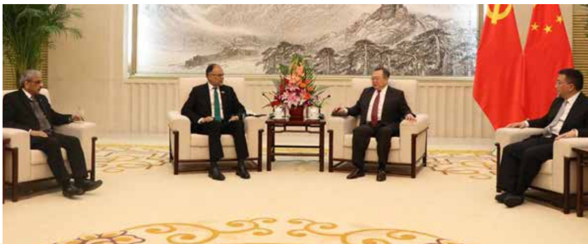
Beijing: Federal Minister for Planning, Development, and Special Initiatives Ahsan Iqbal meeting IDPCP Minister Liu Jianchao in Beijing.

BEIJING: Minister for Planning, Development and Special Initiatives Ahsan Iqbal said that friendship and strategic partnership with China enjoyed broad political support in Pakistan and acknowledged the International Department of Communist Party of China (IDPCP)'s role in promoting better understanding and deepening relations between the two countries.